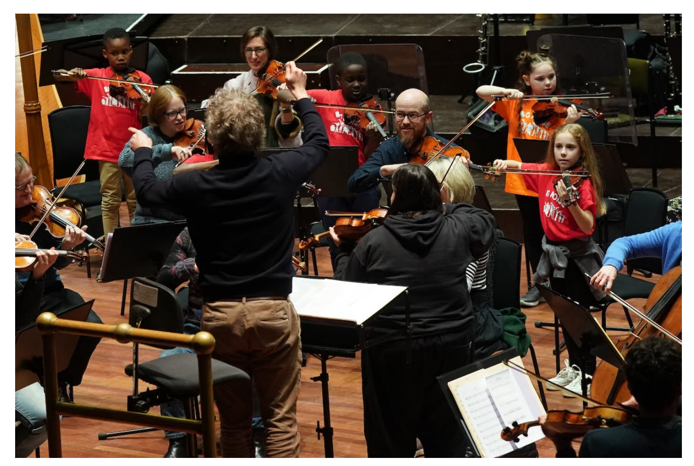
Sistema RNSO 1 SA:

Sistema — Big Noise Westerhailes and the RNSO at the Usher Hall Edinburgh.