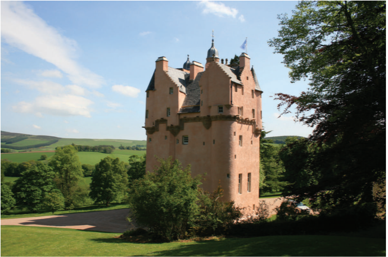
Craigievar Castle Alford