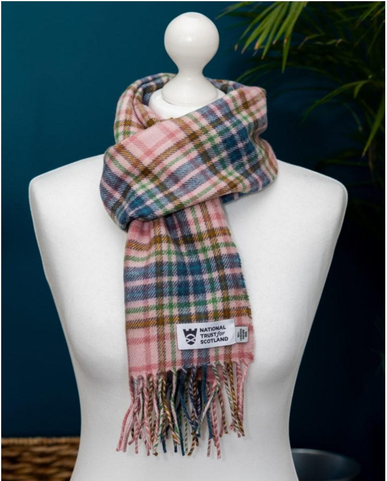
A scarf in the new tartan