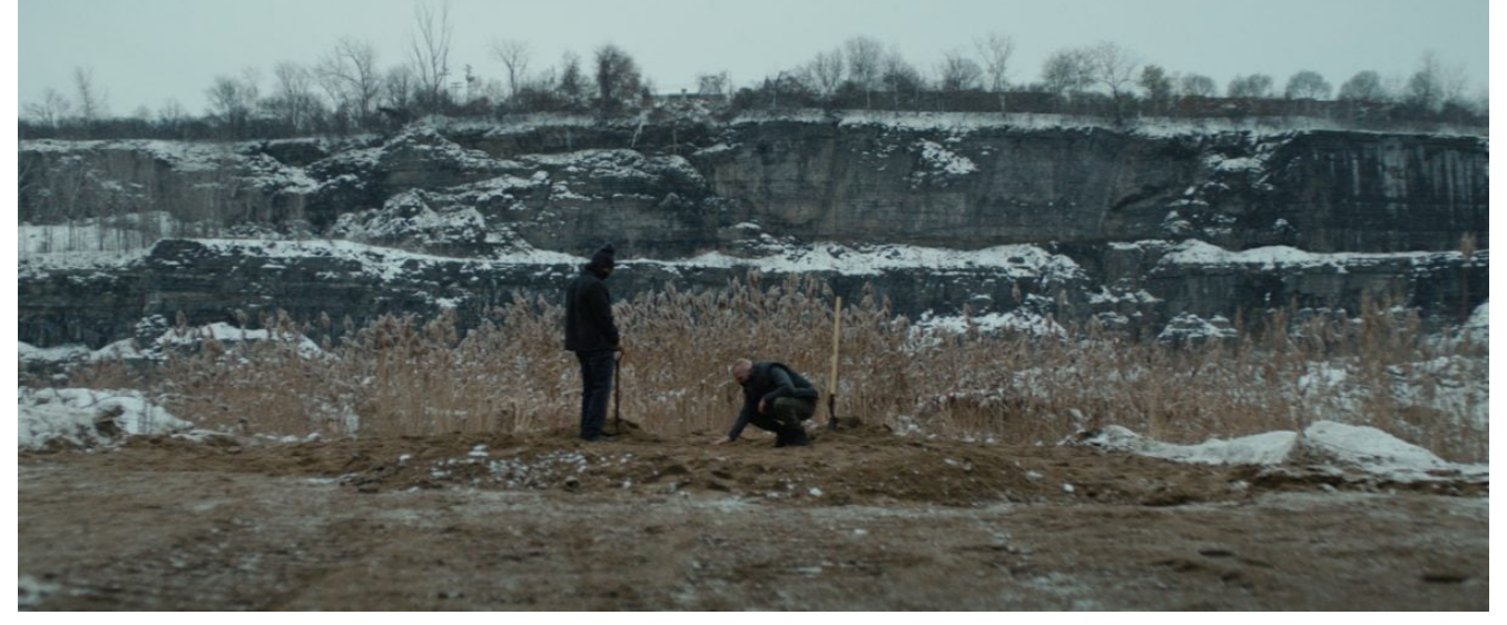
Image from movie thriller The G which had its UK premiere at The Glasgow Film Festival