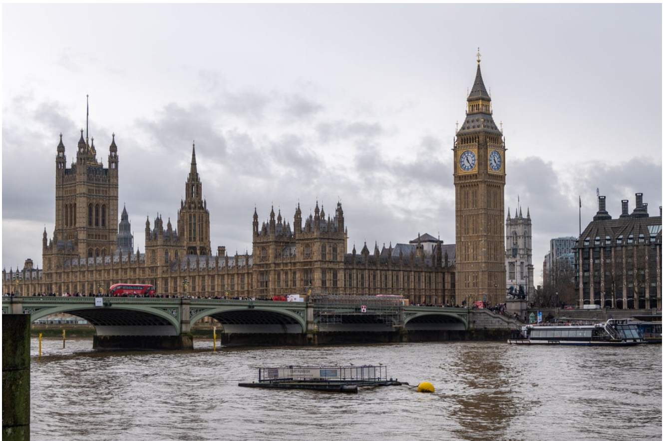
House of Commons Westminster