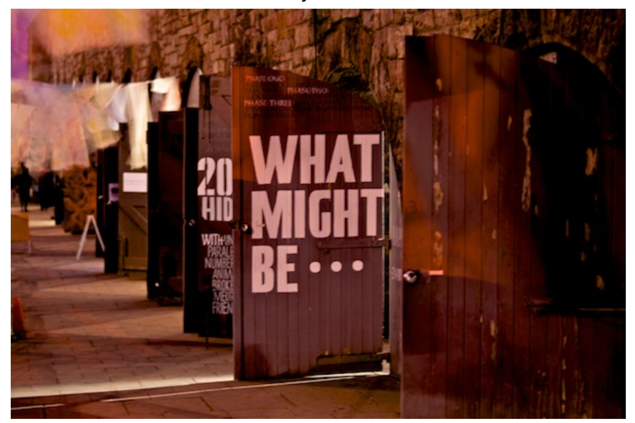
Hidden Door 2014 at Waverley Arches