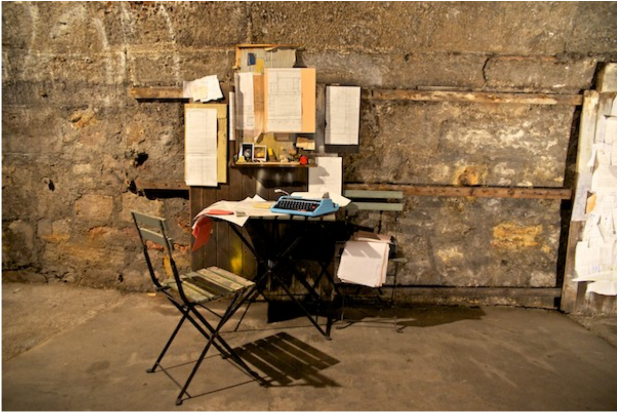
Hidden Door 2014 at Waverley Arches