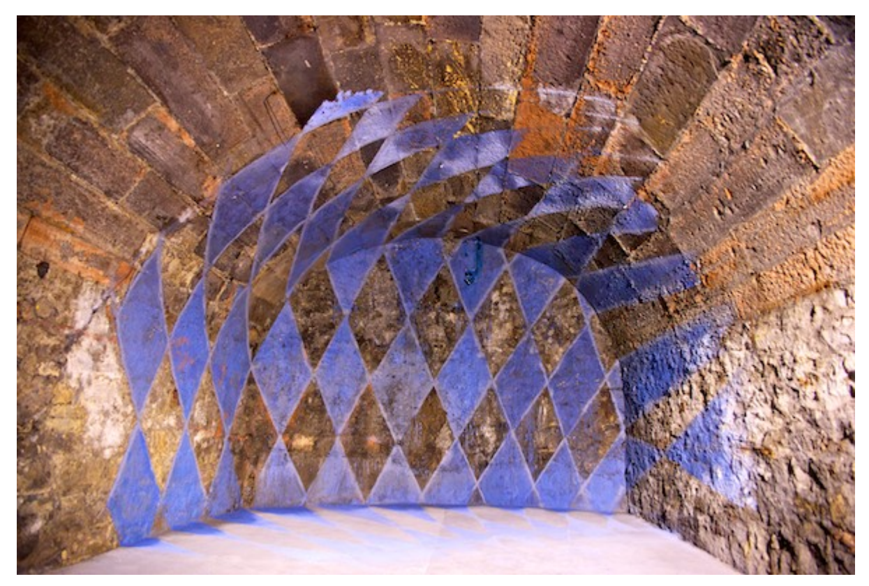
Hidden Door 2014 at Waverley Arches