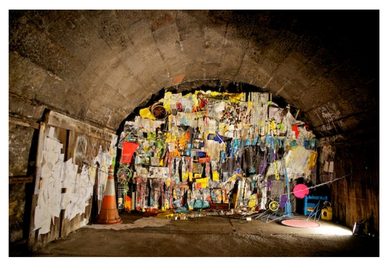
Hidden Door 2014 at Waverley Arches