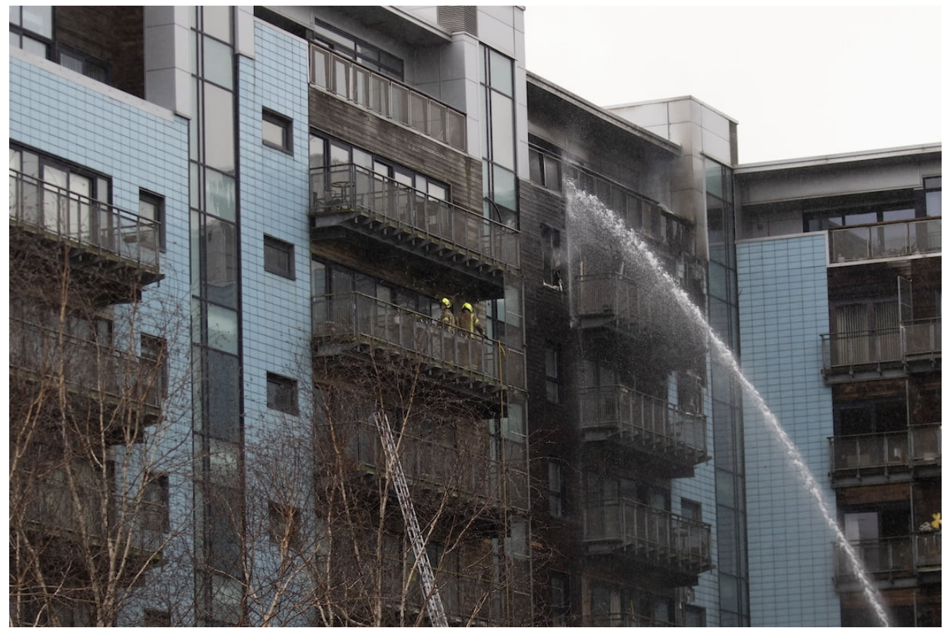
Fire at Breadalbane Street just off Bonnington Road led to 100 people being evacuated from their homes