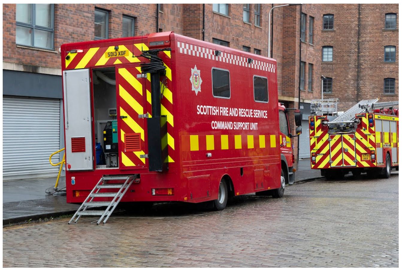
Fire at Breadalbane Street just off Bonnington Road led to 100 people being evacuated from their homes

- Graham Simpson (@GrahamSMSP) March 14, 2024