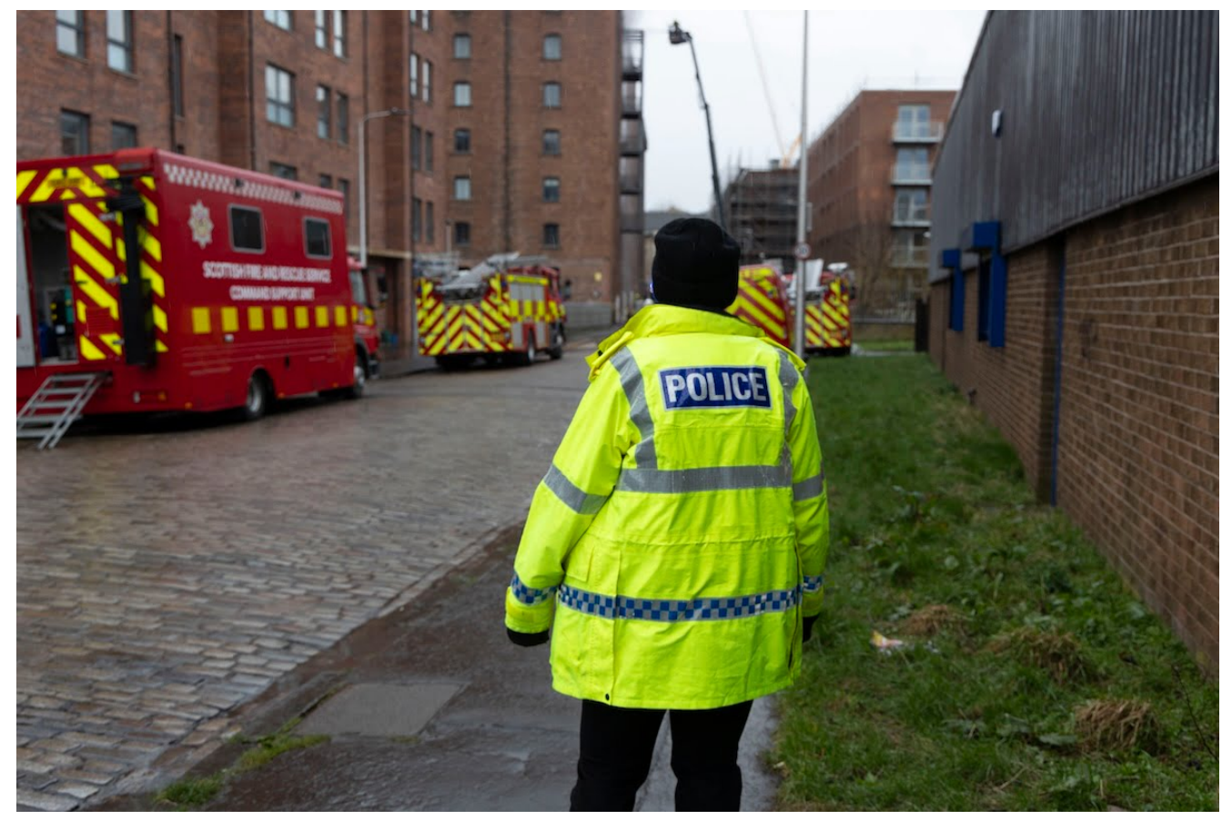
Fire at Breadalbane Street just off Bonnington Road led to 100 people being evacuated from their homes