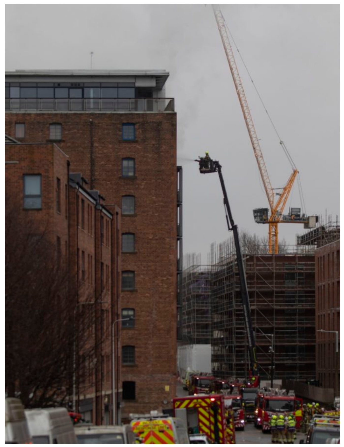
Fire at Breadalbane Street just off Bonnington Road led to 100 people being evacuated from their homes