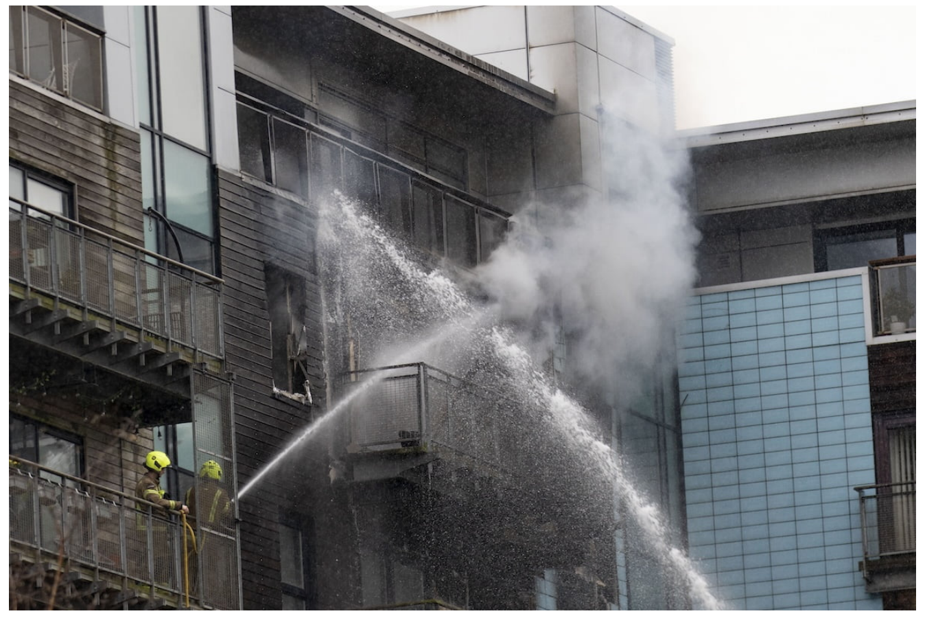
Fire at Breadalbane Street just off Bonnington Road led to 100 people being evacuated from their homes