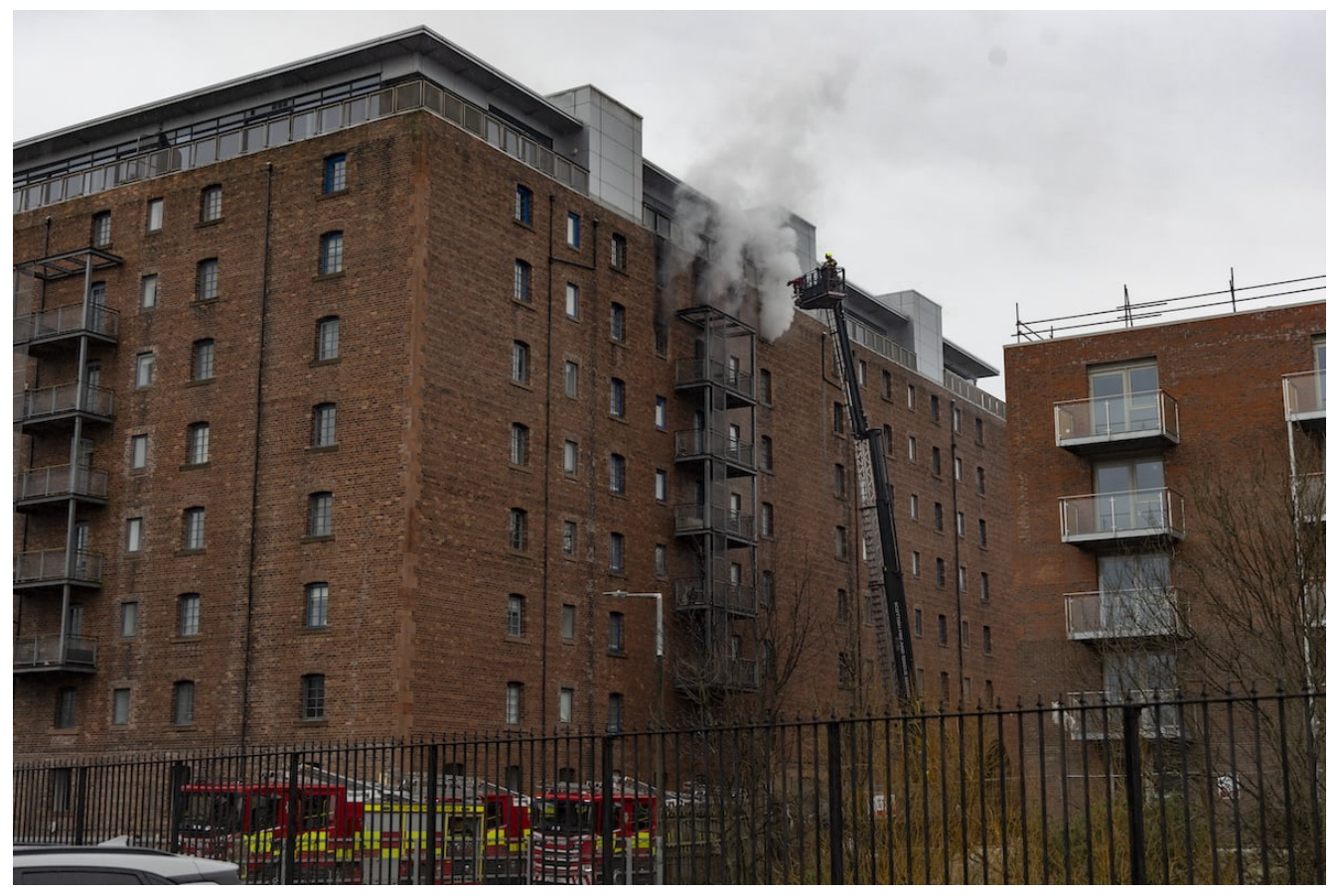
Fire at Breadalbane Street just off Bonnington Road led to 100 people being evacuated from their homes