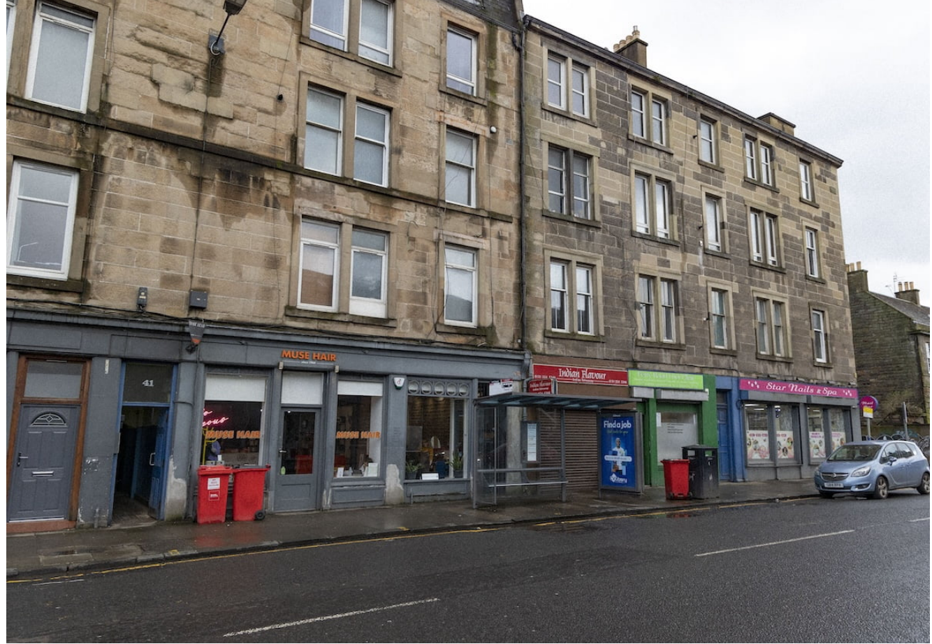
Ferry Road