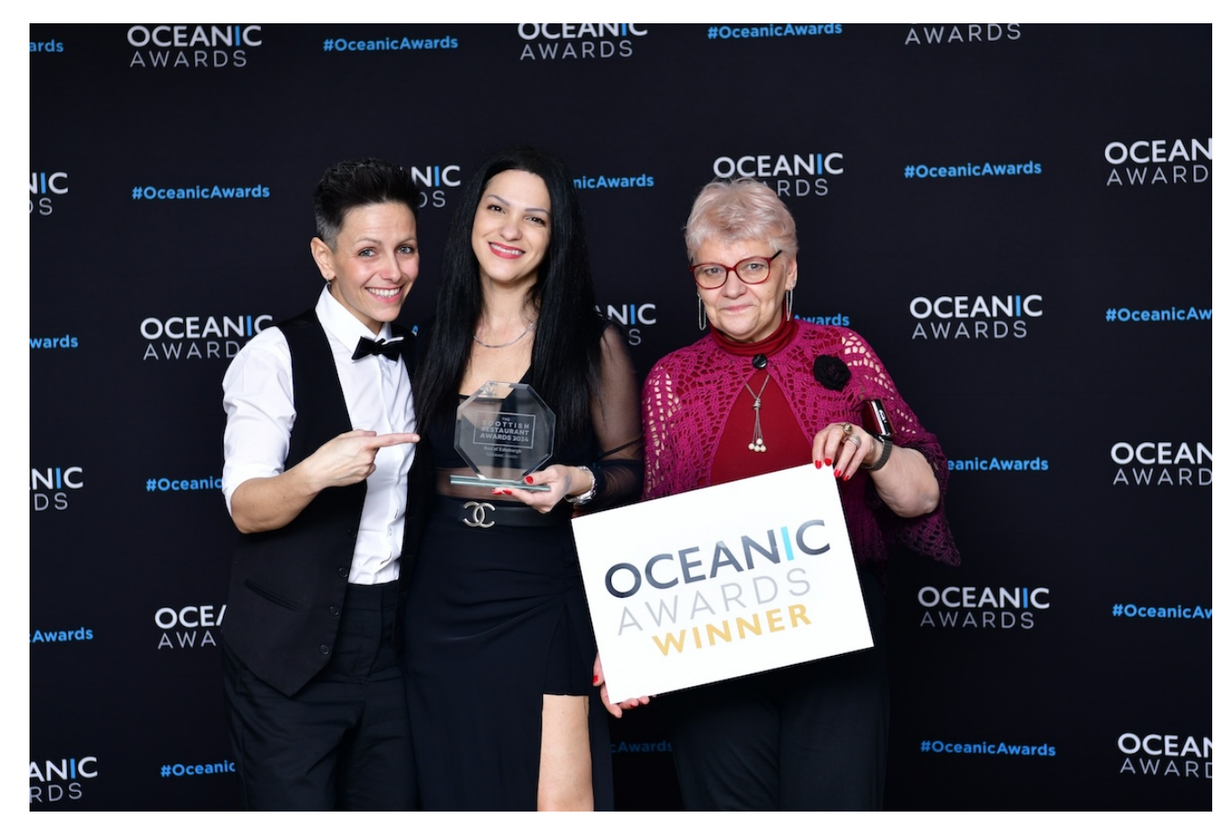
Novapizza Vegan Kitchen