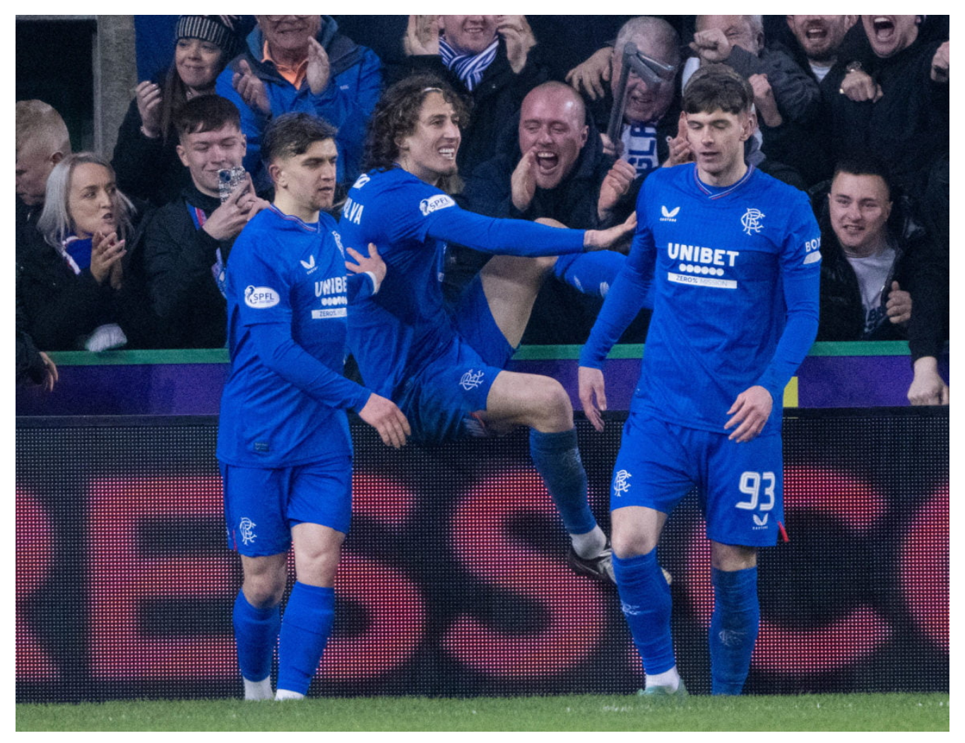
Scottish Cup Quarter-final — Hibernian v Rangers 10/03/2024

as Hibernian take on Rangers in the quarter finals of the Scottish Cup at Easter Road Stadium, Edinburgh, UK