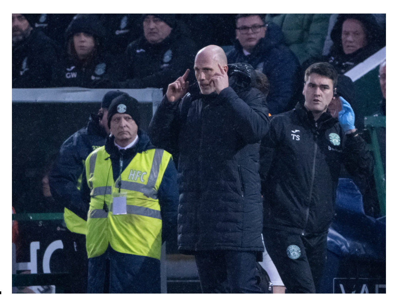
Scottish Cup Quarter-final — Hibernian v Rangers 10/03/2024

After a battling encounter there is no rest for Hibs as they face Ross County and Livingston in the coming six days, games that they really should win if they are to compete for those European qualification places.