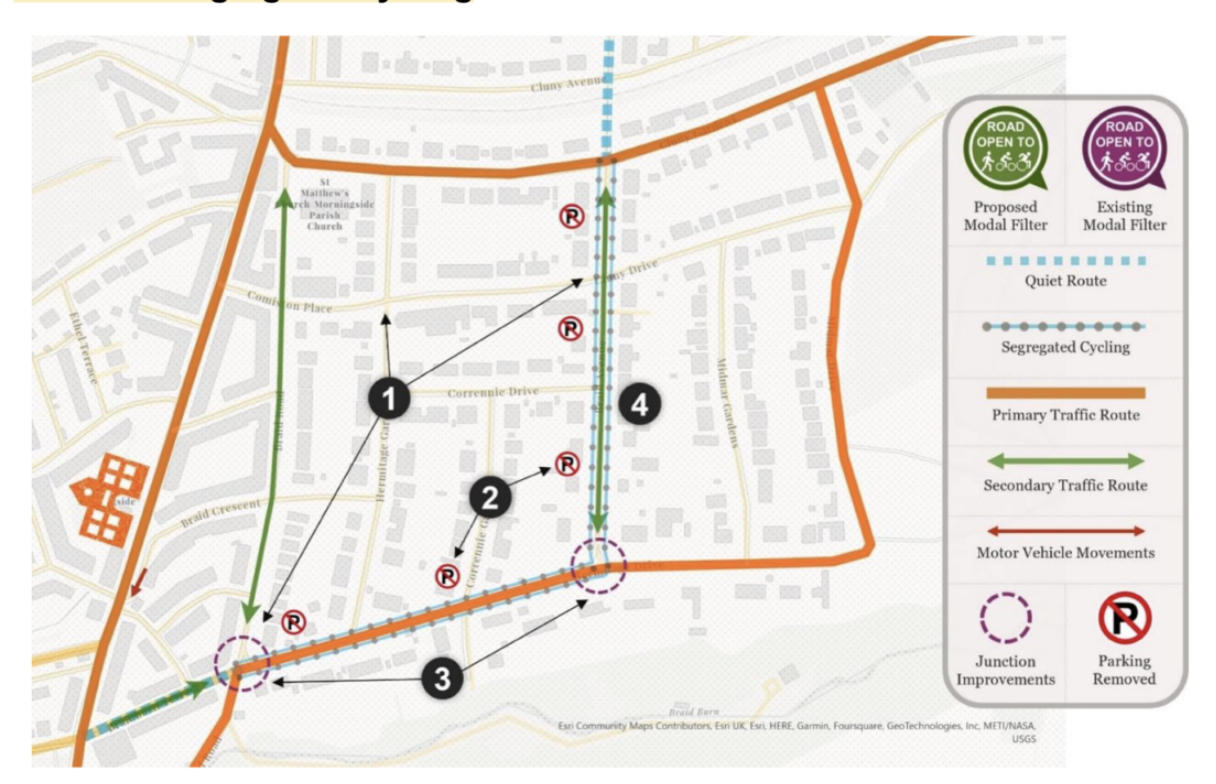
Option 3 – Remove all existing measures within the Braid Estate and introduce segregated cycling