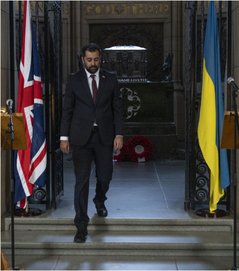
24/2/2024 First Minister Humza Yousaf attended Ukrainian memorial service at Edinburgh Castle