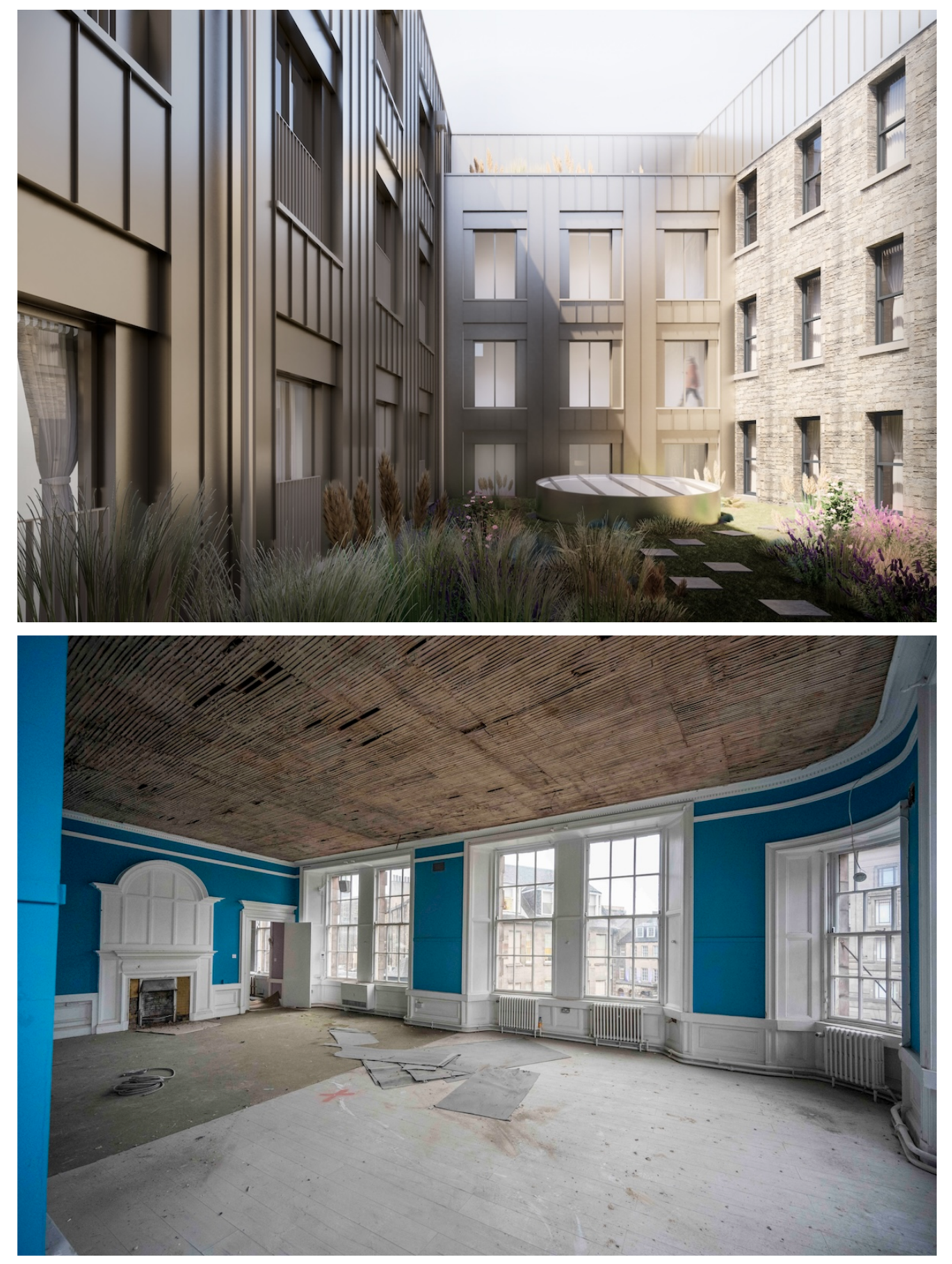
Images of the building in its current state parts of the building have been a hostel and also the Fantasy Loung bar.