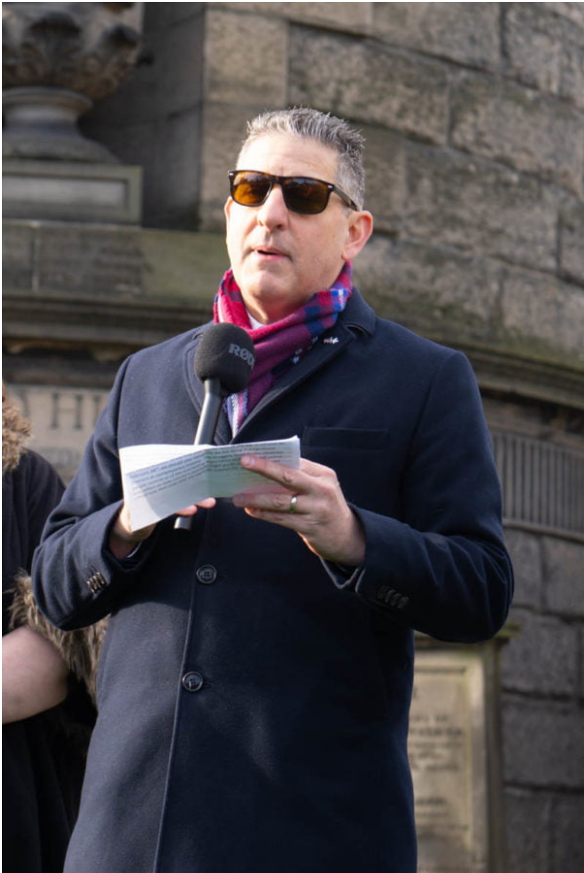
US Consul General Jack Hillmeyer took part in a ceremony to lay wreaths at the statue of Abraham Lincoln in Old Calton Cemetery and addressed the small gathering which included