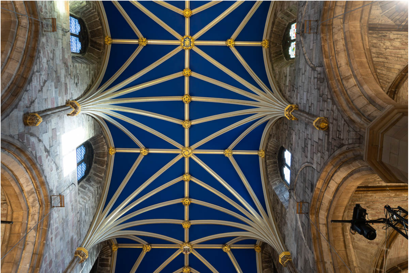
The ceiling in St Giles' Cathedral