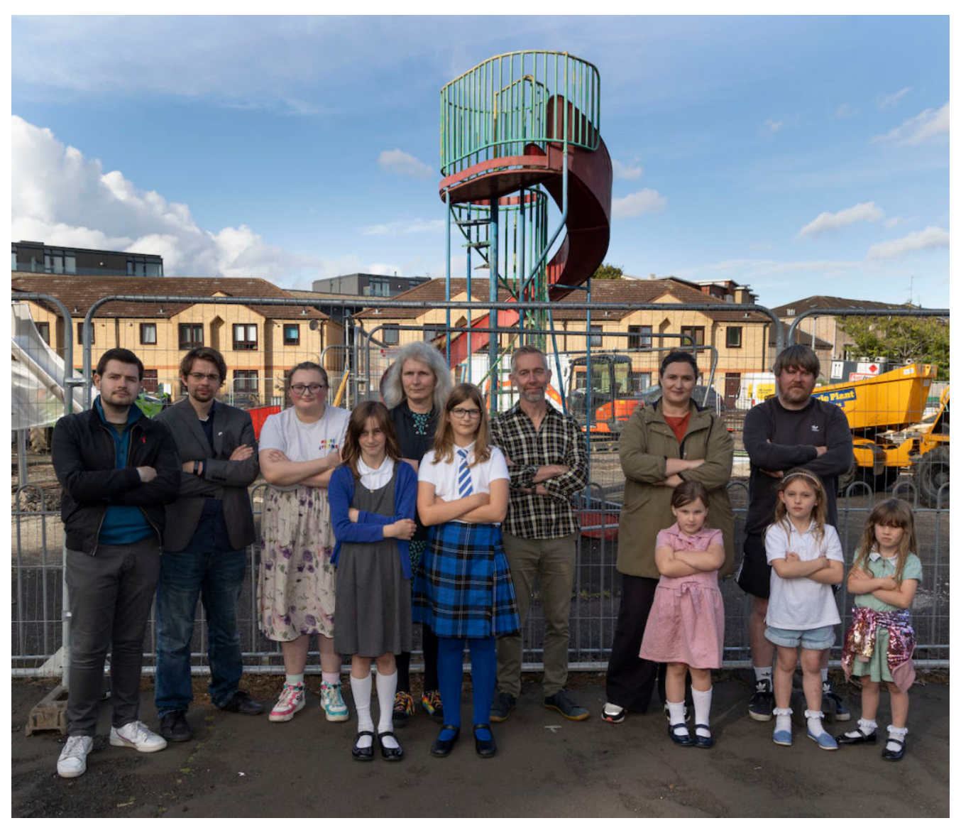
The Friends of Montgomery Street Park worked hard to try to save the historic helter skelter but were ultimately unsuccessful