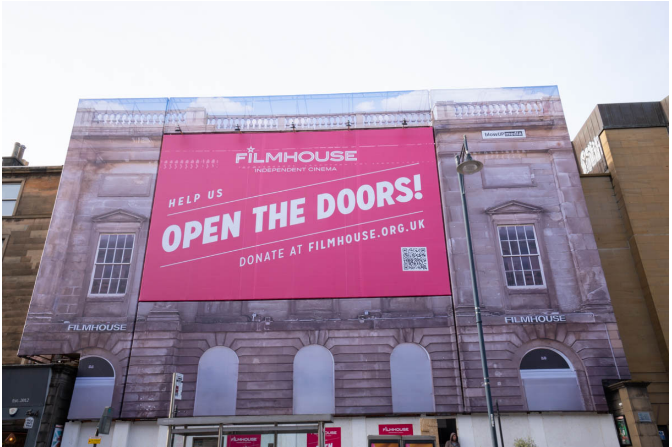
Filmhouse Edinburgh with Open the Doors banner outside

part of the overall funds we need and are seeking.”