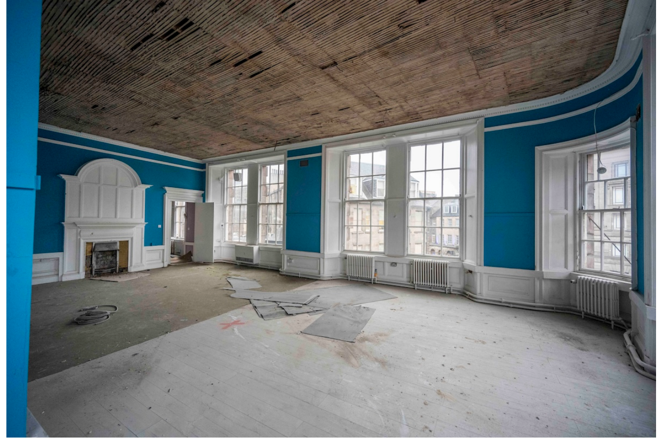
At St Mary's Episcopal Church on