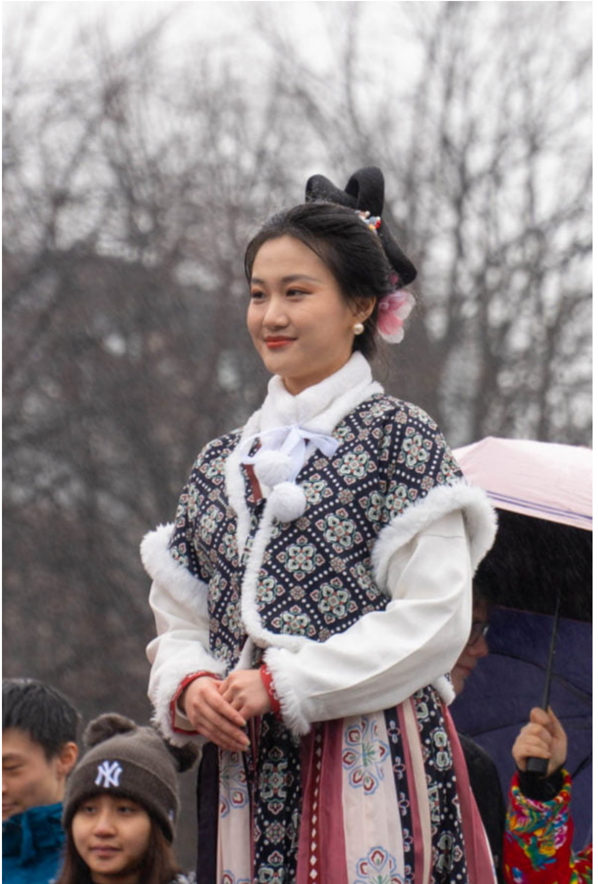
Celebrations for Chinese New Year 2024 at The Mound