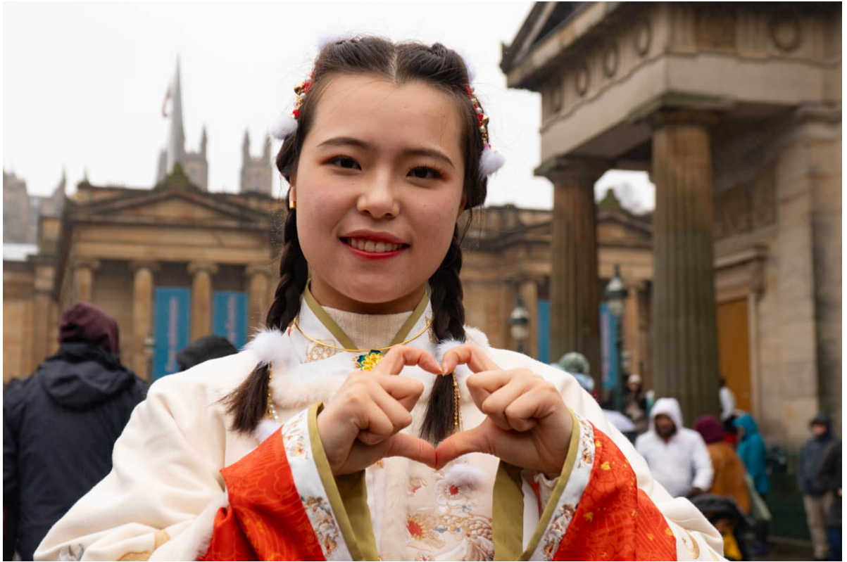
Celebrations for Chinese New Year 2024 at The Mound