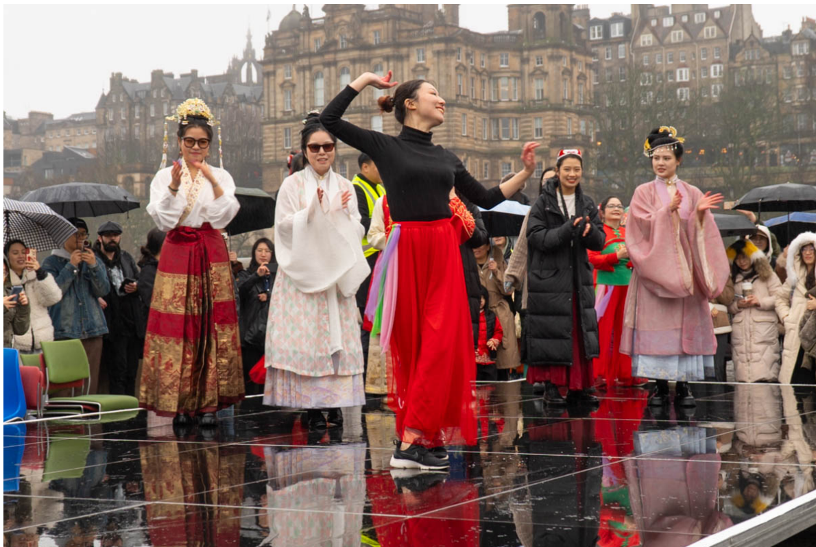
Celebrations for Chinese New Year 2024 at The Mound