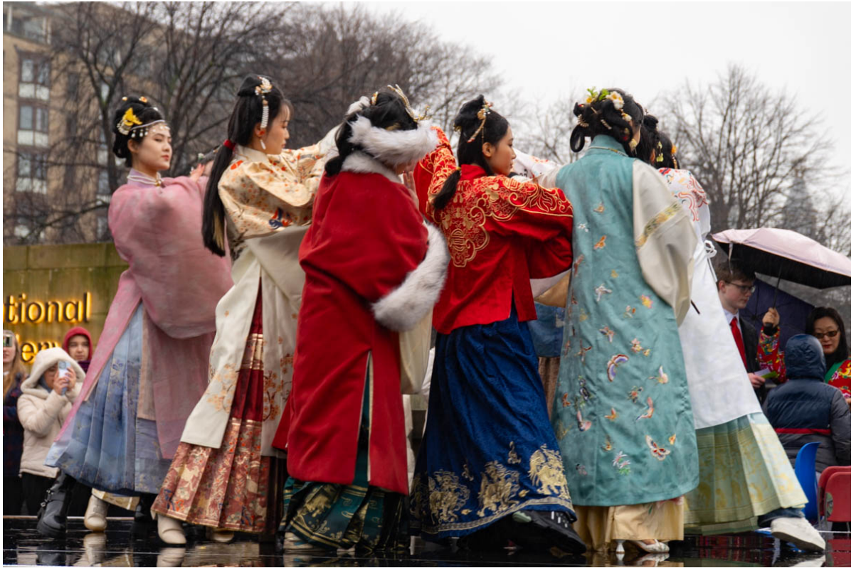
Celebrations for Chinese New Year 2024 at The Mound