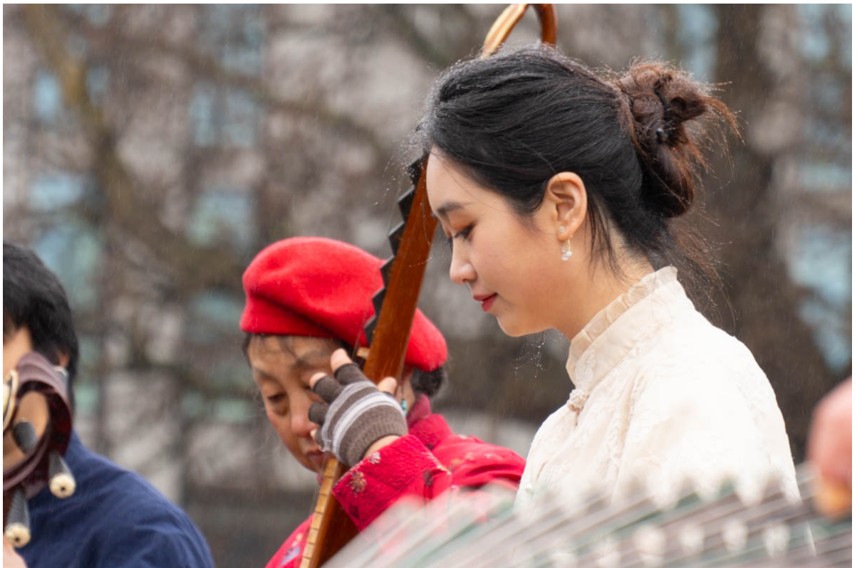
Celebrations for Chinese New Year 2024 at The Mound