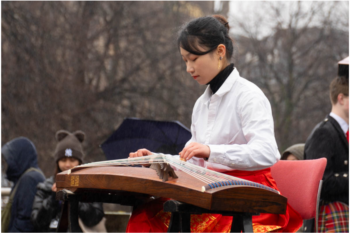
Celebrations for Chinese New Year 2024 at The Mound