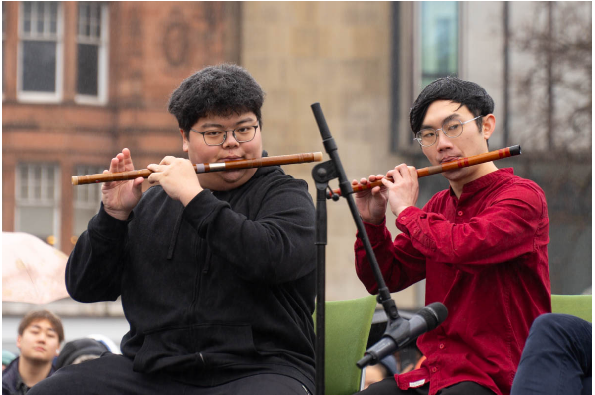
Celebrations for Chinese New Year 2024 at The Mound