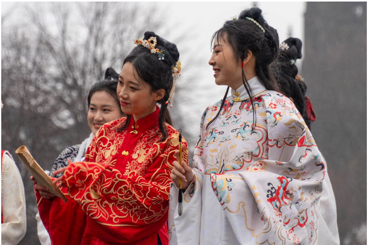
Celebrations for Chinese New Year 2024 at The Mound