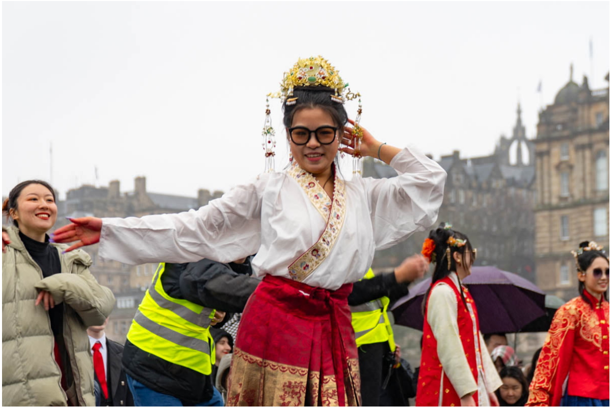
Celebrations for Chinese New Year 2024 at The Mound