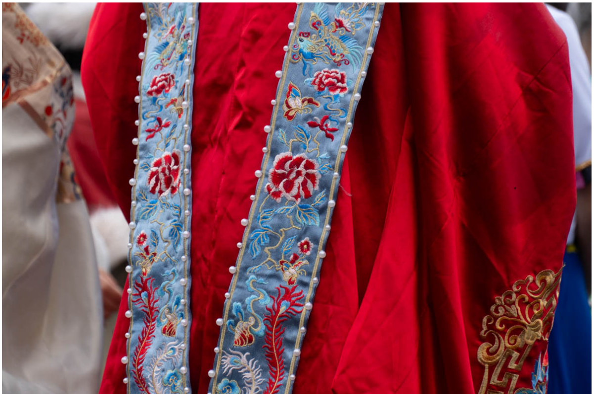
Celebrations for Chinese New Year 2024 at The Mound