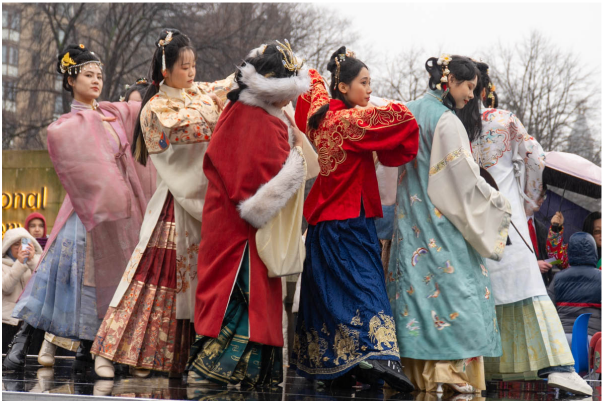
Celebrations for Chinese New Year 2024 at The Mound