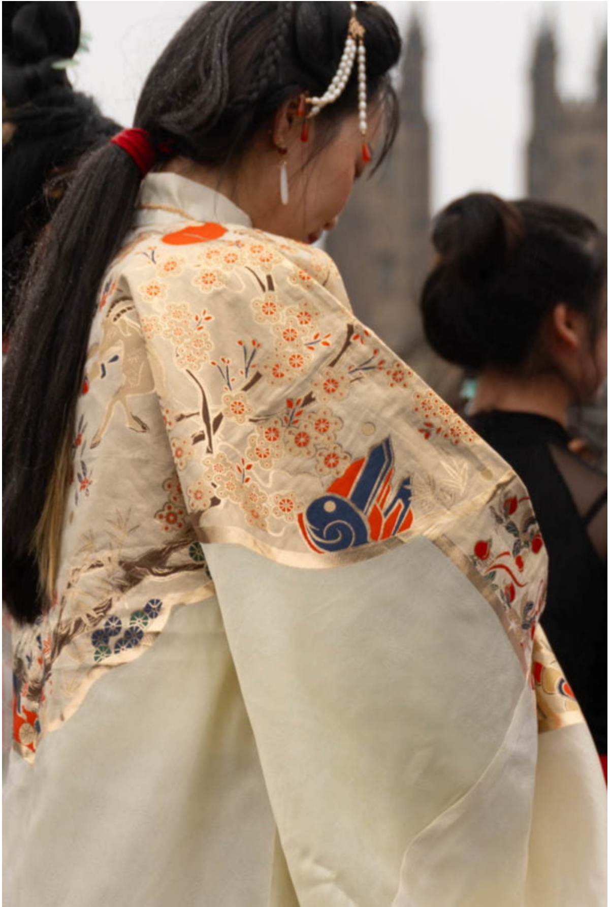
Celebrations for Chinese New Year 2024 at The Mound