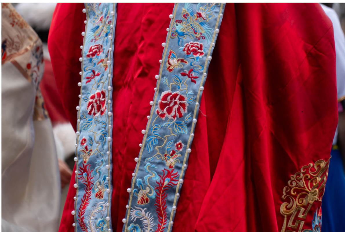
Celebrations for Chinese New Year 2024 at The Mound