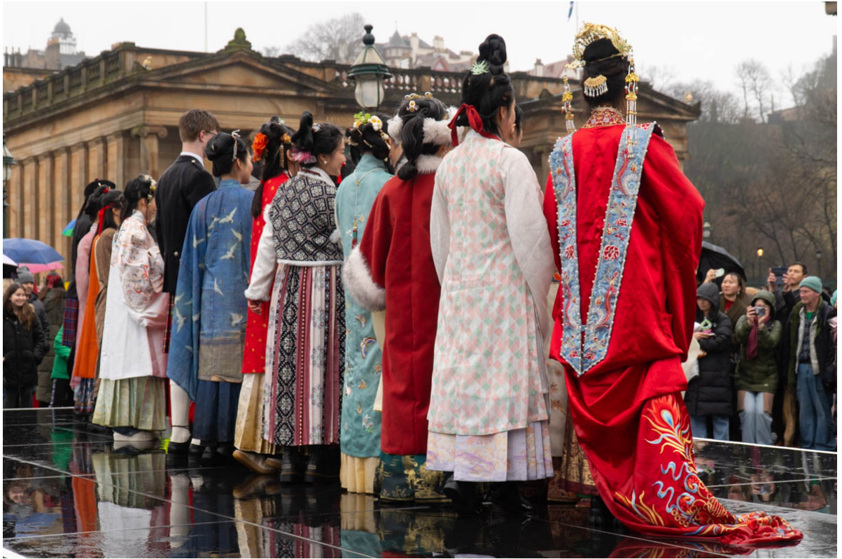
Celebrations for Chinese New Year 2024 at The Mound