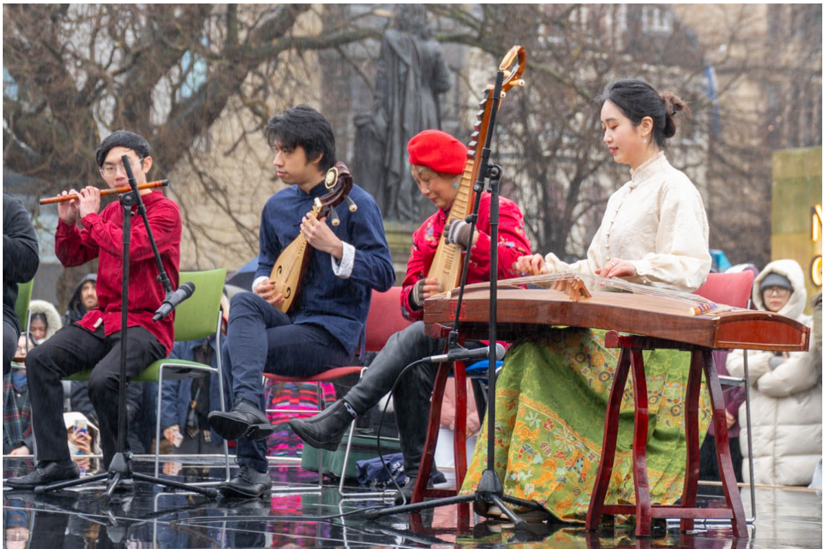
Celebrations for Chinese New Year 2024 at The Mound