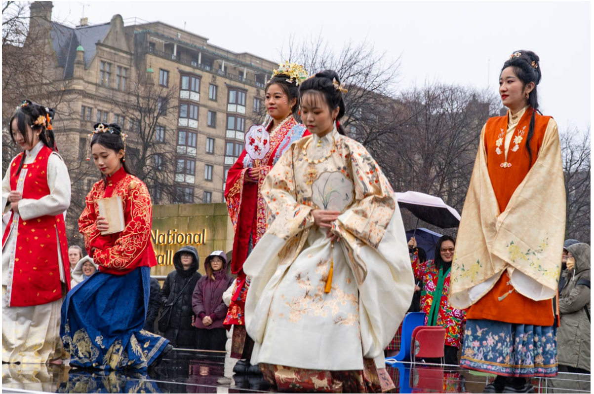
Celebrations for Chinese New Year 2024 at The Mound