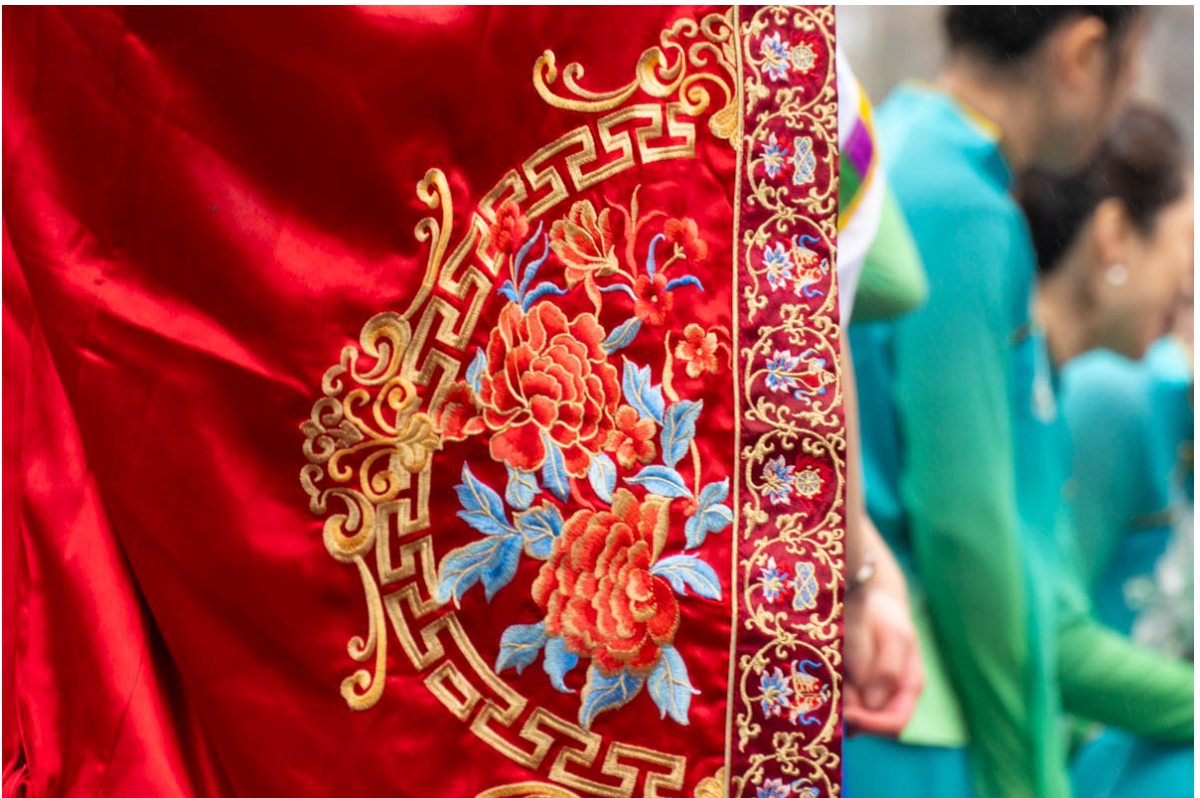
Celebrations for Chinese New Year 2024 at The Mound