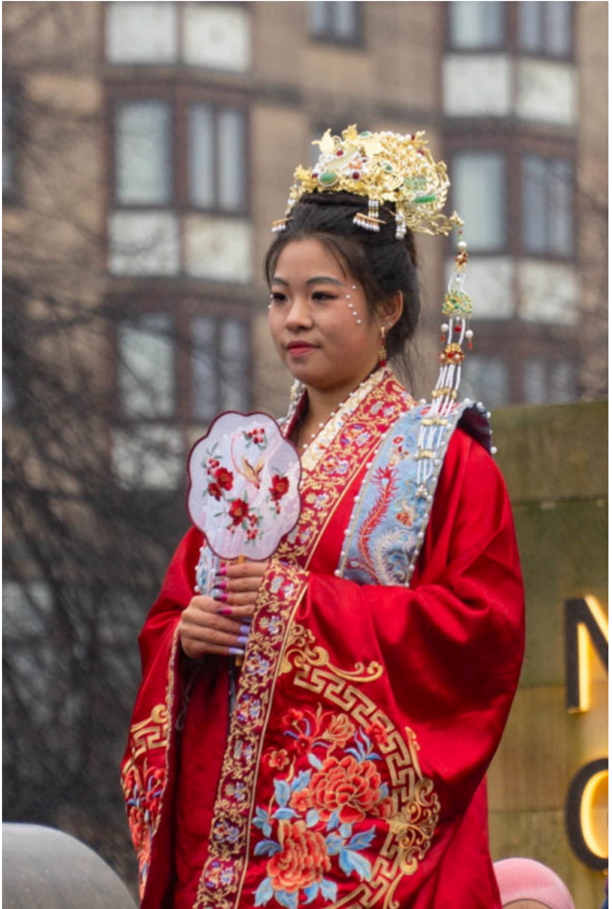
Celebrations for Chinese New Year 2024 at The Mound