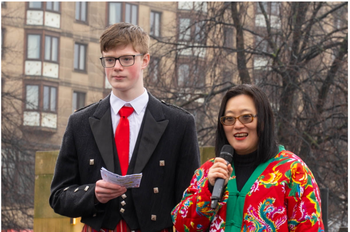
Celebrations for Chinese New Year 2024 at The Mound