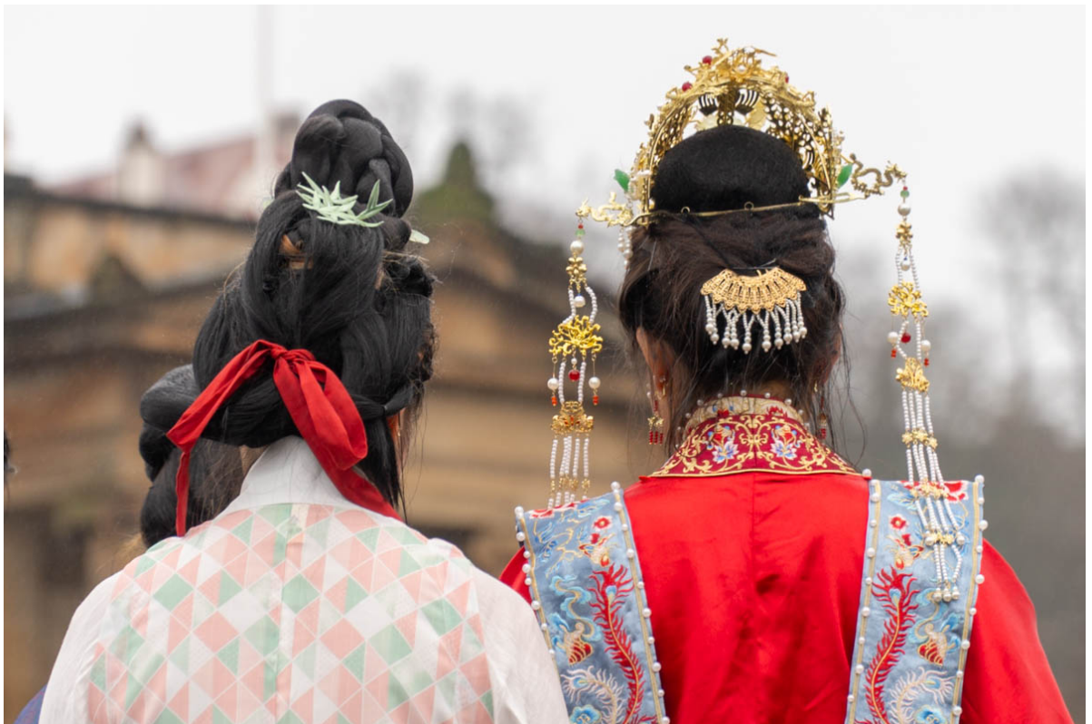
Celebrations for Chinese New Year 2024 at The Mound