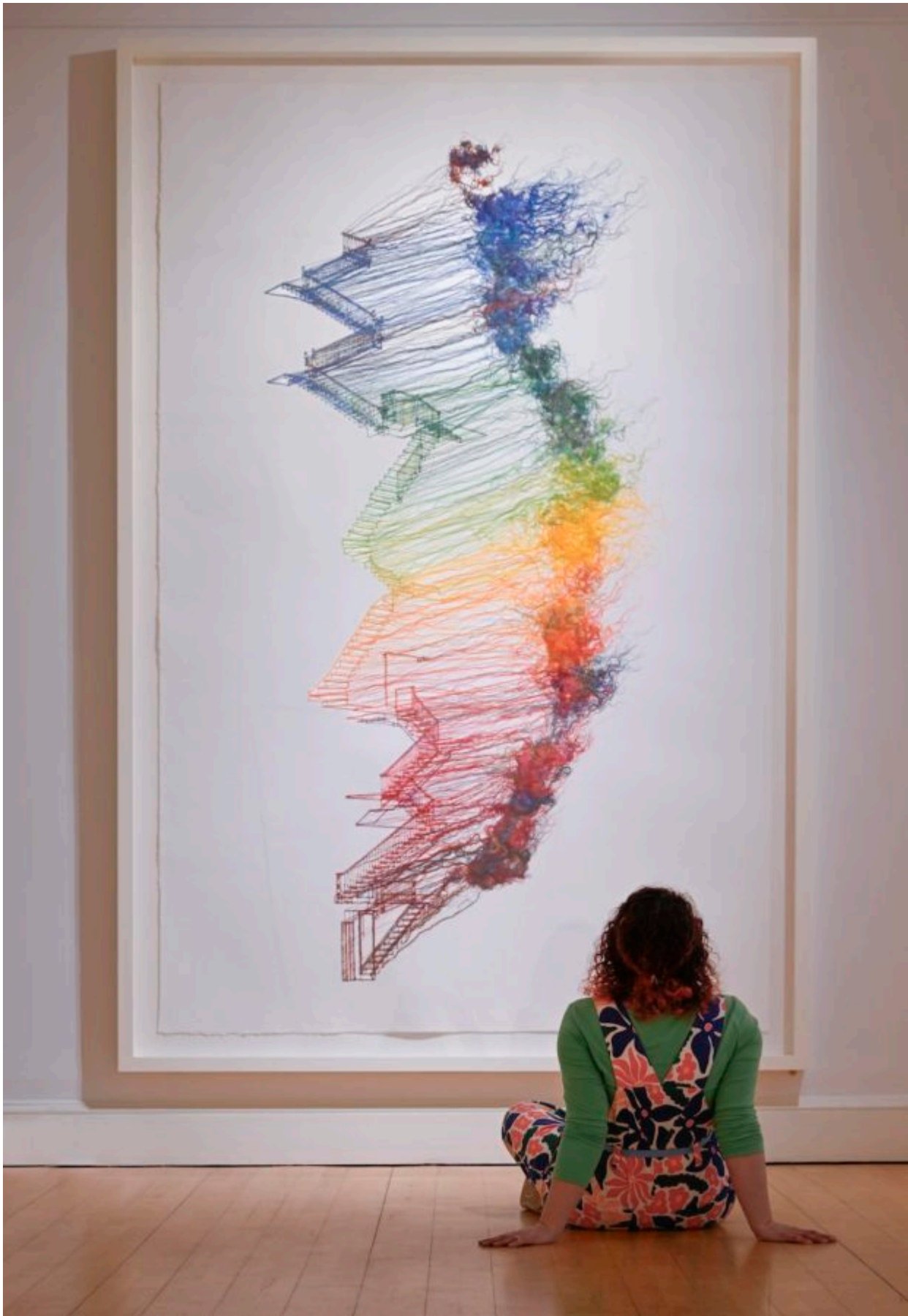
Do Ho Suh | Tracing Time | National Galleries of Scotland Taking over the ground floor of Modern One in Edinburgh, Tracing Time is the South Korean-born, London-based artist's