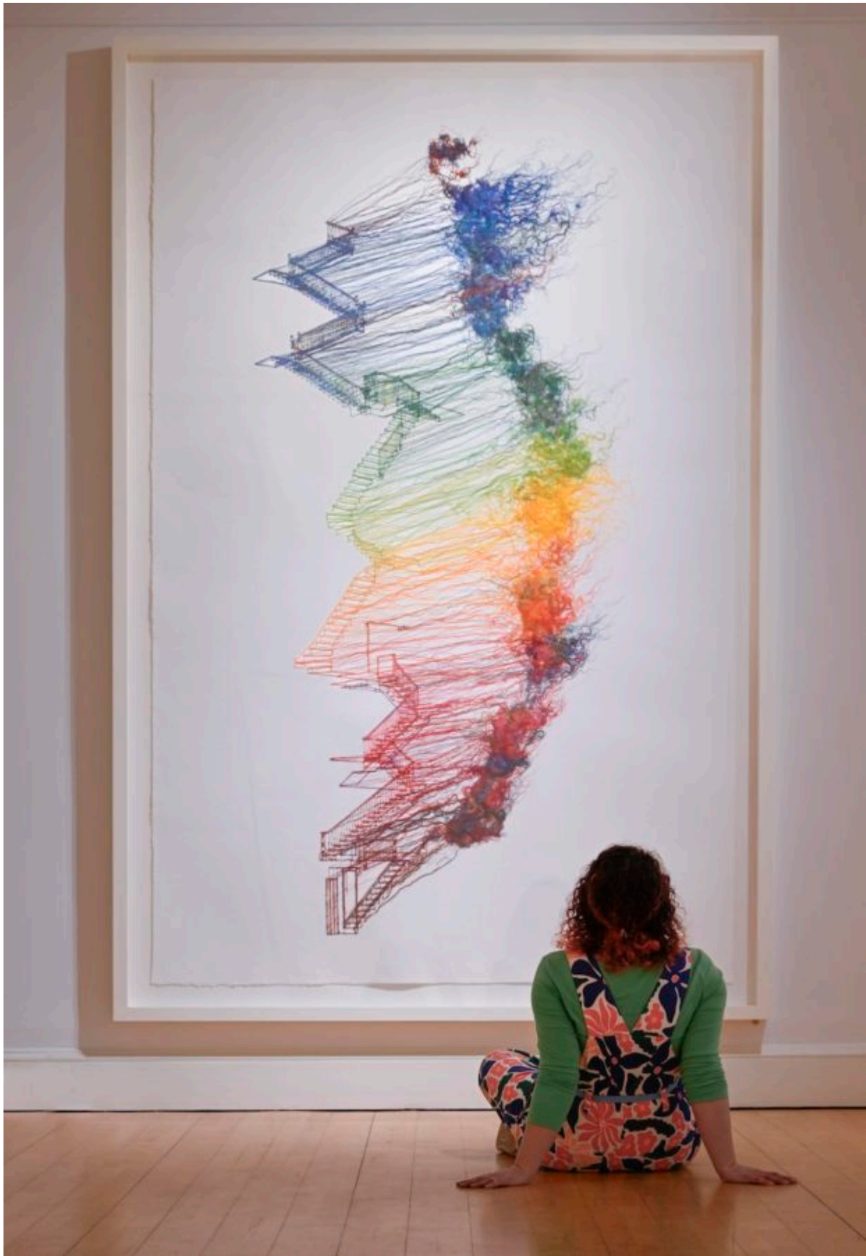
Do Ho Suh | Tracing Time | National Galleries of Scotland Taking over the ground floor of Modern One in Edinburgh, Tracing Time is the South Korean-born, London-based artist's