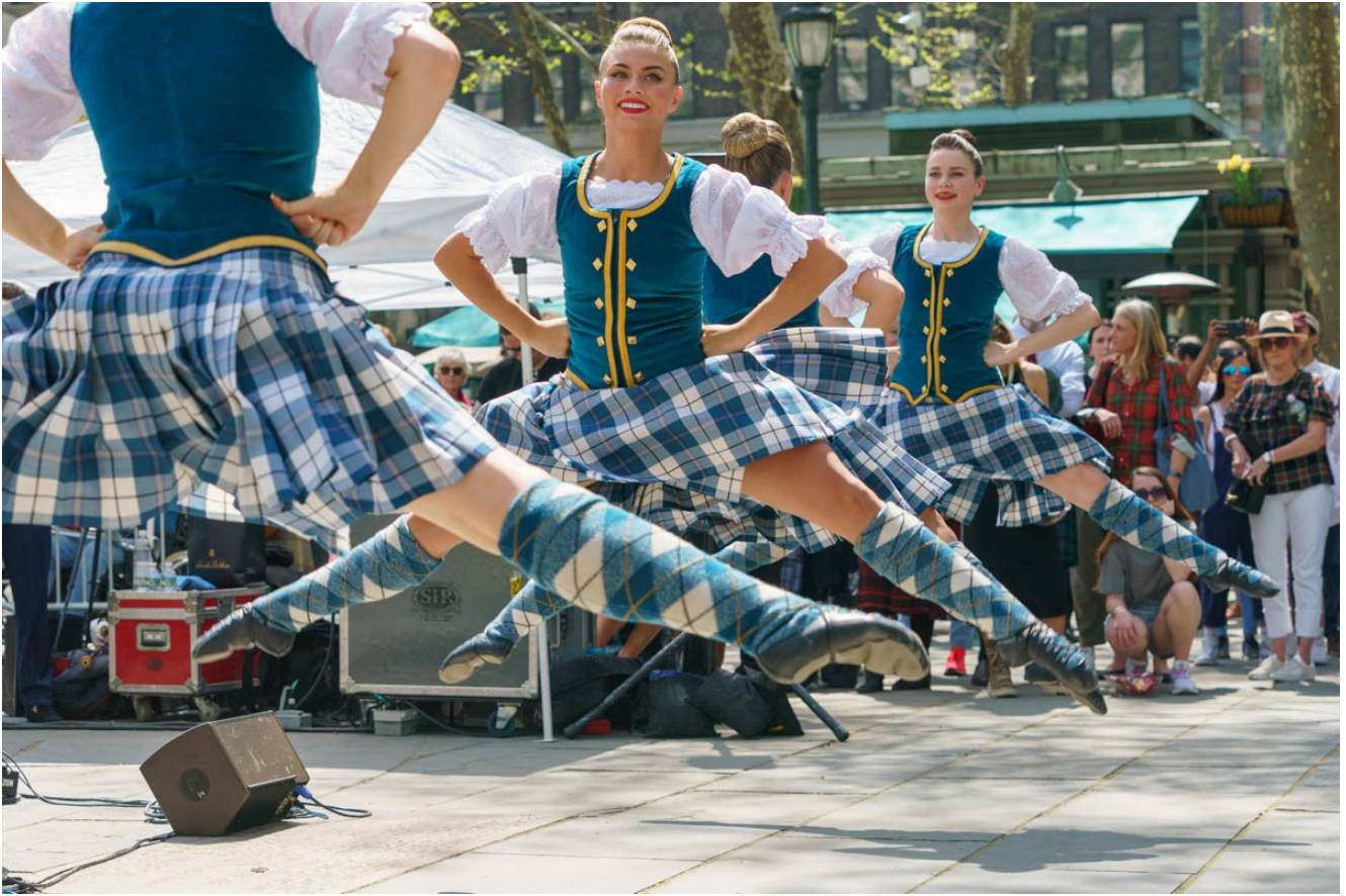
The Royal Edinburgh Military Tattoo Dancers in Bryant Park before the parade 2023