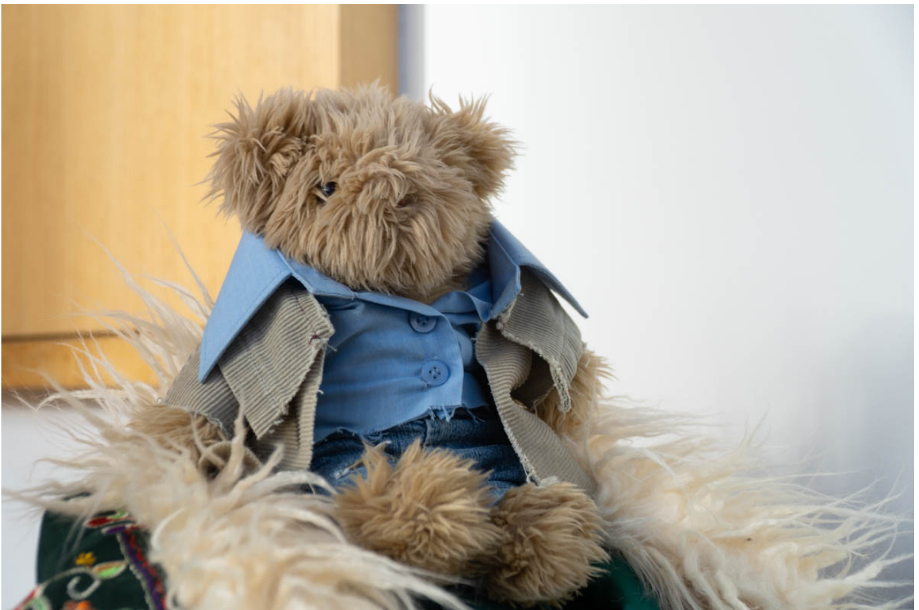
Colin Bear whose story is told in the film The first showing