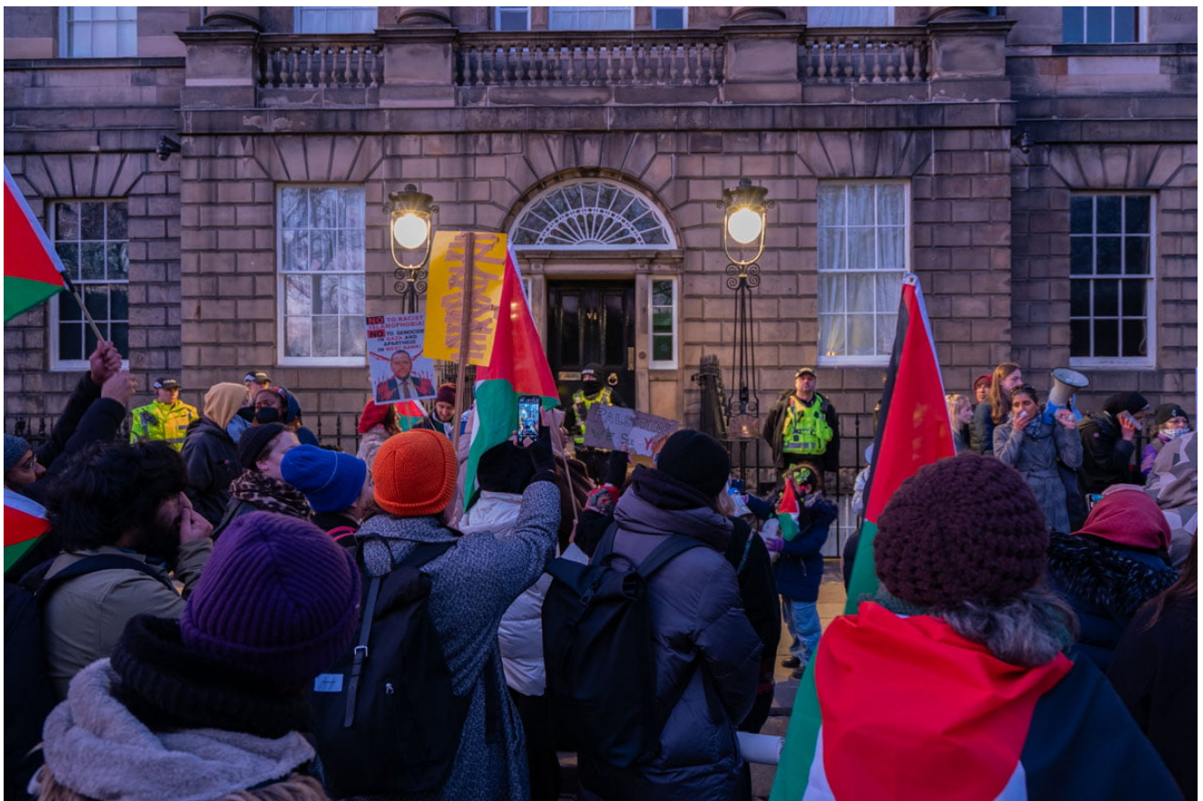
Outside Bute House 13 January 2024