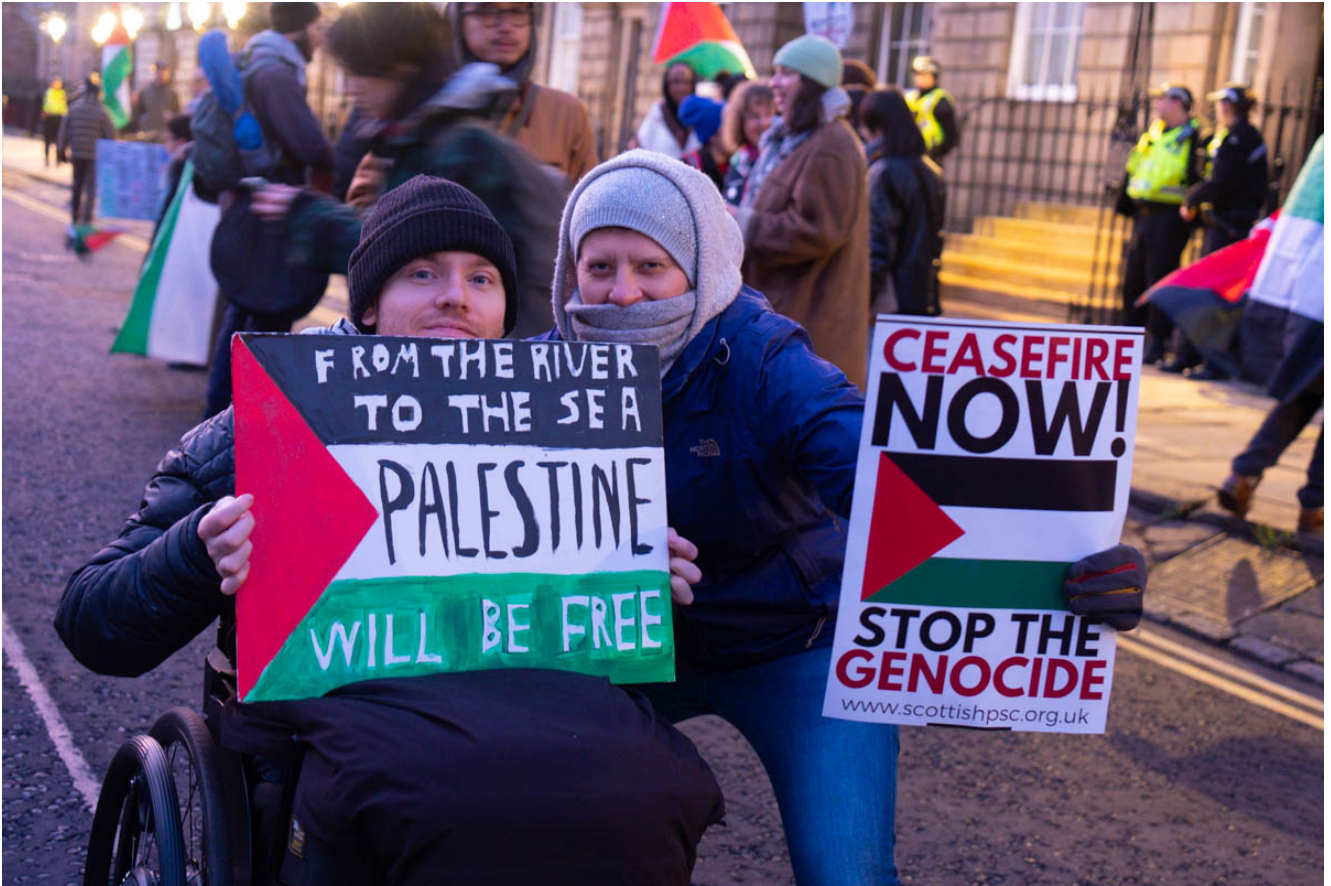
Pro Palesitne protest 13 January 2024