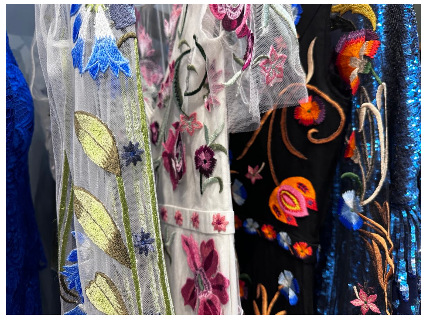
Dresses by Temperley and other brands are on display

Clients who wish to explore the new range of dresses can book a private appointment with Rachel at the boutique from Thursday 1 February. In addition anyone can drop in and browse the full collection without an appointment during the open weekend on Saturday 3 – Sunday 4 February.