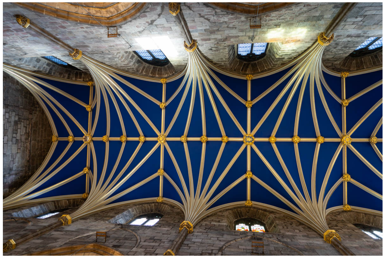
And while you take a look at HEART in St Giles' Cathedral don't forget to look up