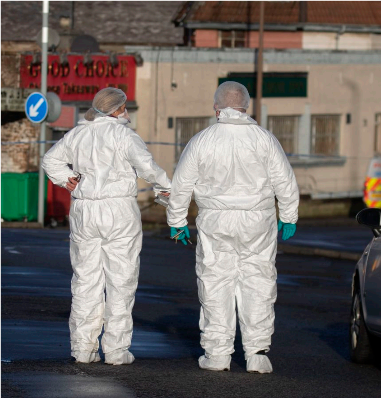
Outside the Anchor Inn Granton