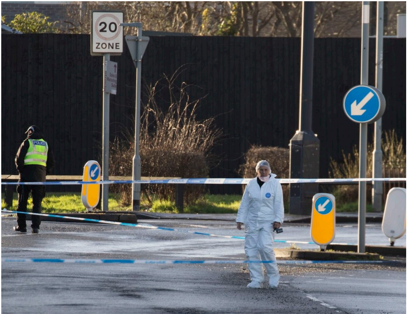
Outside the Anchor Inn Granton