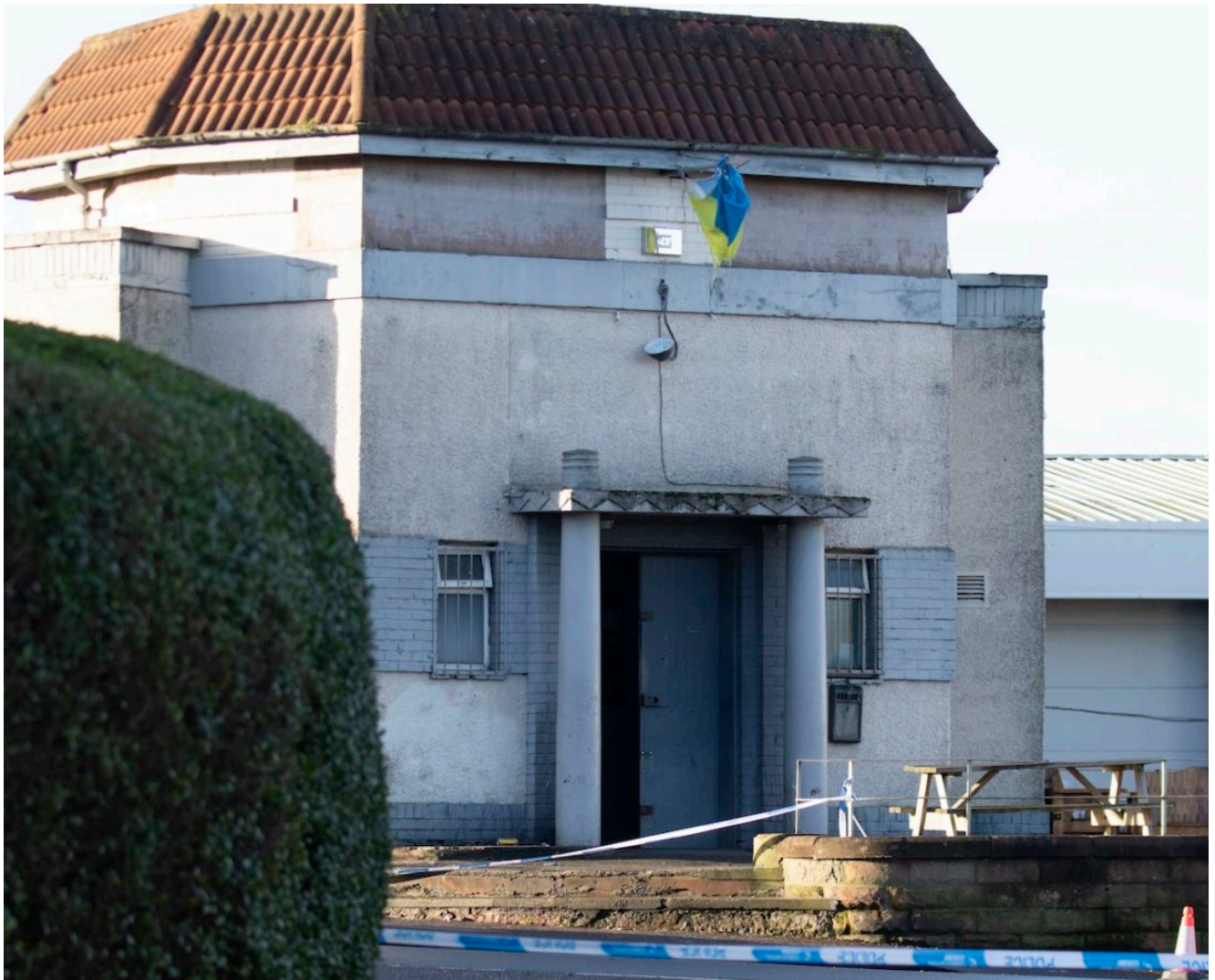
Outside the Anchor Inn Granton