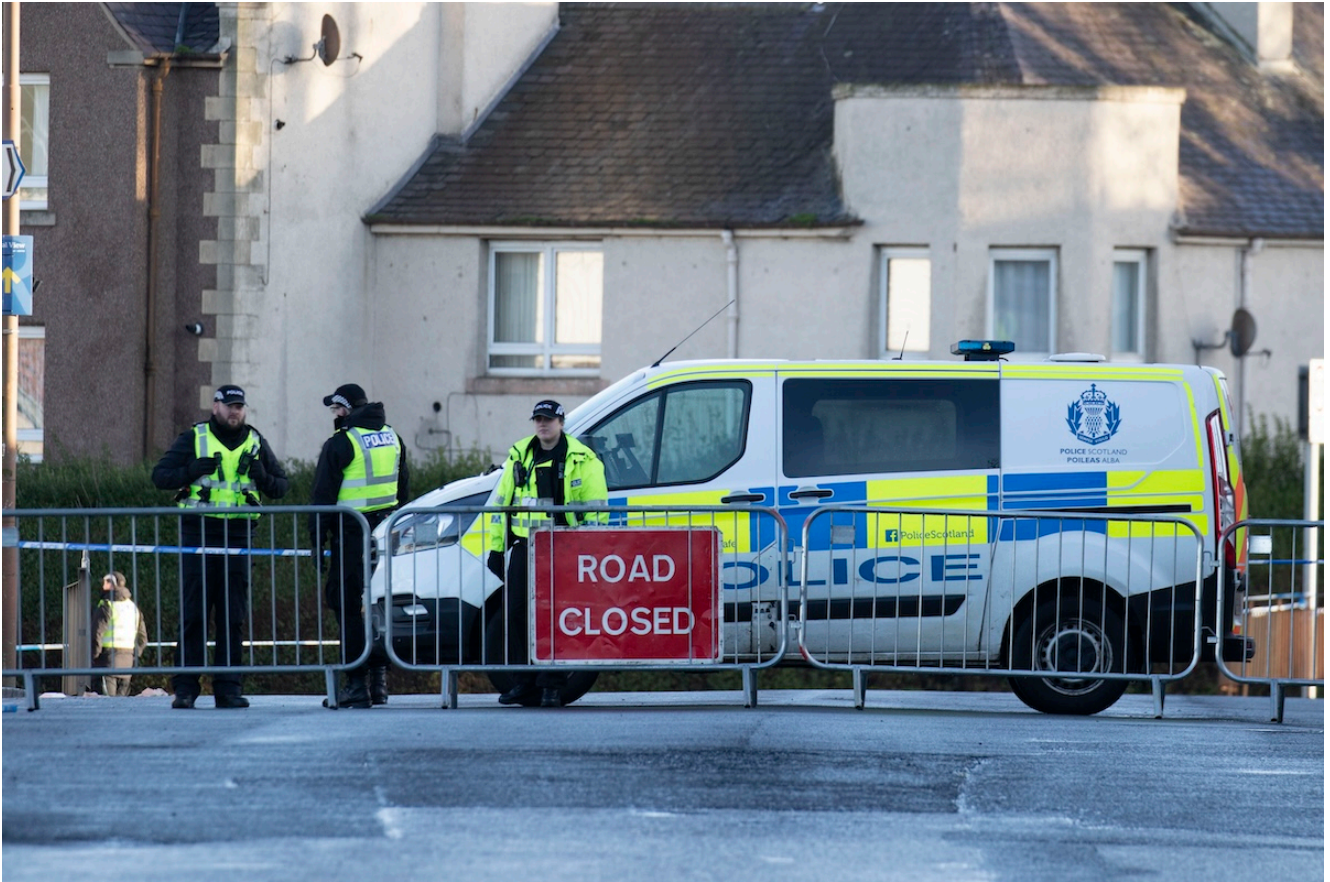
Outside the Anchor Inn Granton