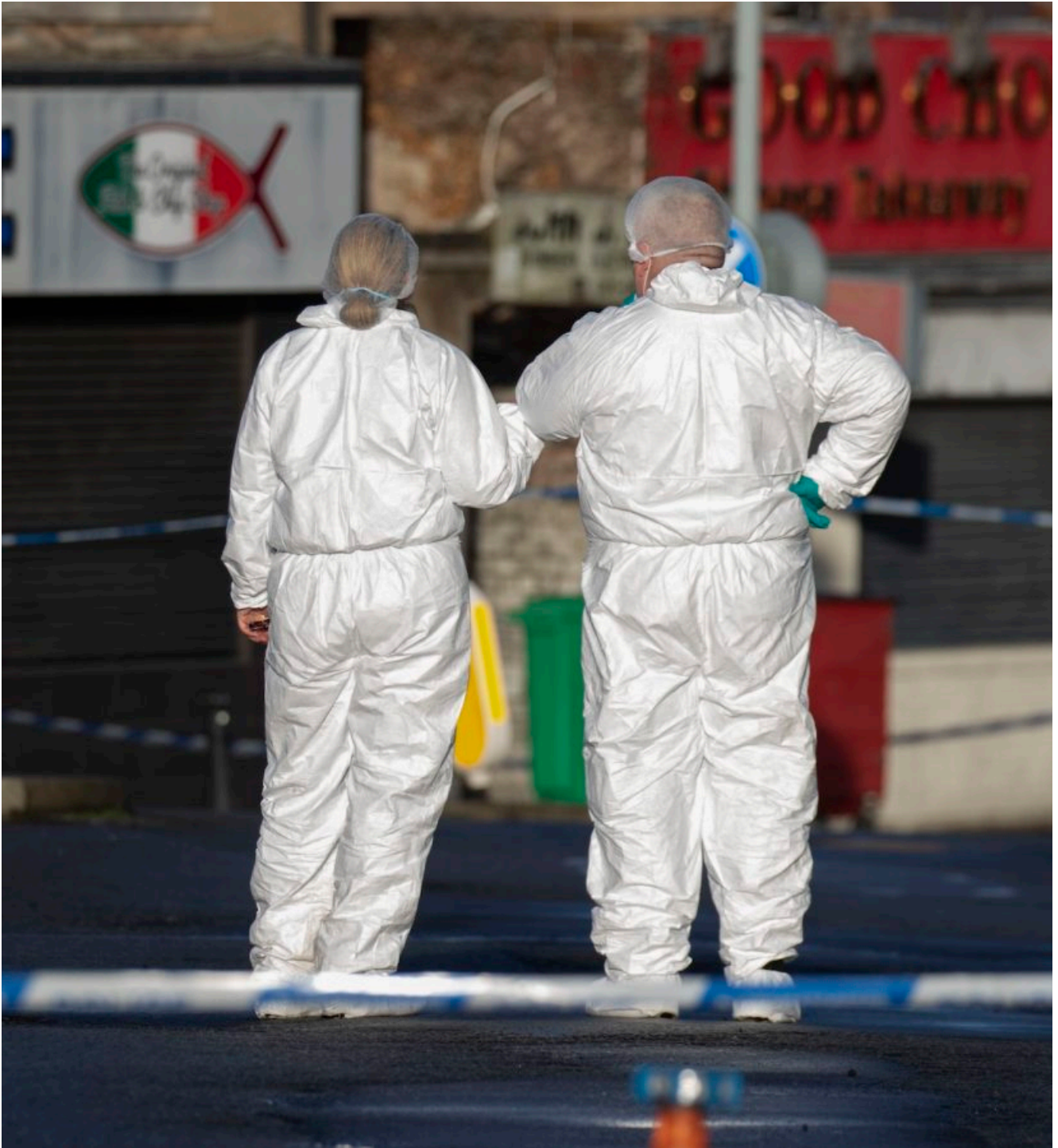
Outside the Anchor Inn Granton