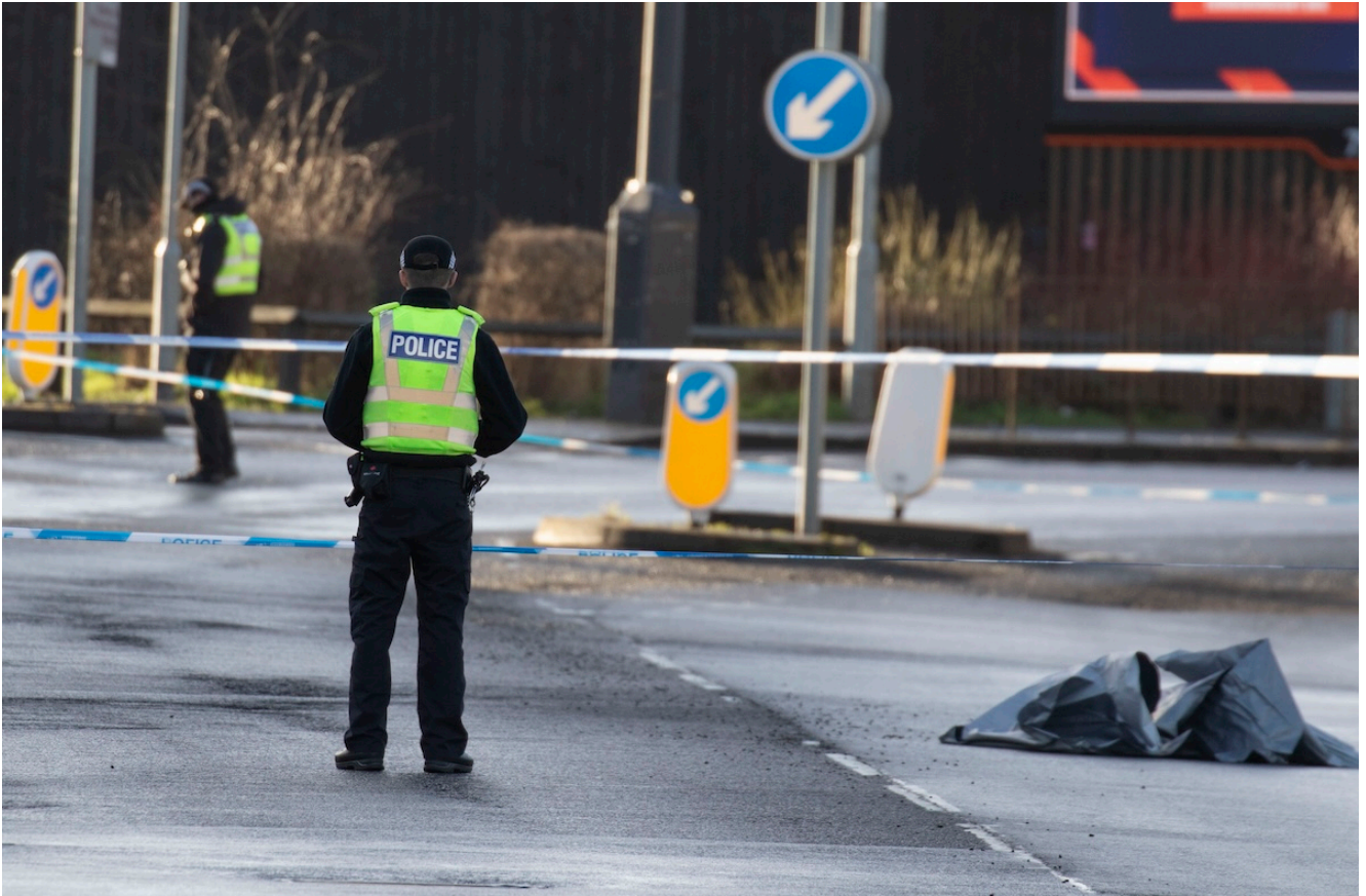
Outside the Anchor Inn Granton