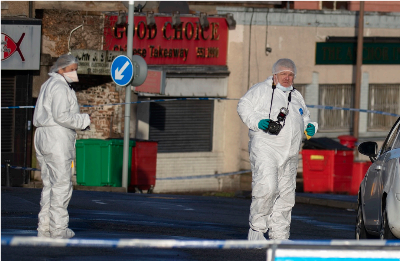
Outside the Anchor Inn Granton