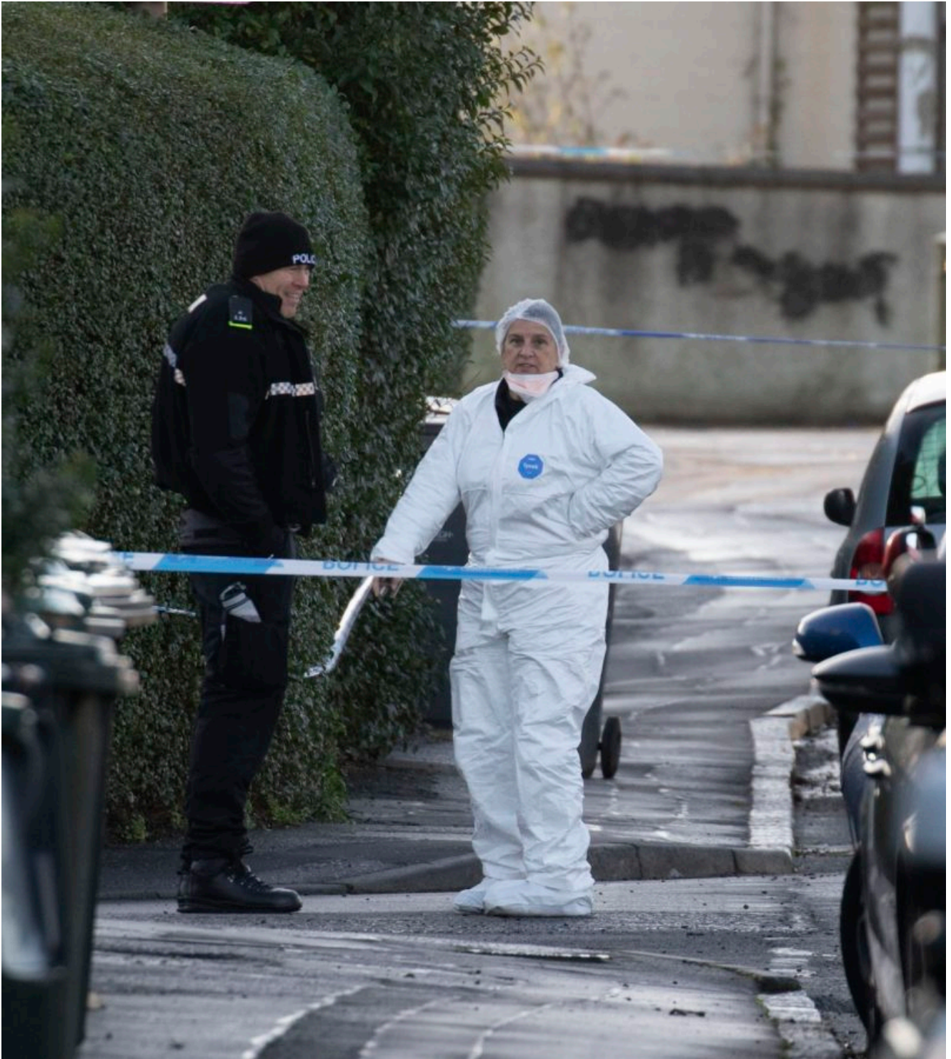
Outside the Anchor Inn Granton