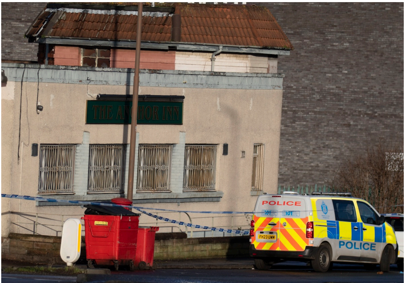
Outside the Anchor Inn Granton

Anyone with information is urged to call 101 quoting reference 3819 of 31 December. Alternatively, Crimestoppers can be contacted anonymously on 0800 555 111.