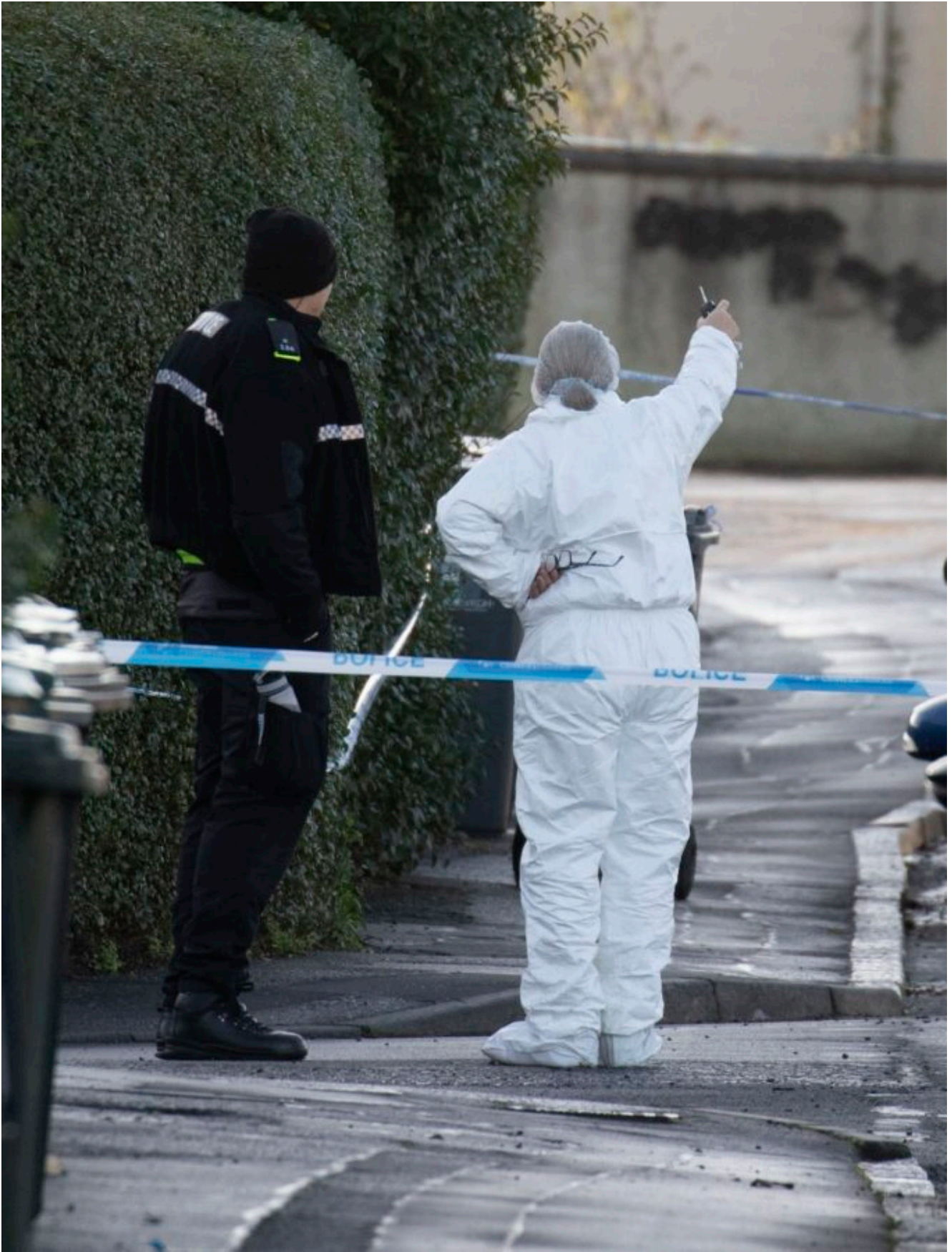
Outside the Anchor Inn Granton