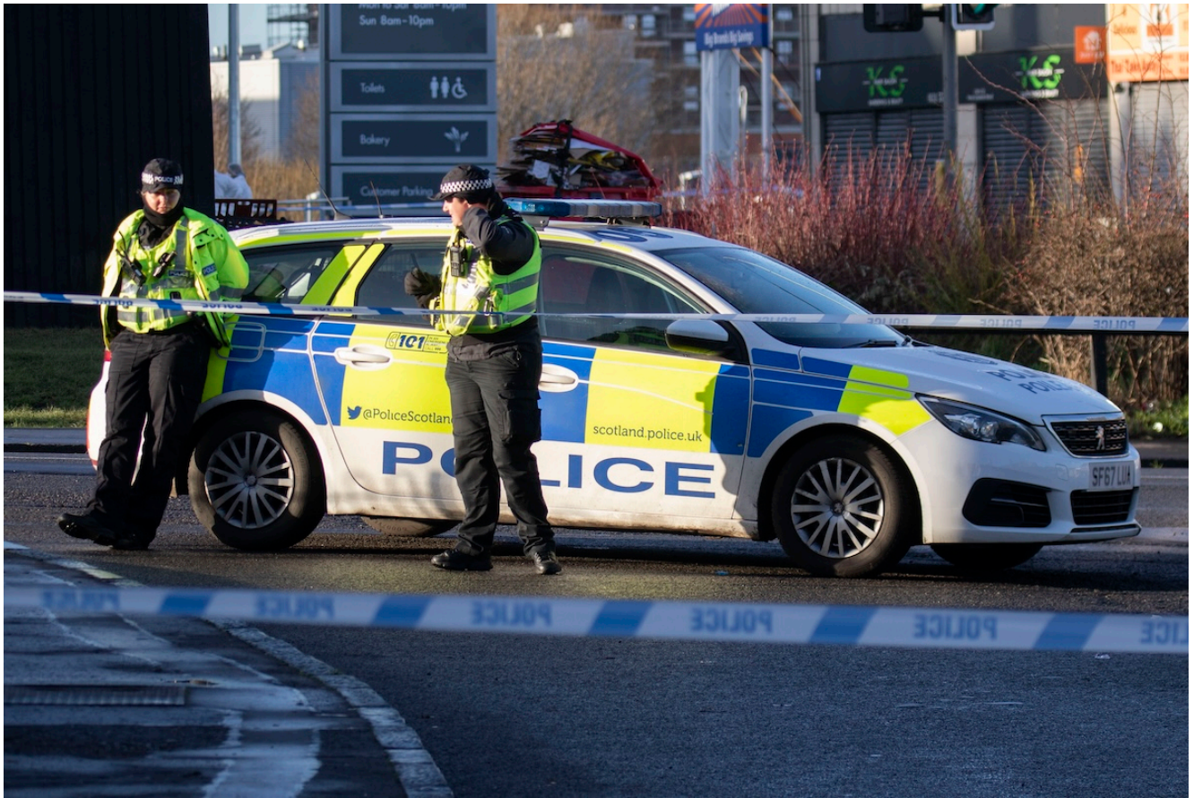
Outside the Anchor Inn Granton