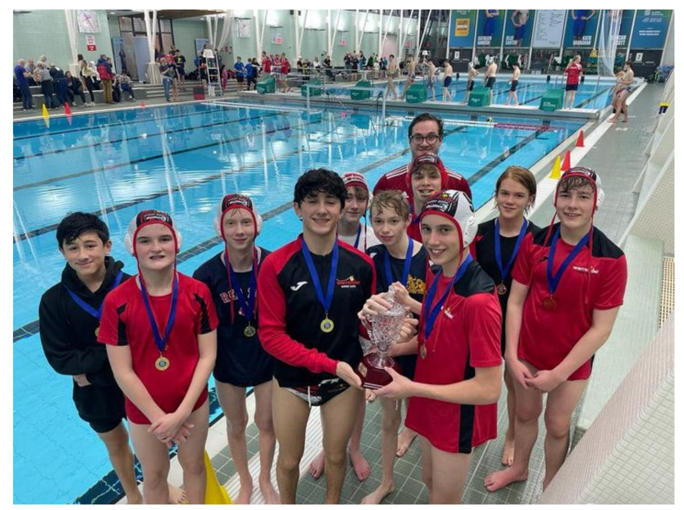
The winning Warrender Gold team celebrate success in the Scottish under-15 water polo championship.