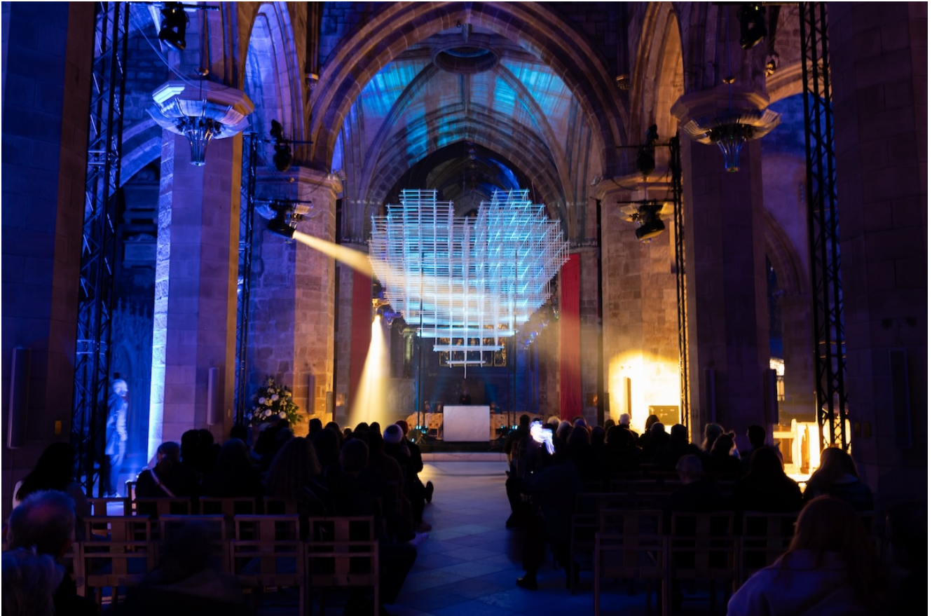
HEART in St Giles' Cathedral