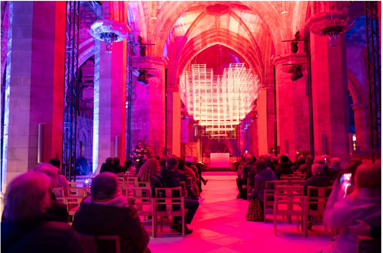
HEART in St Giles' Cathedral

The lights change colour and there is music while the heart does what it should – it beats.