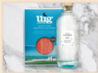
SMOKED SALMON & HARRIS GIN