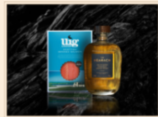
SMOKED SALMON & THE HEARACH