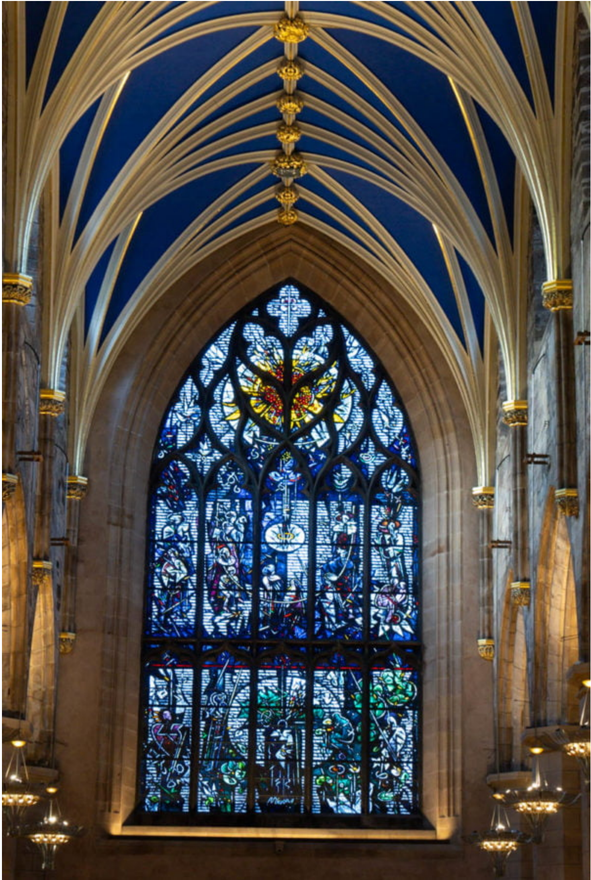
The stained glass window installed in St Giles' Cathedral to commemorate Robert Burns