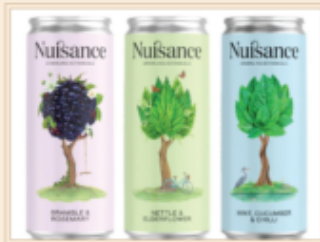
BOTANICAL SOFT DRINKS