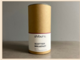
SCOTTISH BREAKFAST TEA