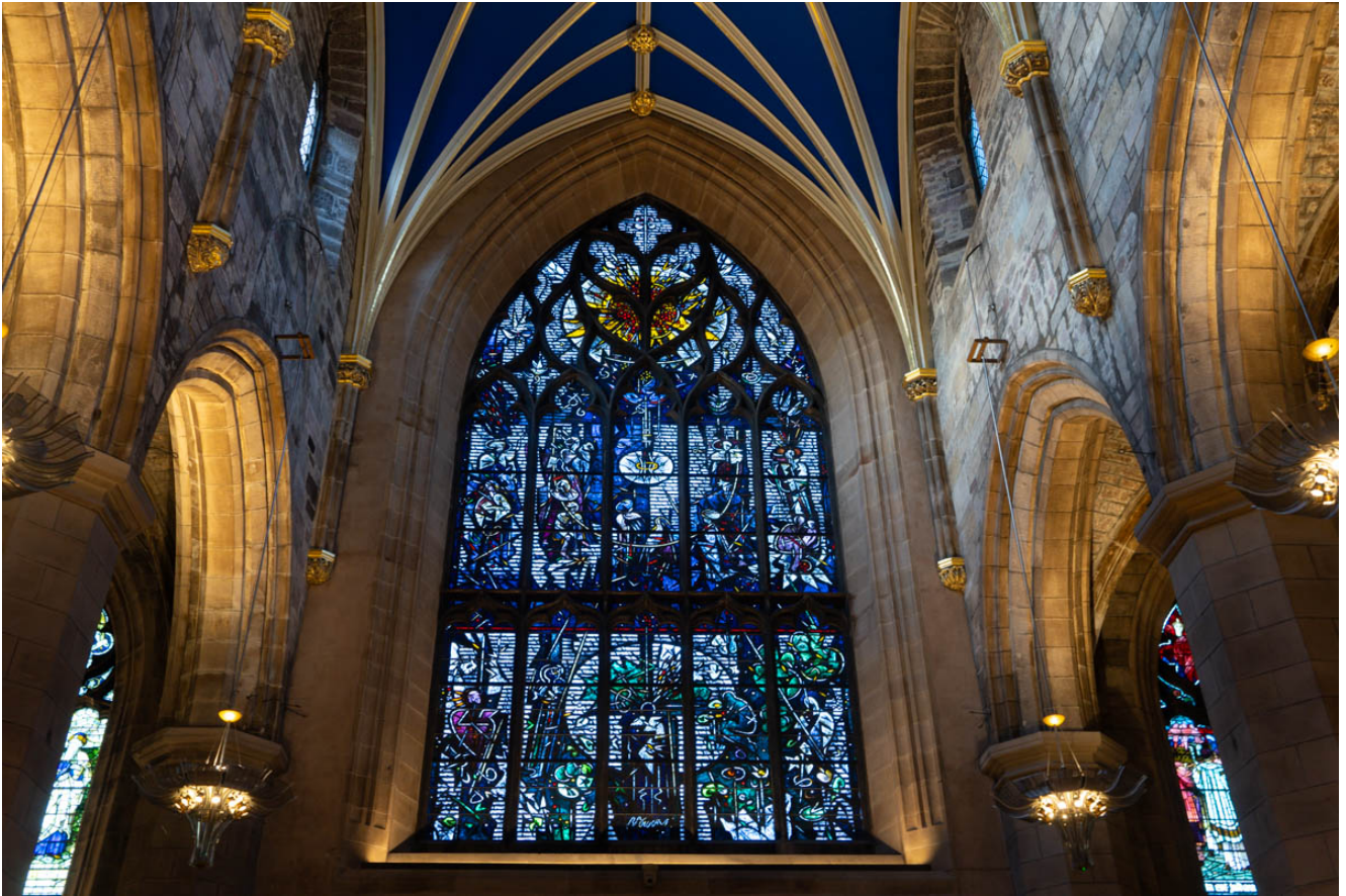
The Robert Burns window at the western entrance to St Giles' Cathedral