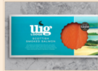
HOT SMOKED SALMON