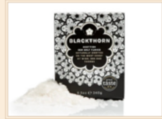
BLACKTHORN SEA SALT FLAKES