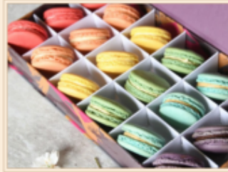
RAINBOW MACARON GIFT BOX