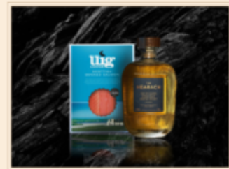
SMOKED SALMON & THE HEARACH