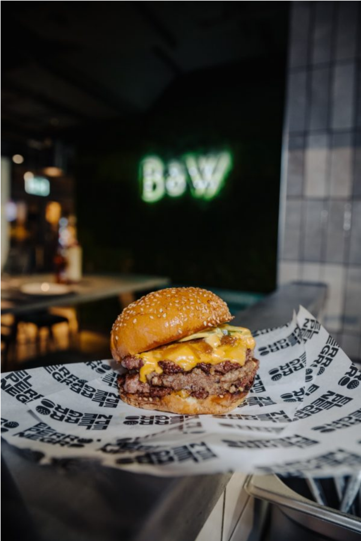
Bonnie & Wild are putting on a ceilidh and food from their many outlets – including a haggis burger..from El Perro Negro