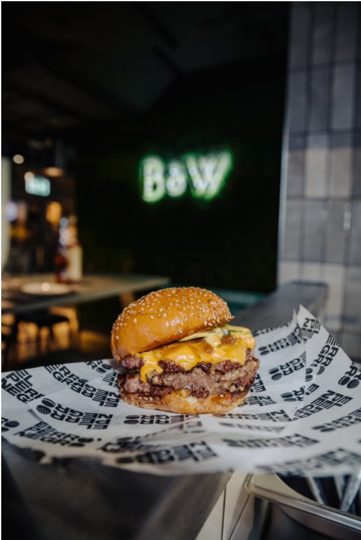
Bonnie & Wild are putting on a ceilidh and food from their many outlets – including a haggis burger..from El Perro Negro