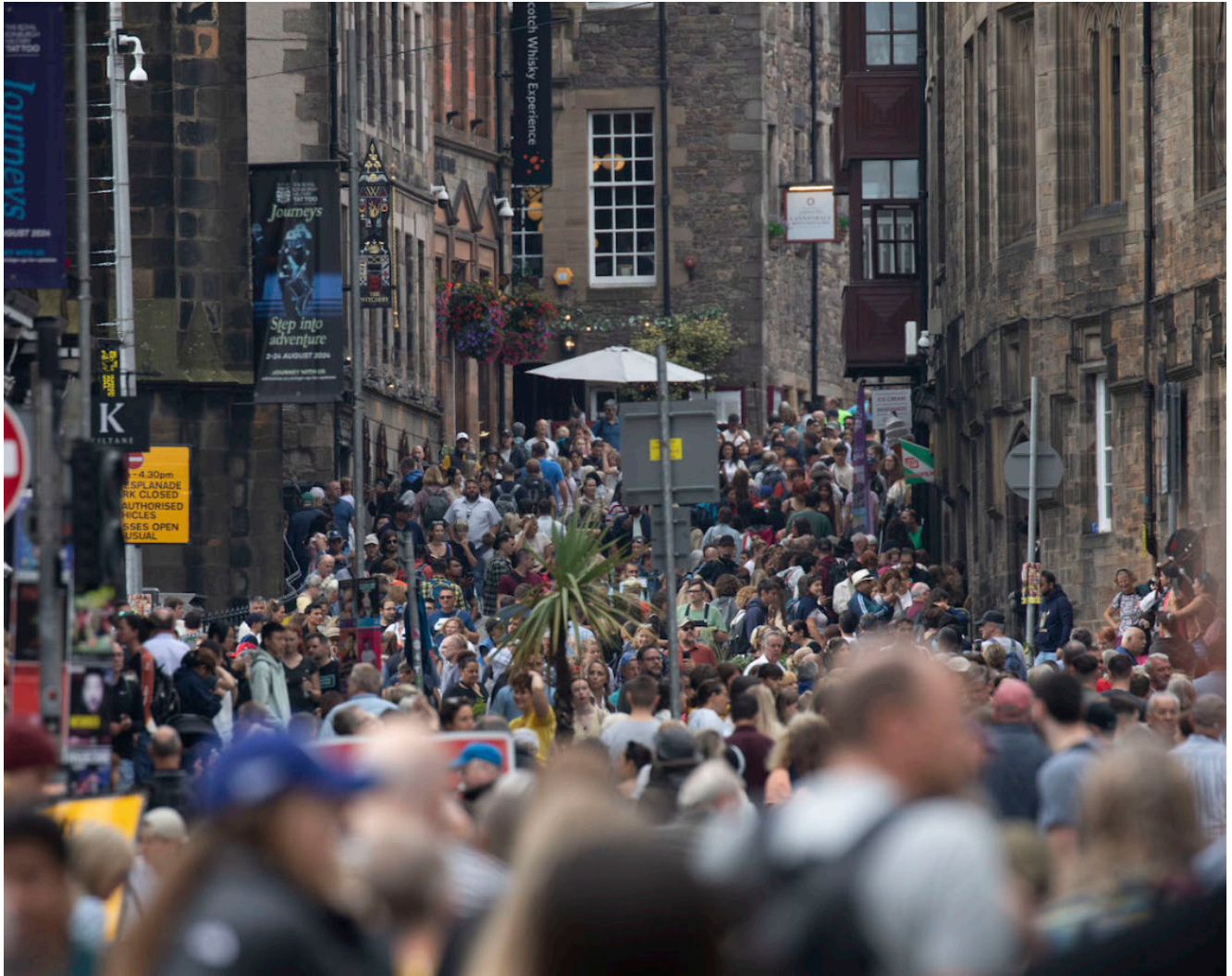
10/08/2023 Lots of Tourists on the Royal Mile.