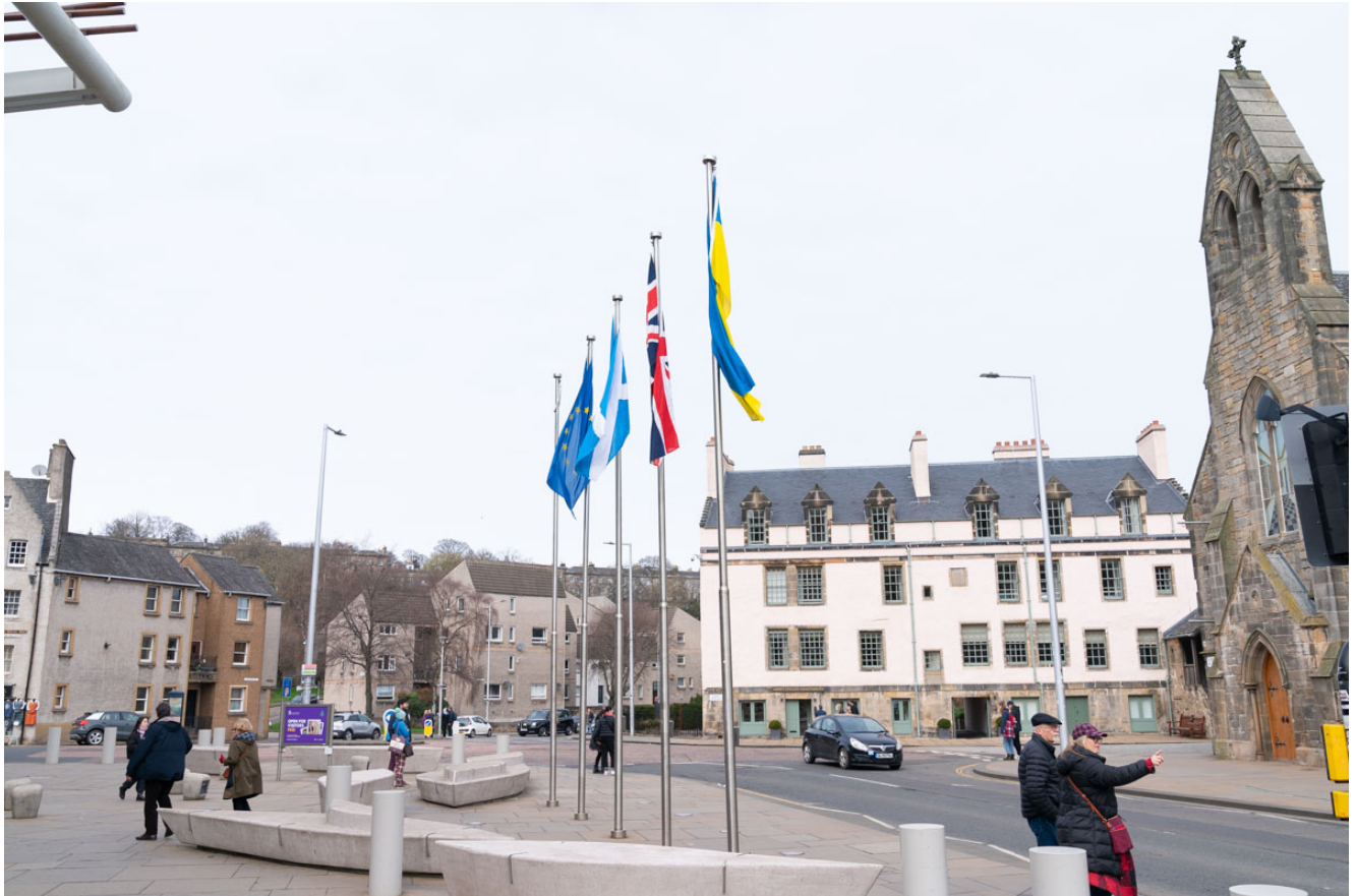
The Scottish Parliament.

“Our committee will therefore investigate whether a more coherent and strategic approach is needed for the creation of such commissioners in Scotland.”