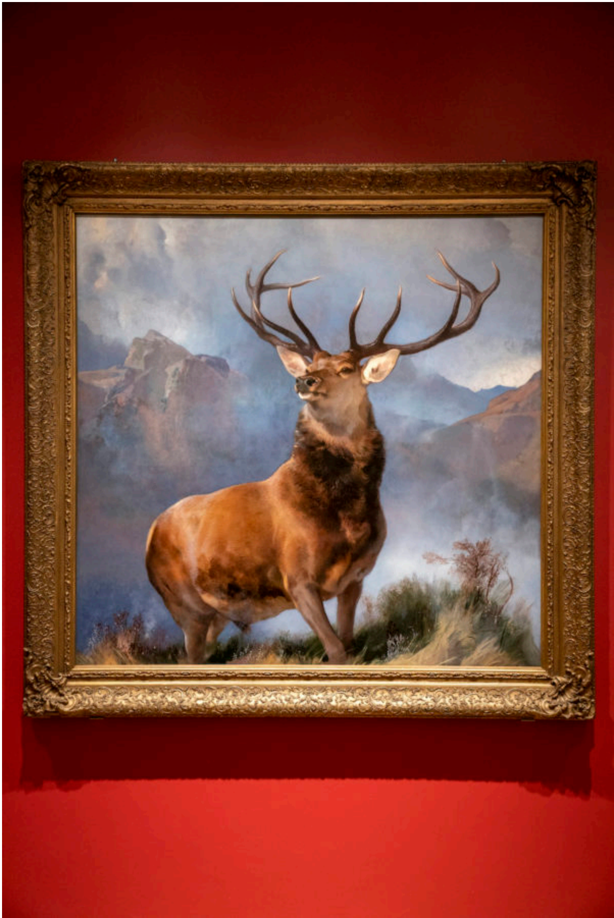
Sir Edwin Landseer, Monarch of the Glen. Oil on canvas. Purchased by the National Galleries of Scotland as a part gift from Diageo Scotland Ltd, with contributions from