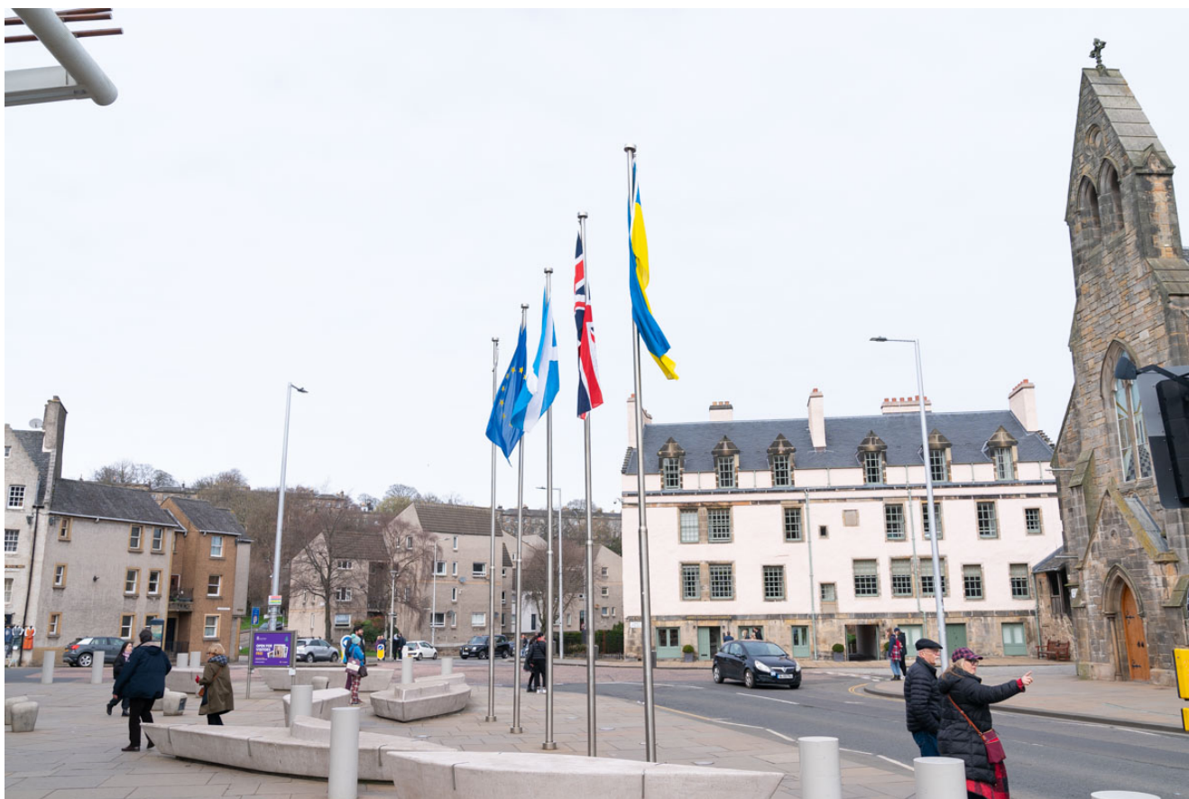
The Scottish Parliament.

“Our committee will therefore investigate whether a more coherent and strategic approach is needed for the creation of such commissioners in Scotland.”