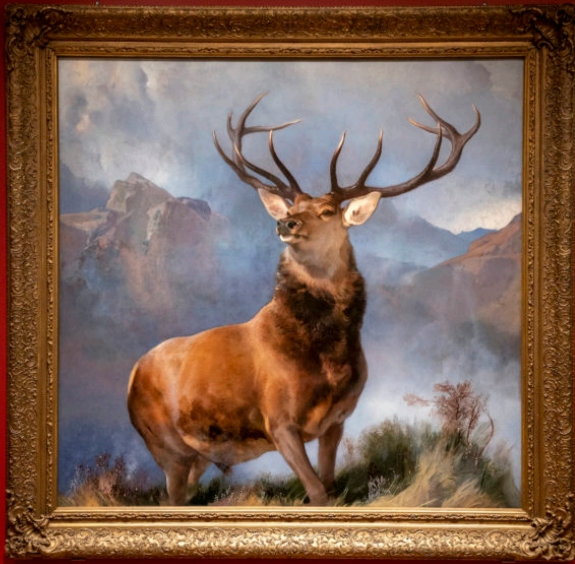
Sir Edwin Landseer, Monarch of the Glen. Oil on canvas. Purchased by the National Galleries of Scotland as a part gift from Diageo Scotland Ltd, with contributions from