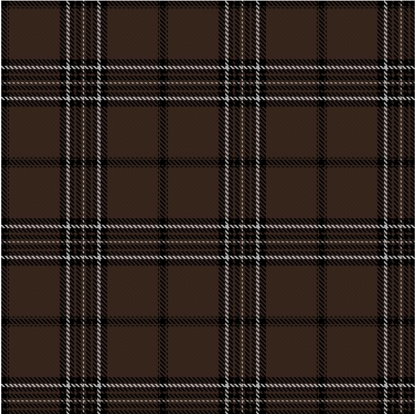
Bon Scott Touring