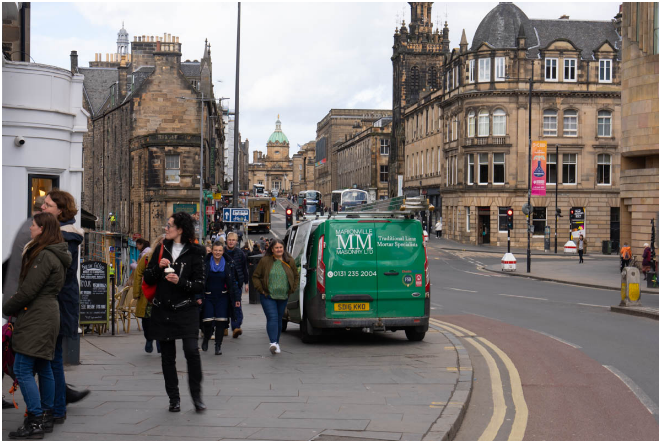
Van parked on George IV Bridge on pavement