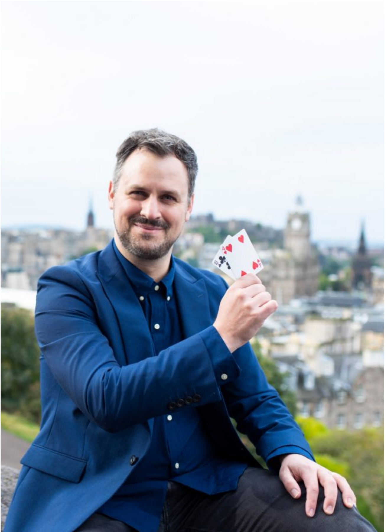
Kevin Quantum Geebz Photography