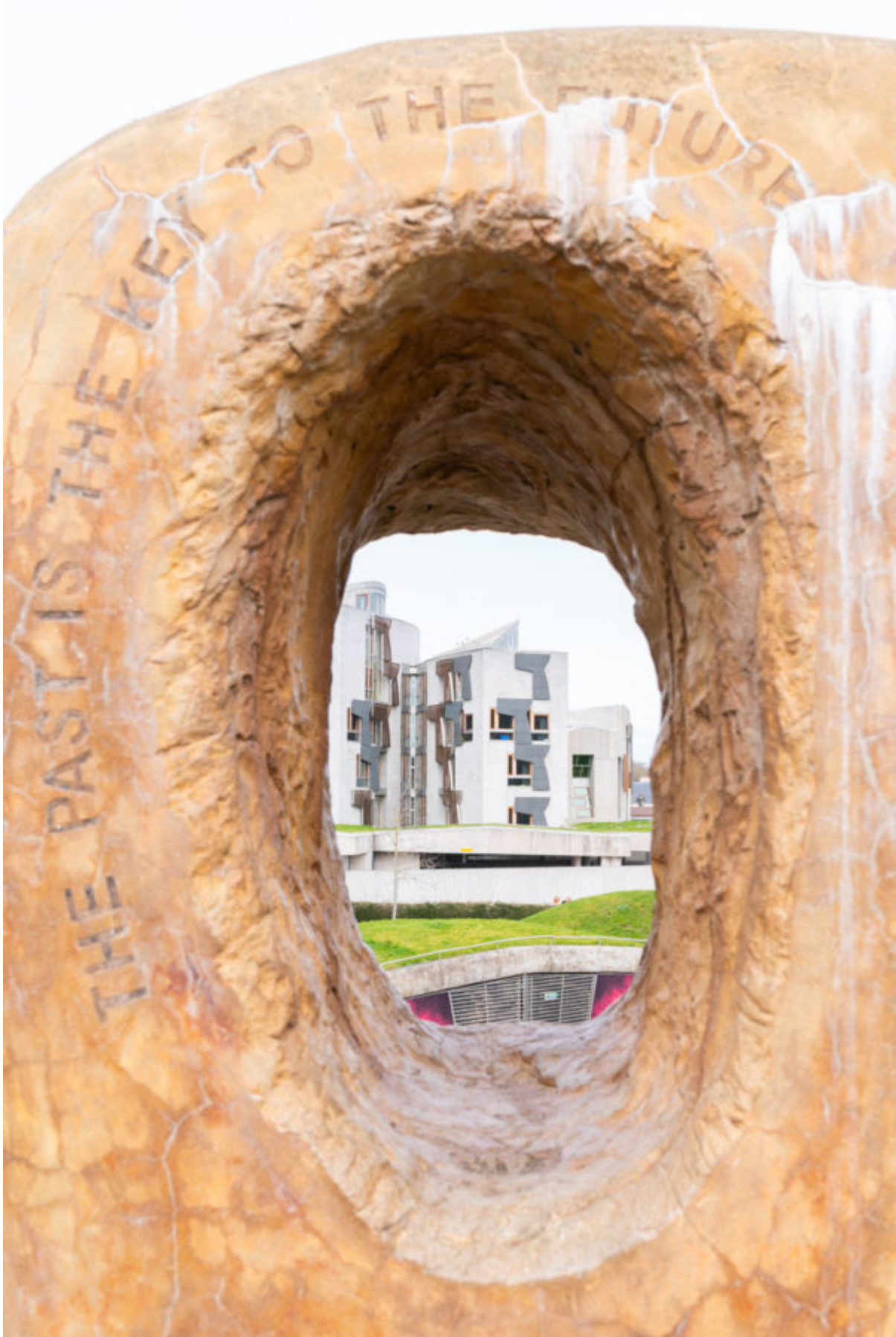
The Scottish Parliament.