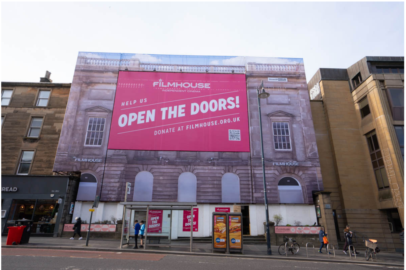
Filmhouse Edinburgh with Open the Doors banner outside

The total raised is just short of the target of £250,000 which will allow the team to refurbish and relaunch Filmhouse, the independent cinema on Lothian Road which has been closed for around 15 months.