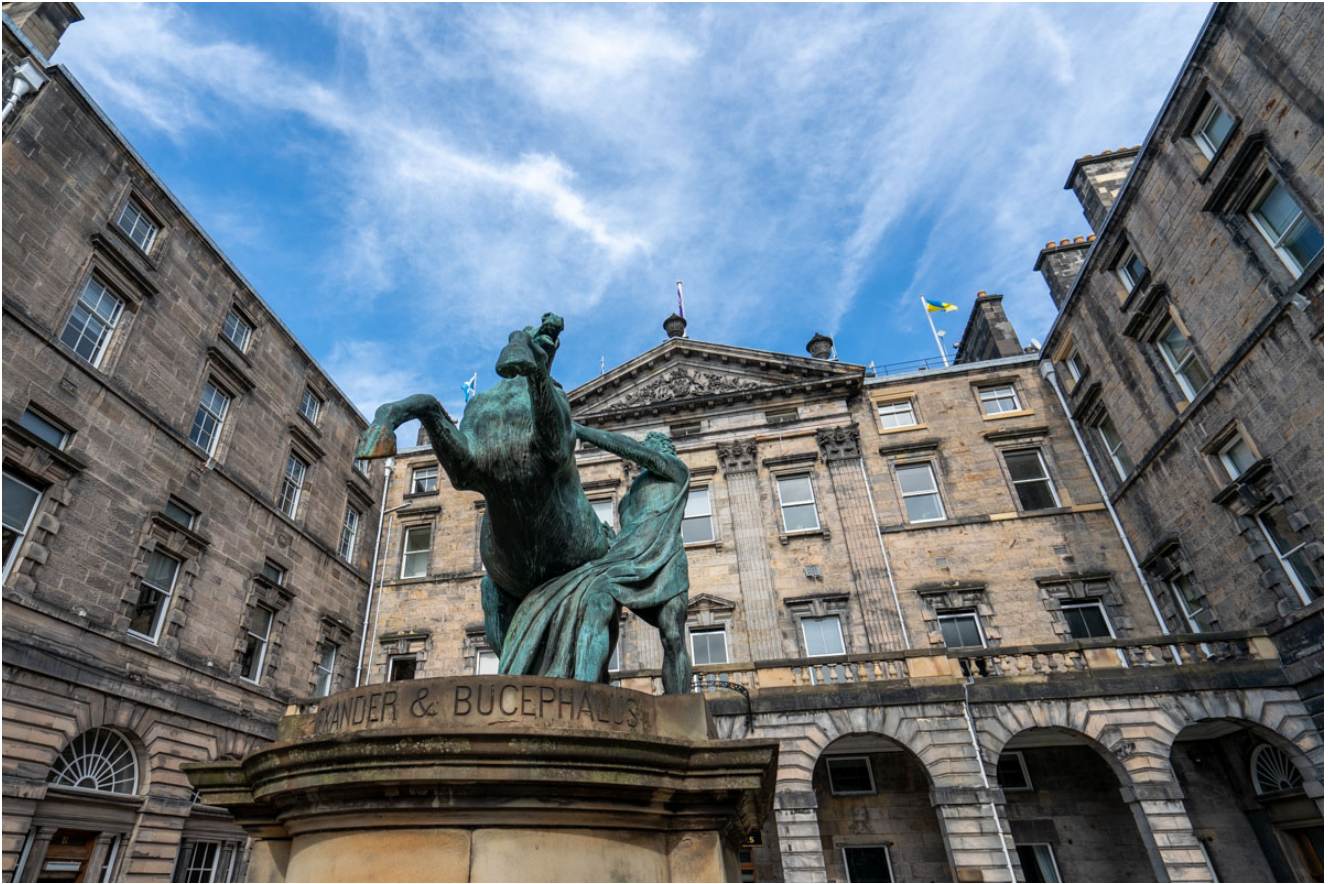
Edinburgh City Chambers.