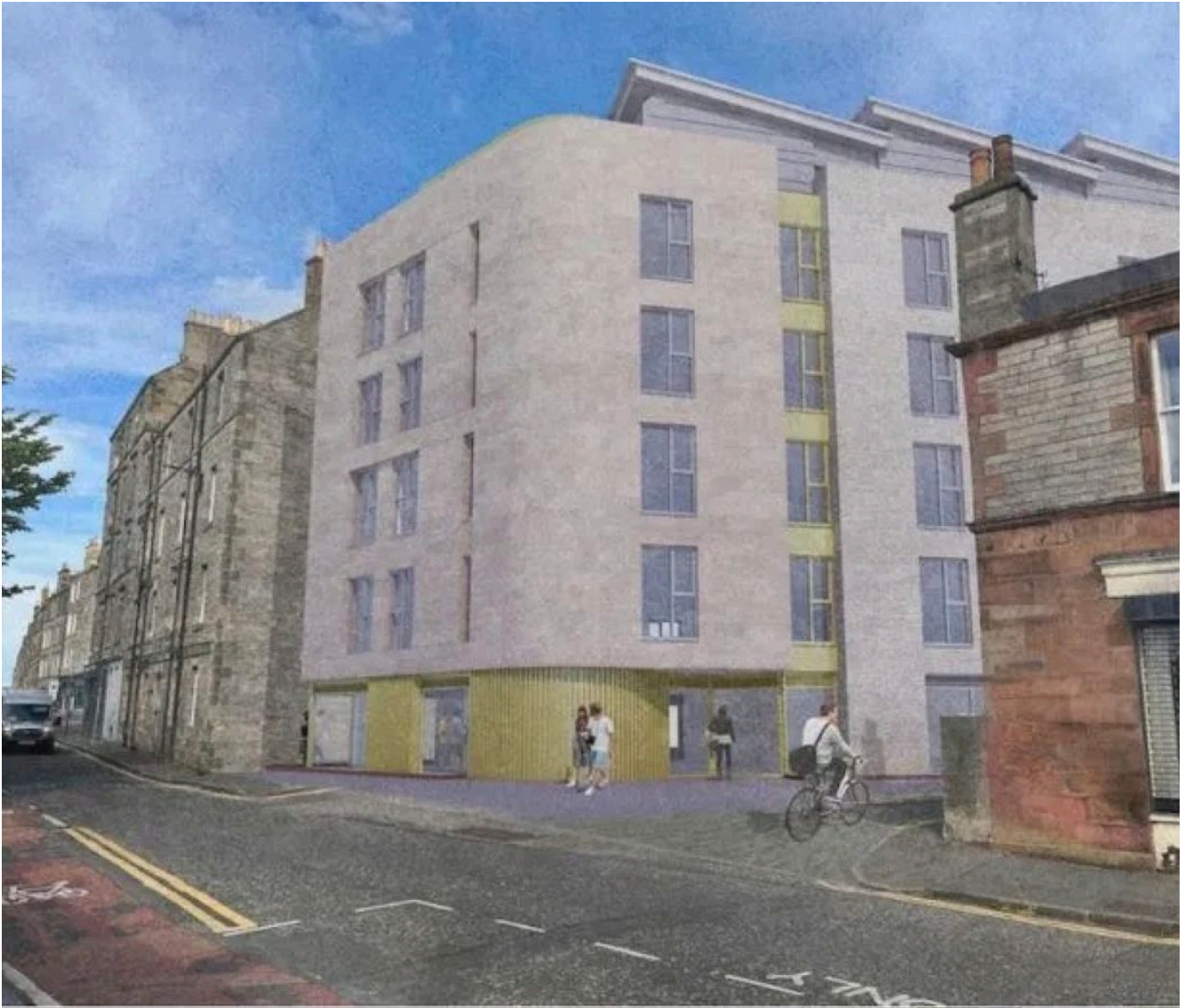
Plans for Eyre Place Lane