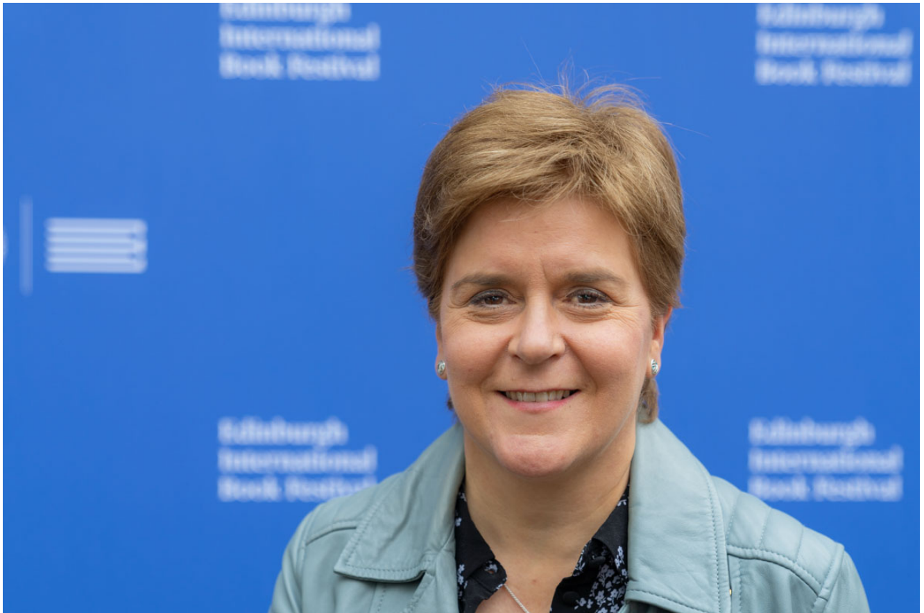
Nicola Sturgeon at the 2023 Edinburgh International Book Festival