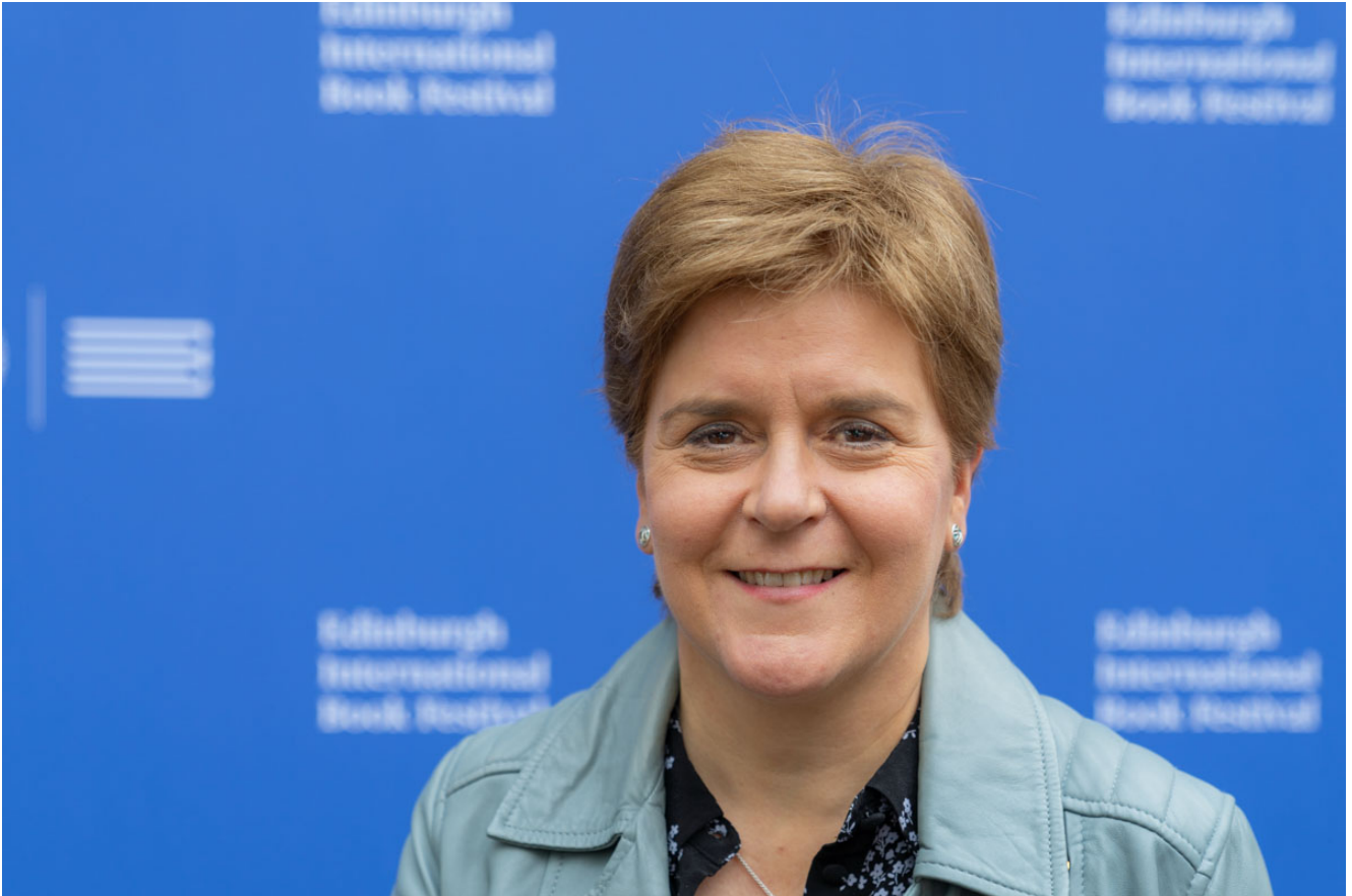
Nicola Sturgeon at the 2023 Edinburgh International Book Festival