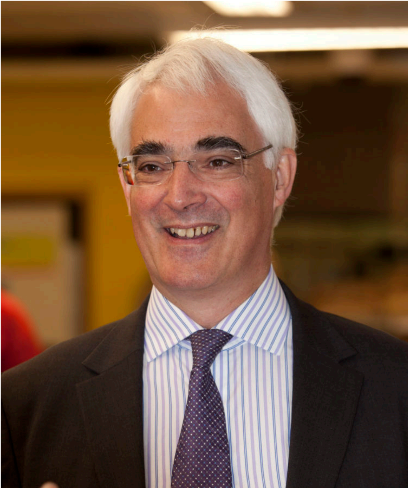
Alistair Darling