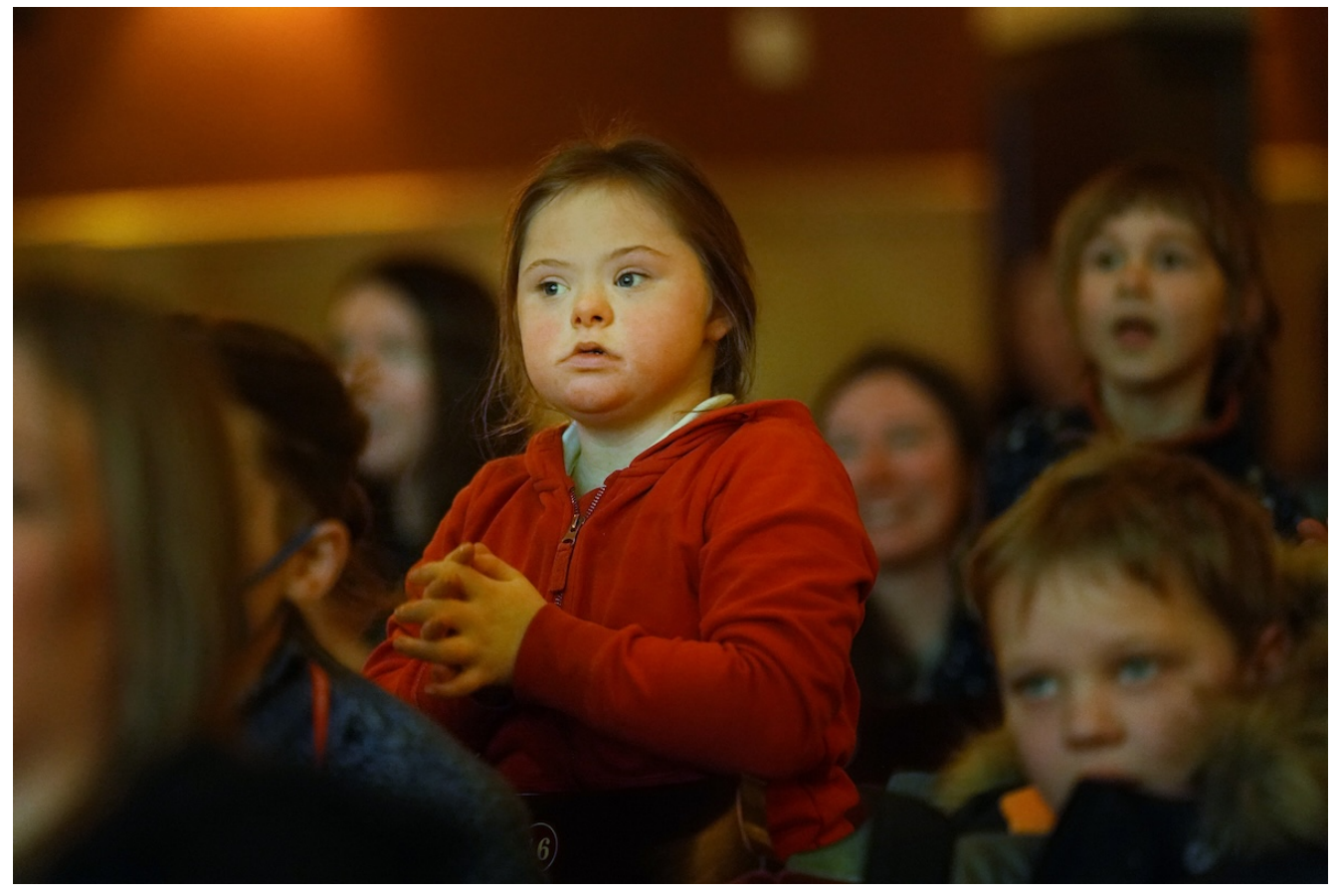
Festival Theatre — Relaxed Panto Capital Theatres