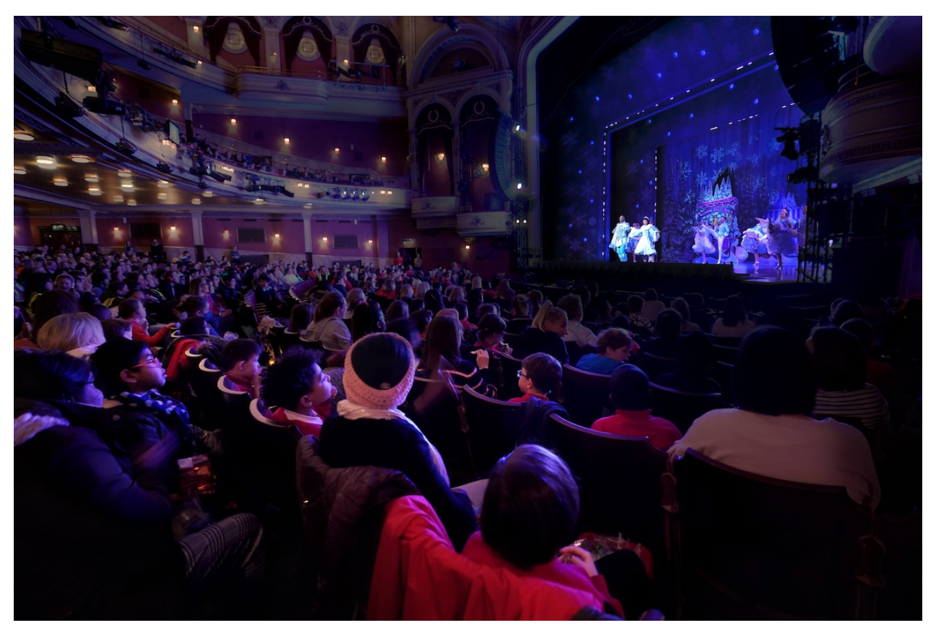
Festival Theatre - Relaxed Panto Capital Theatres