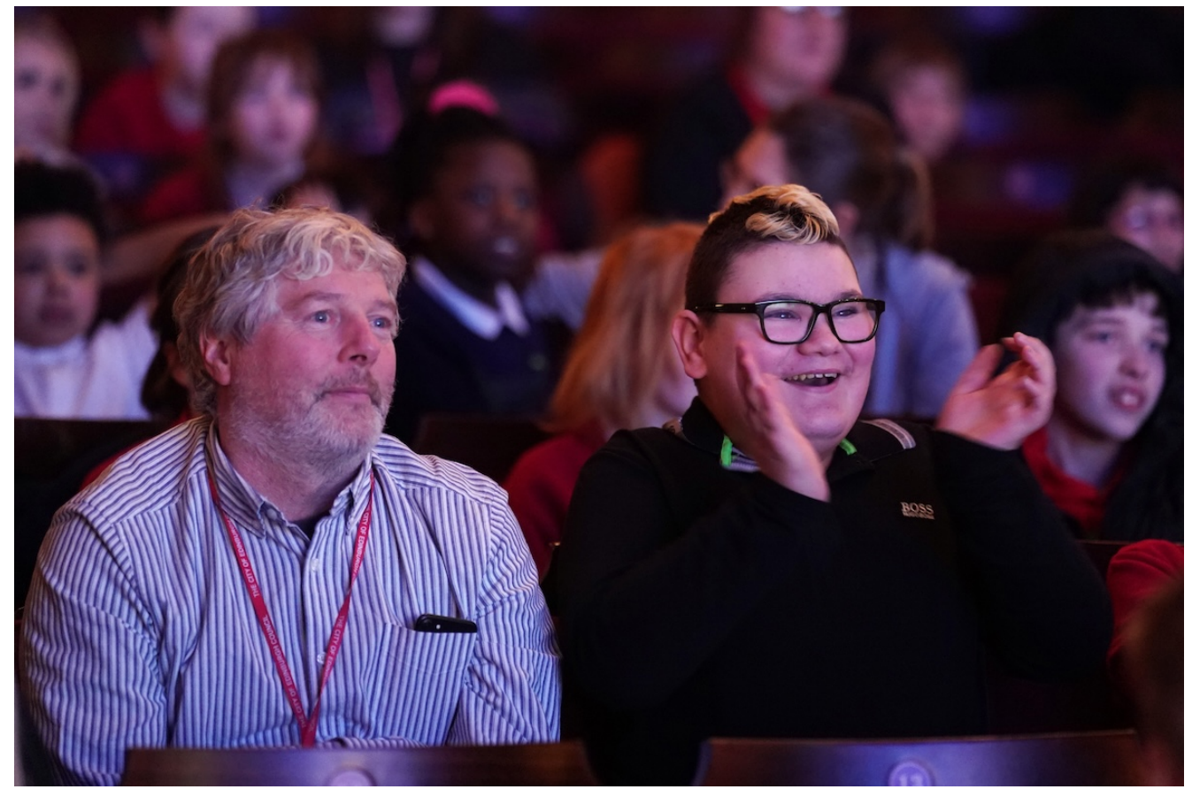
Festival Theatre — Relaxed Panto Capital Theatres