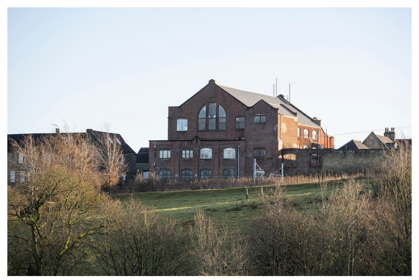
The Old Co Op bakery building is one of the largest of the many Co op buildings in West Calder.