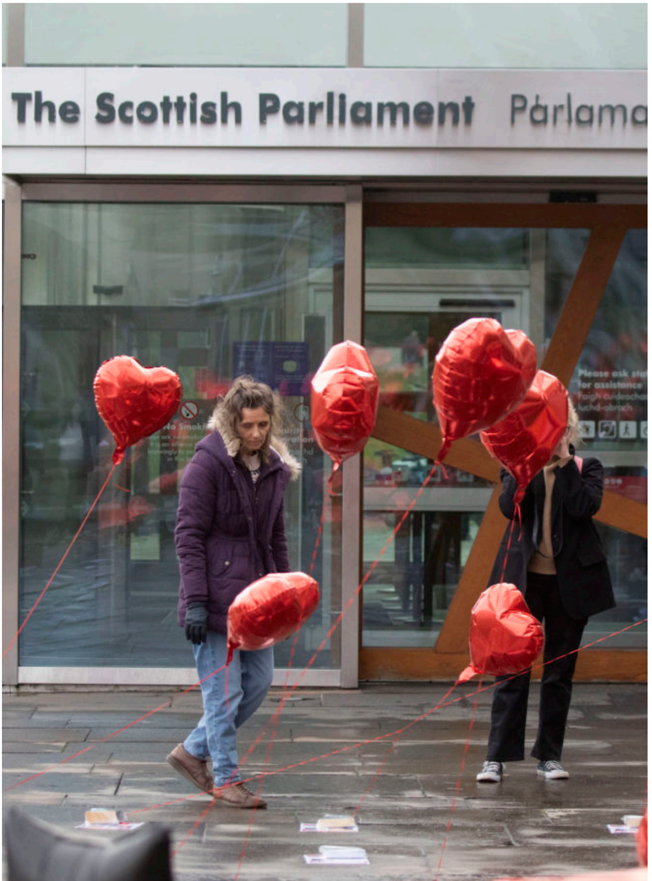
Silent Vigil Calling for the Release of the Hamas hostages