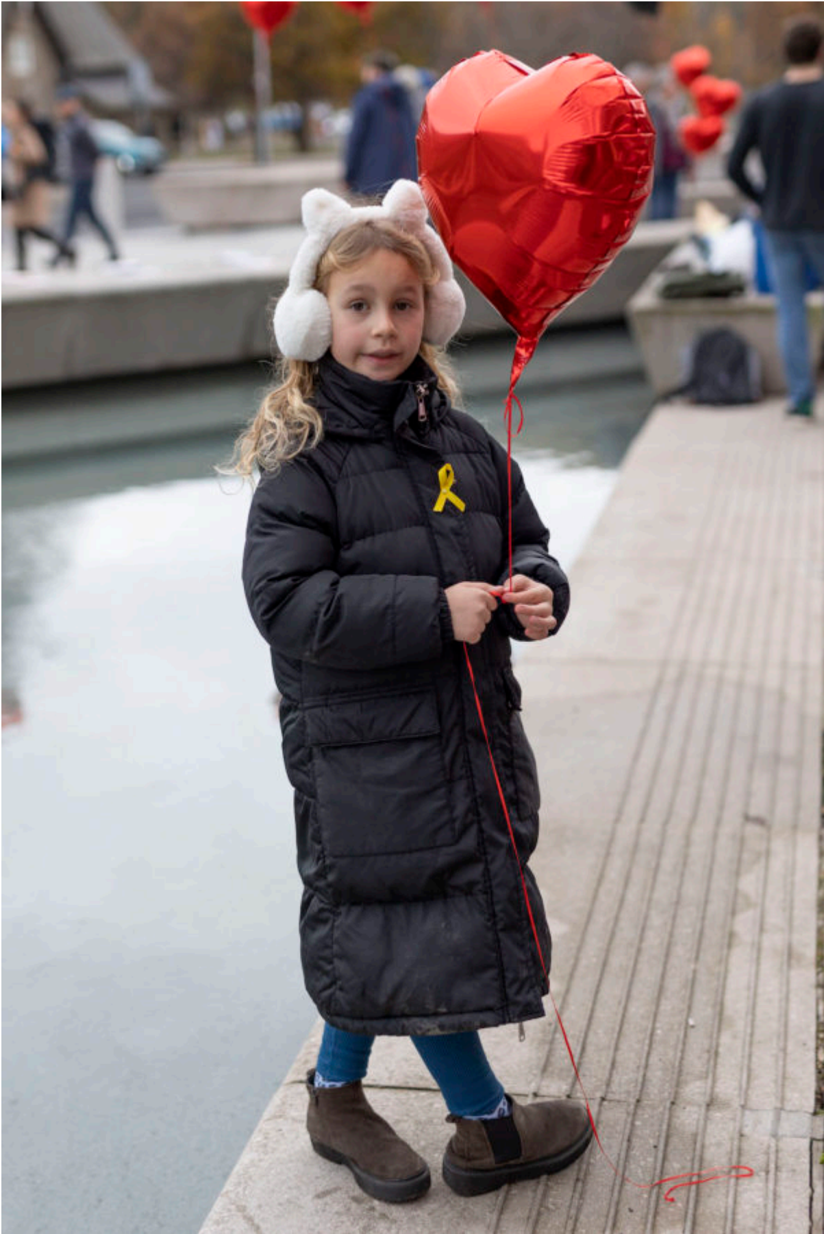
Silent Vigil Calling for the Release of the Hamas hostages