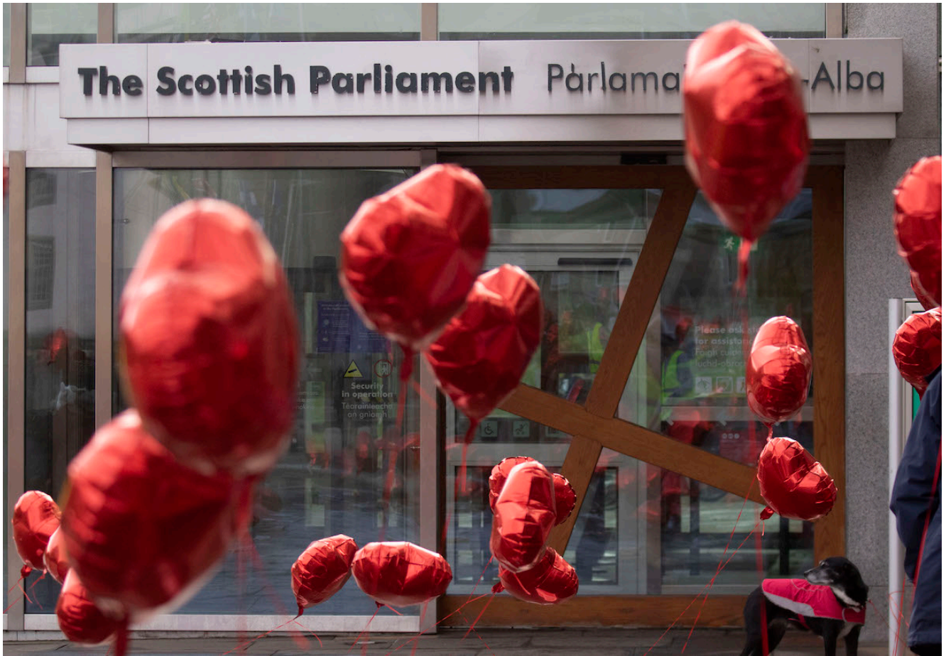
Silent Vigil Calling for the Release of the Hamas hostages