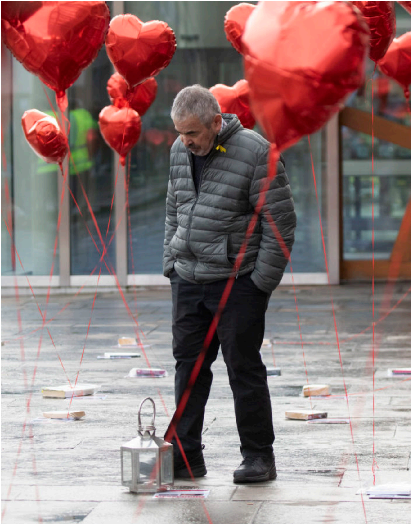
Silent Vigil Calling for the Release of the Hamas hostages