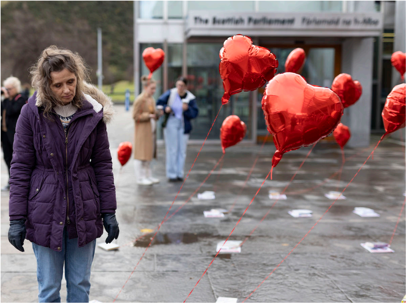
Silent Vigil Calling for the Release of the Hamas hostages