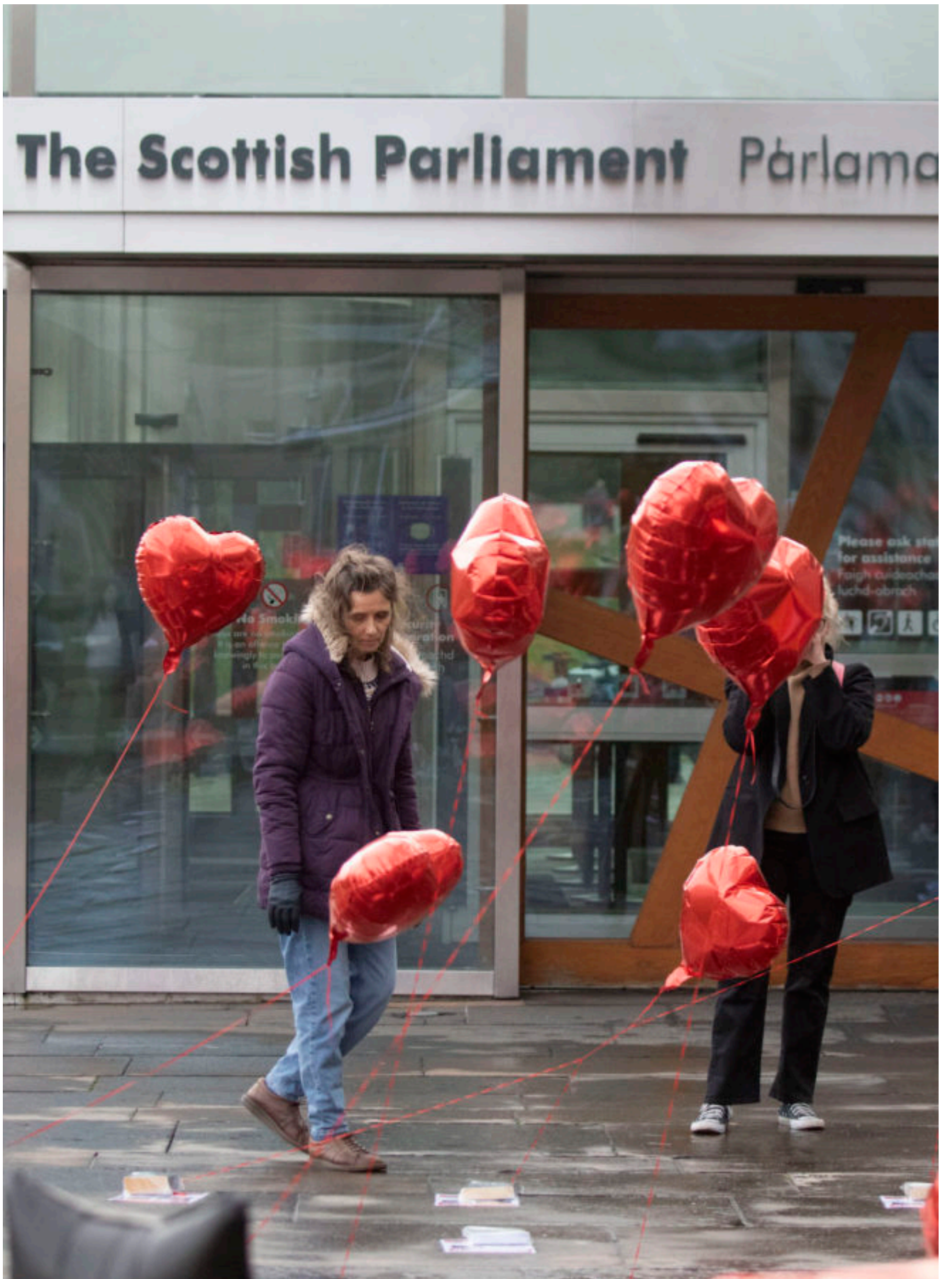
Silent Vigil Calling for the Release of the Hamas hostages