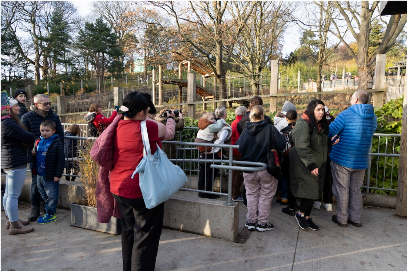
25/11/2023 Visitors during the last weekend to see the pandas in their inside enclosure before they go back to China.