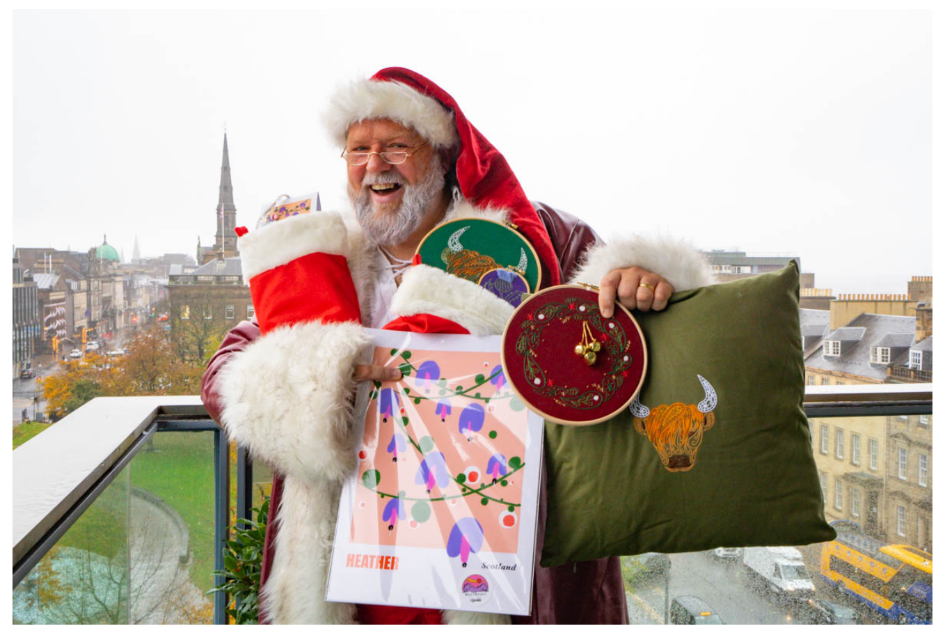
Santa is in town Santa Claus will tell Santa Stories in St Andrew Square this year.

Further information and tickets for events and attractions are available at <a href="https://www.edinburgh-christmas.com">www.edinburgh-christmas.com</a>