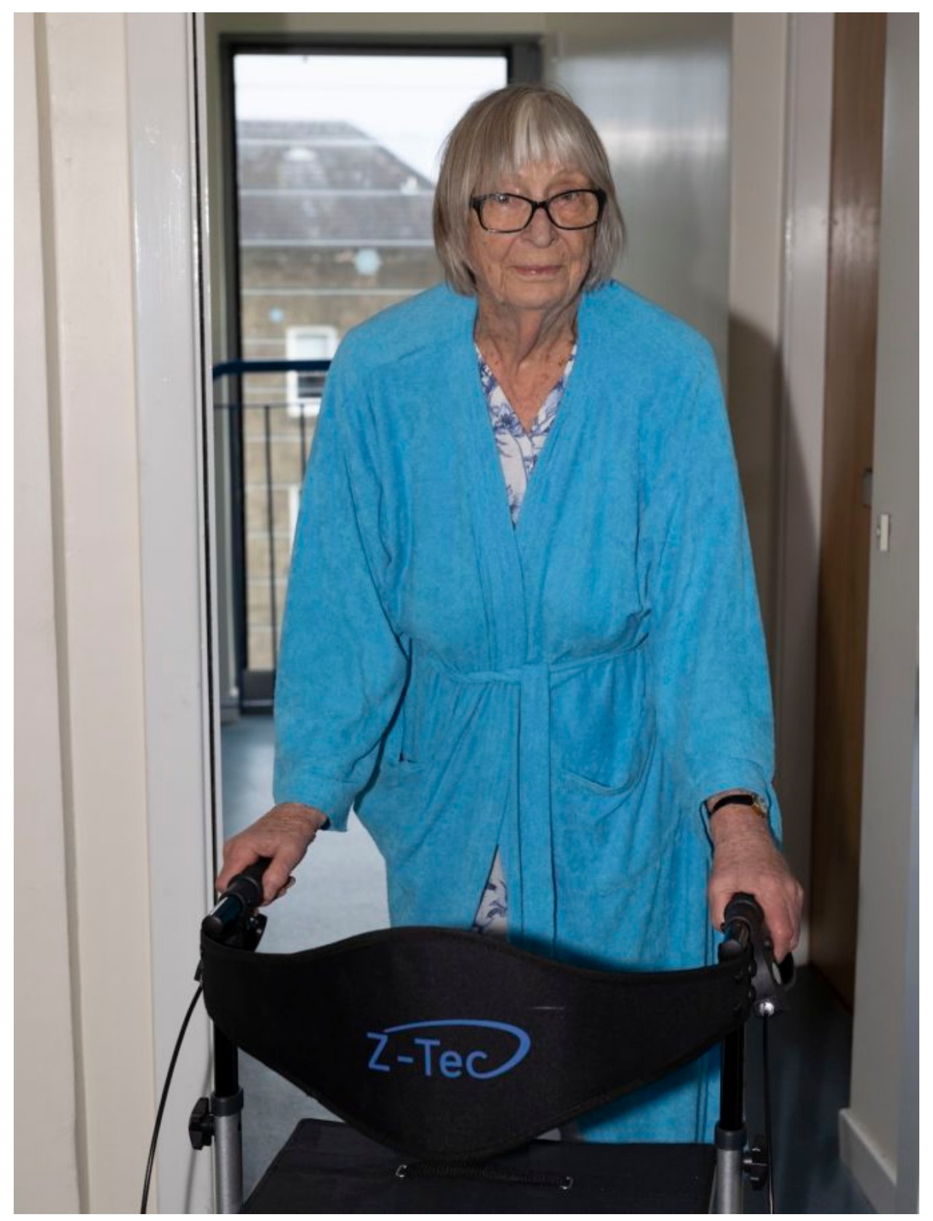
Residents at 6 St Triduanas Rest Edinburgh say they are