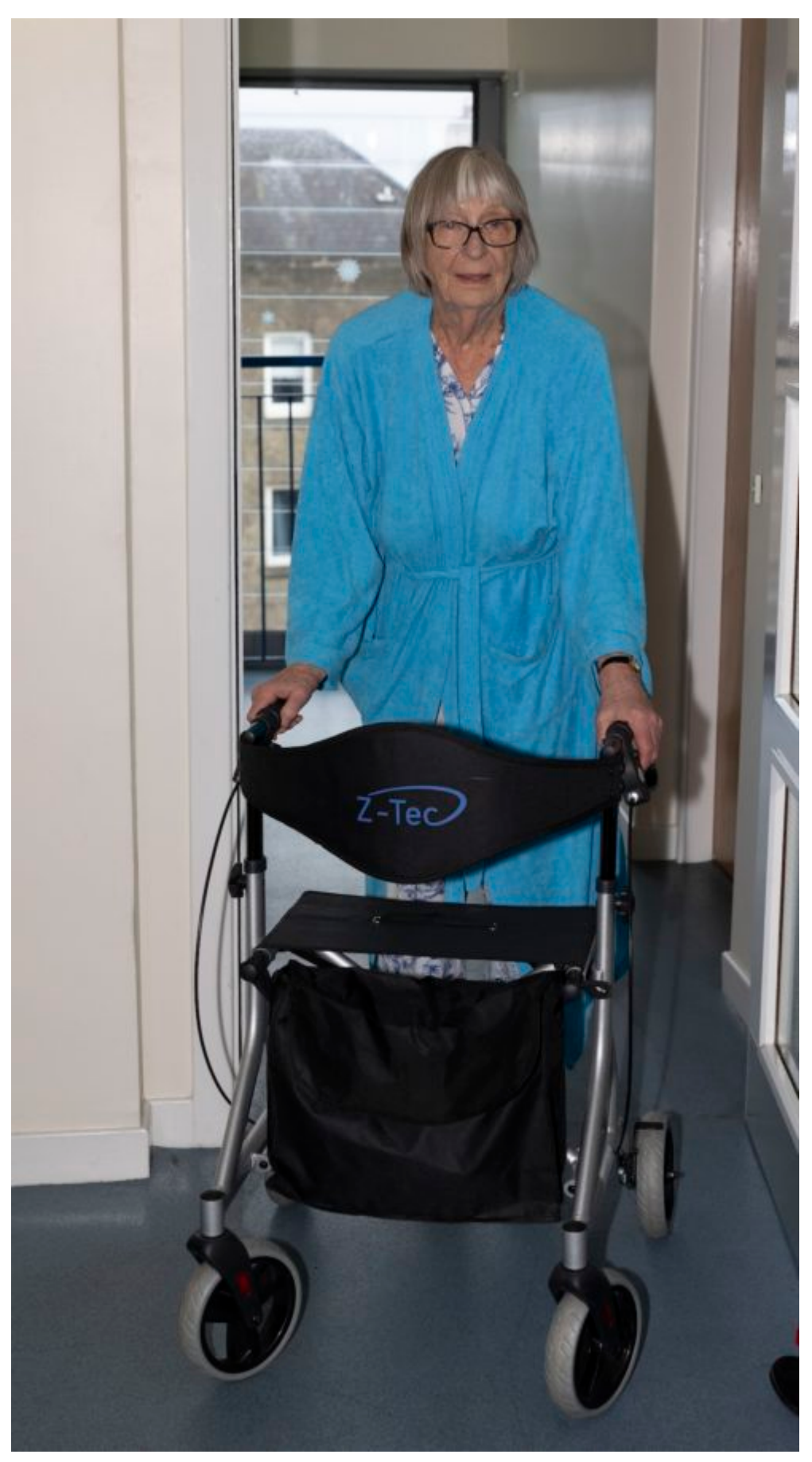
Residents at 6 St Triduanas Rest Edinburgh say they are prisoners in their own homes as the lift has not worked for two weeks.