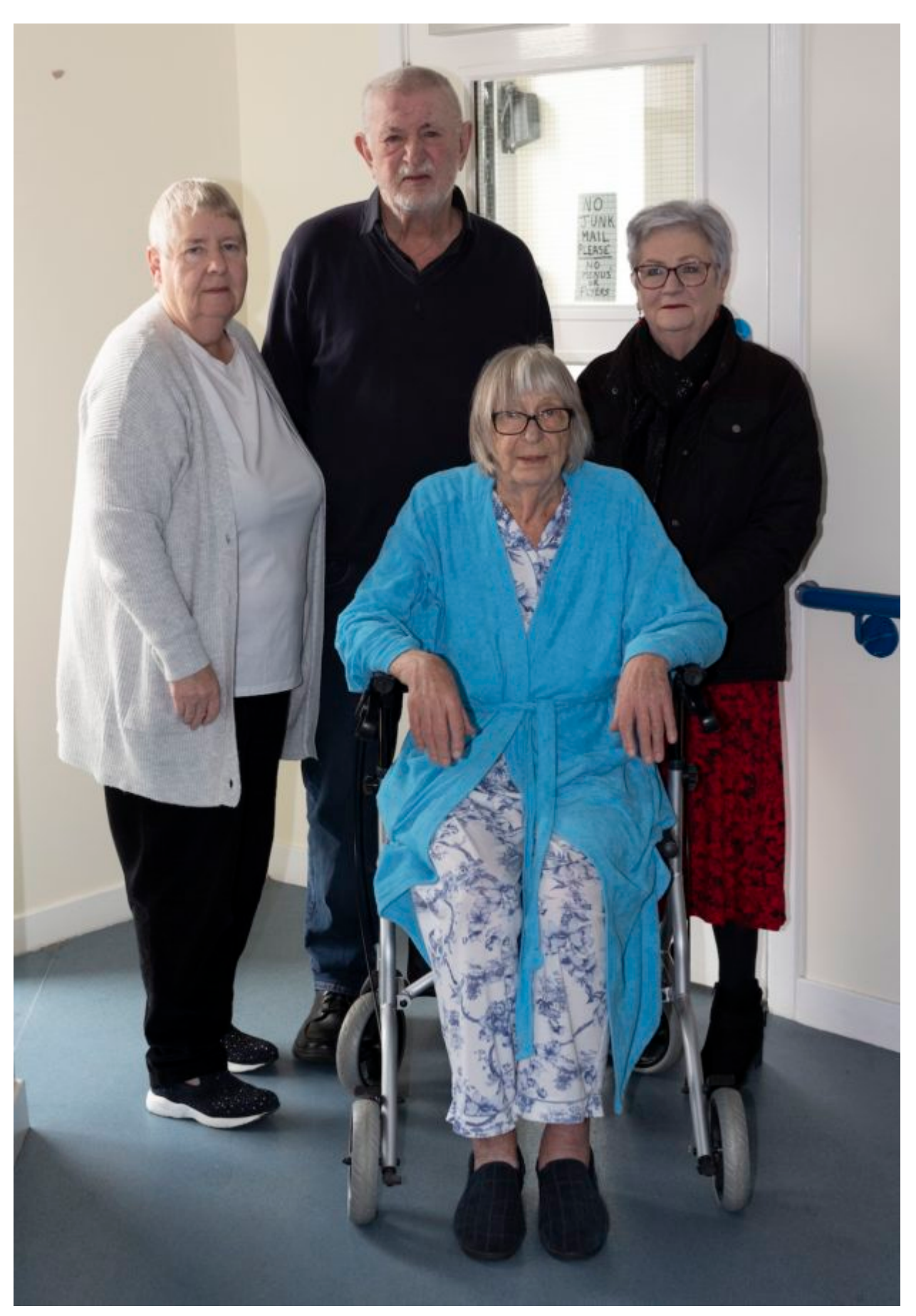
Residents at 6 St Triduanas Rest Edinburgh say they are prisoners in their own homes as the lift has not worked for two weeks.