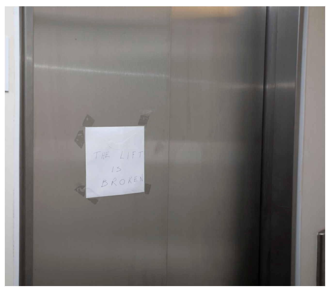
Residents at 6 St Triduanas Rest Edinburgh say they are prisoners in their own homes as the lift has not worked for two weeks.