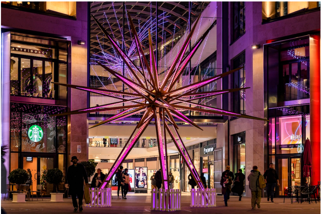
St James Quarter, Edinburgh, Christmas Light Switch on