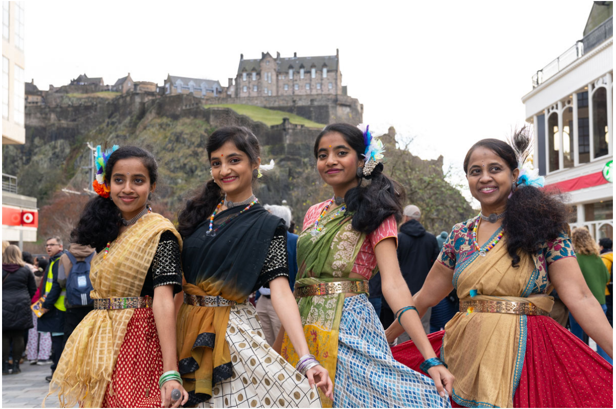
Edinburgh Diwali.