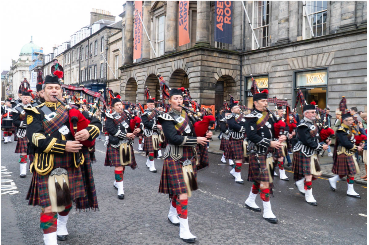
Edinburgh Diwali 2023 – the parade stepped off from St Andrew Square to the Ross Theatre in Princes Street Gardens