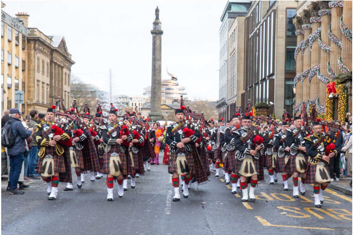
Edinburgh Diwali 2023 – the parade stepped off from St Andrew Square to the Ross Theatre in Princes Street Gardens