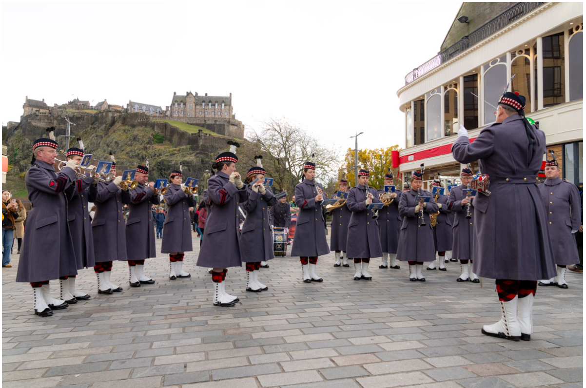
Edinburgh Diwali.