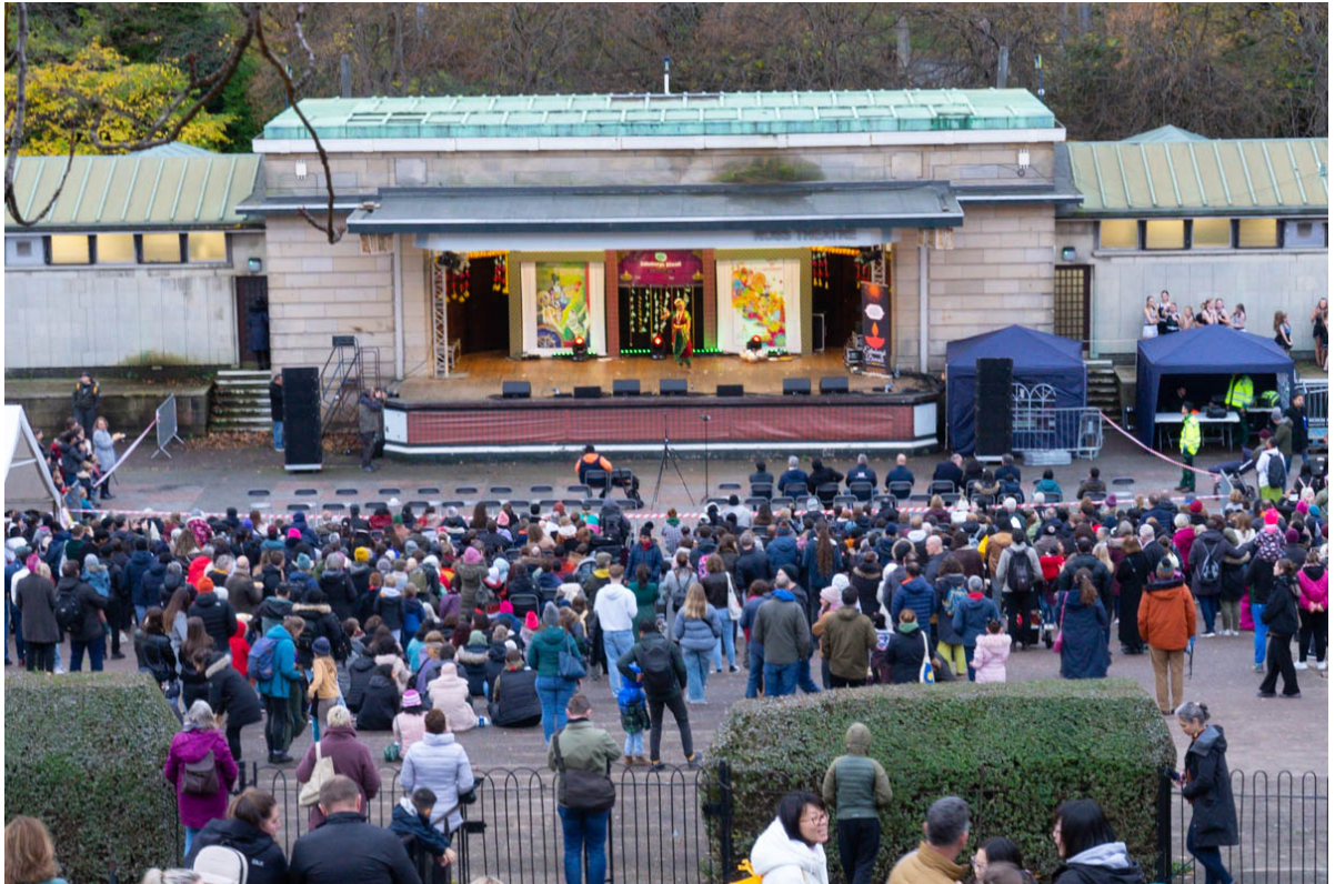
Edinburgh Diwali 2023 – the parade stepped off from St Andrew Square to the Ross Theatre in Princes Street Gardens