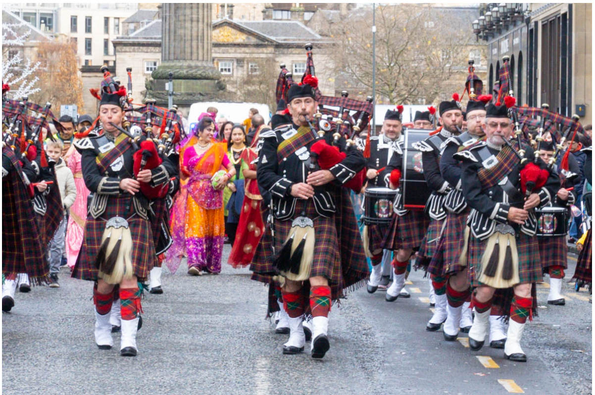
Edinburgh Diwali 2023 – the parade stepped off from St Andrew Square to the Ross Theatre in Princes Street