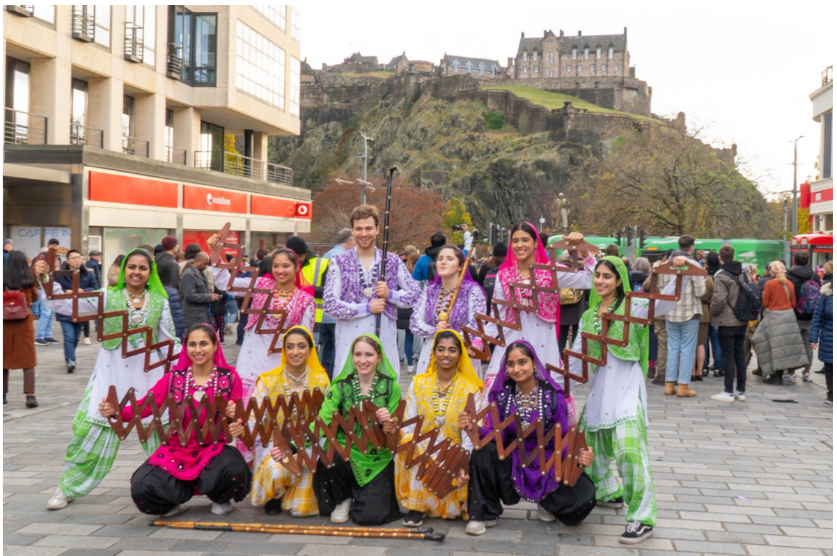
Edinburgh Diwali 2023 – the parade stepped off from St Andrew Square to the Ross Theatre in Princes Street Gardens