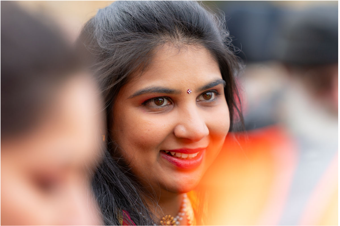
Edinburgh Diwali.