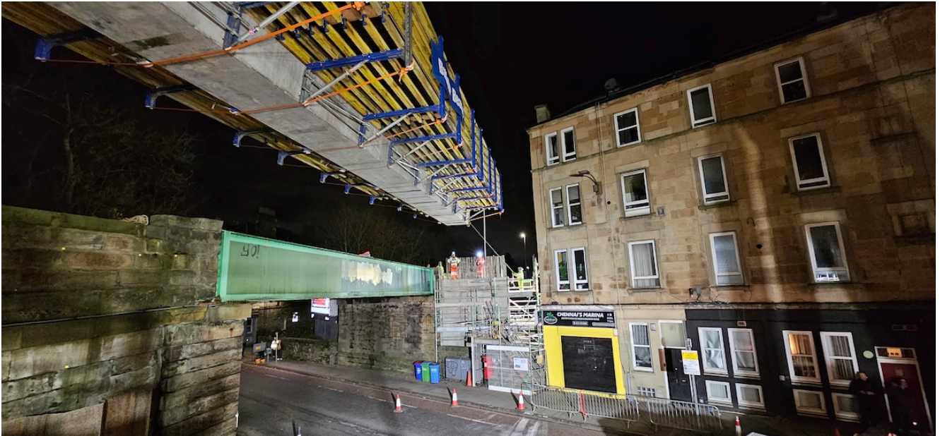
Dalry Road 21 November 2023