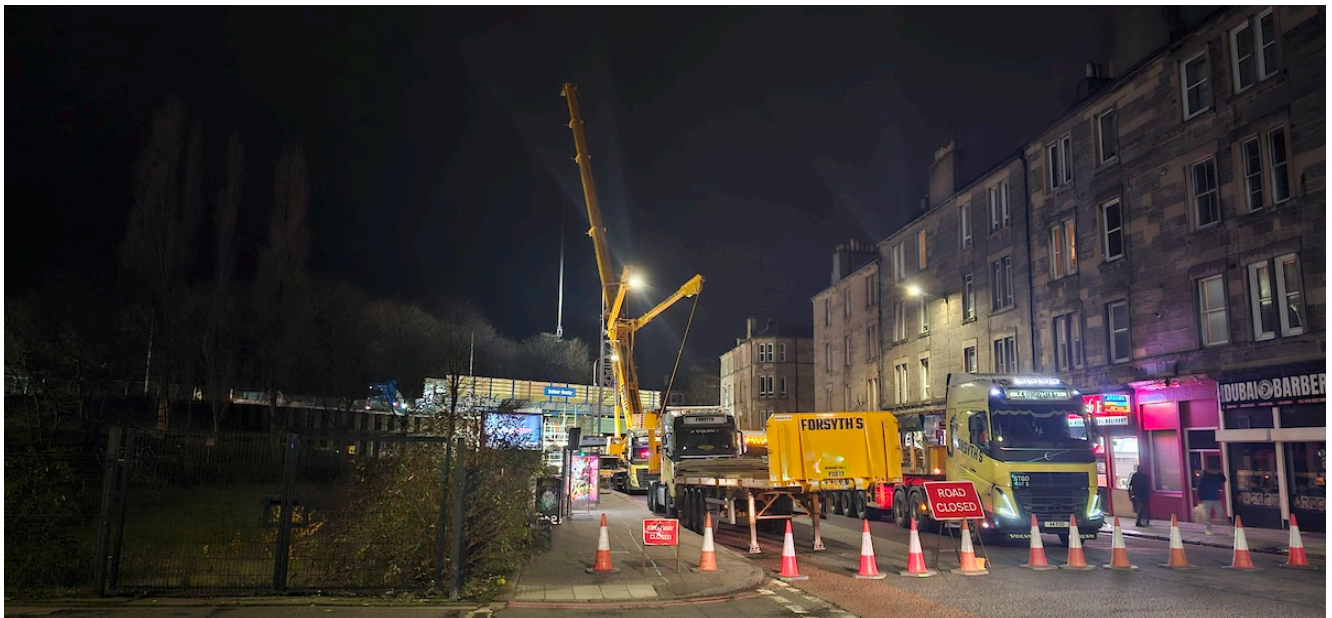
Dalry Road 21 November 2023