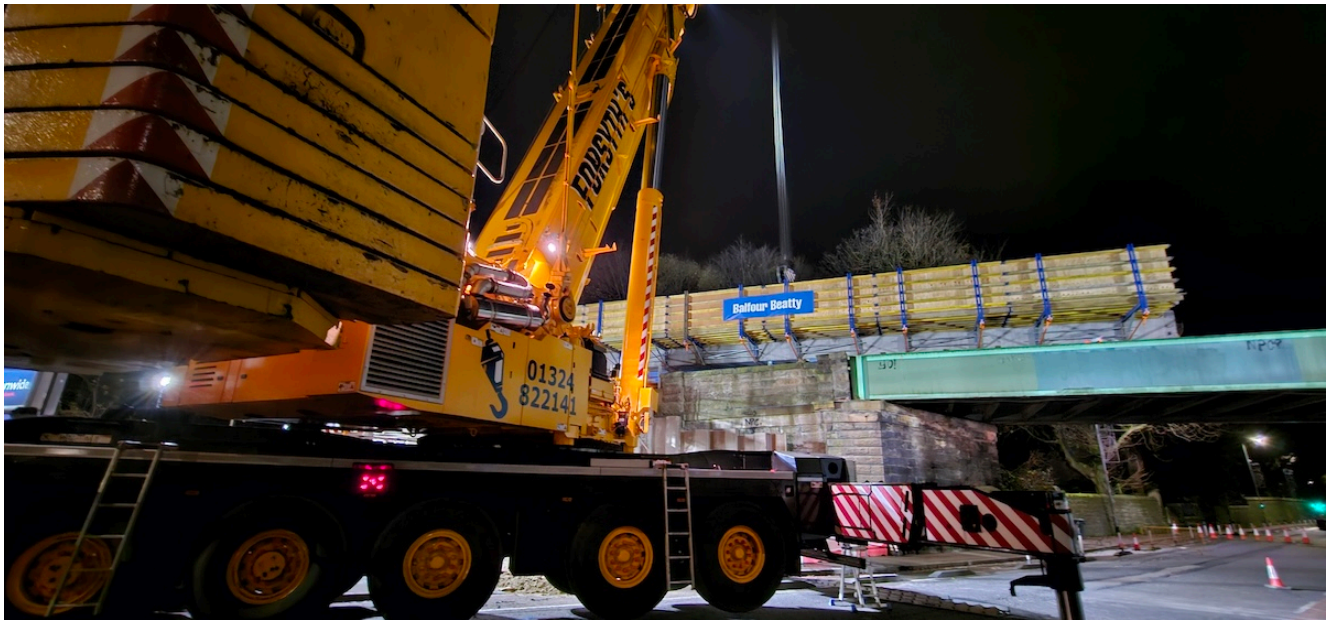
Dalry Road 21 November 2023