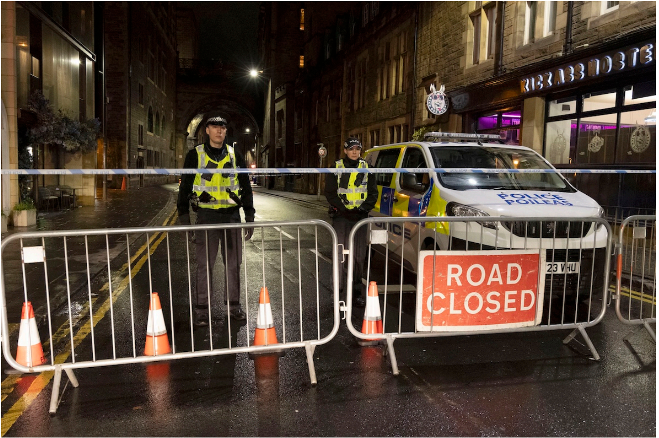
RTA Cowgate