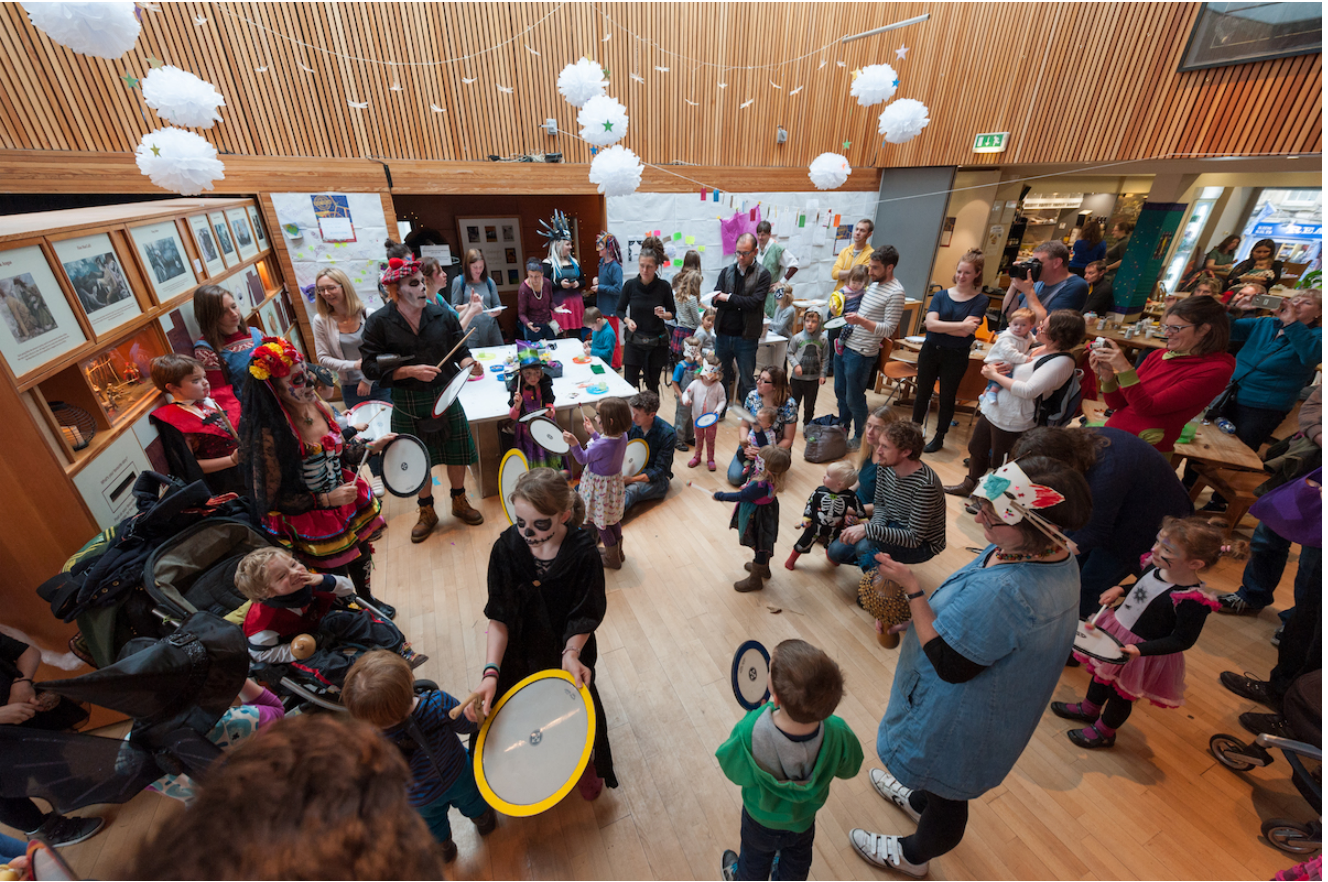
Family Samhuinn