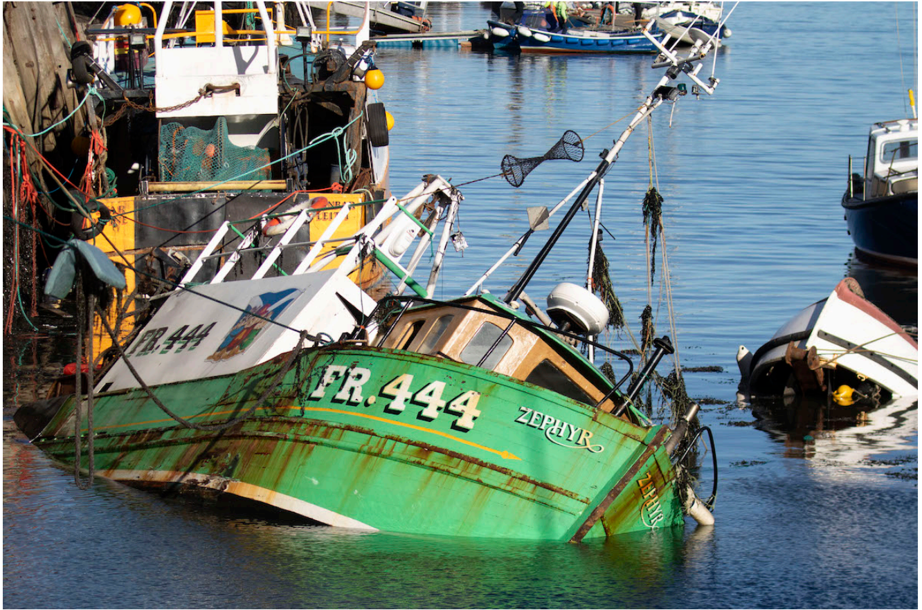
Sunken boats at Granton Harbour due to Storm Babet.