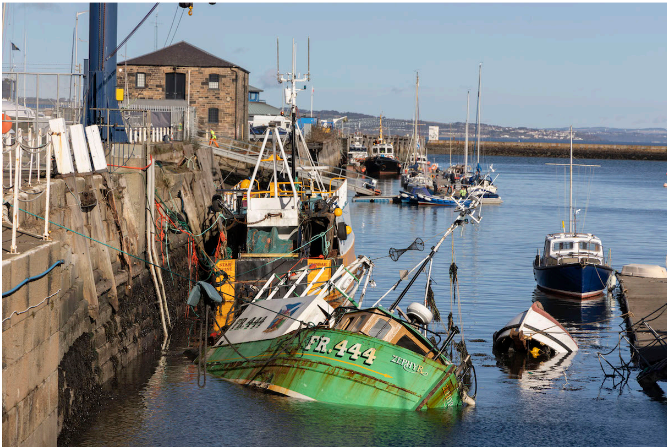
Sunken boats at Granton Harbour due to Storm Babet.