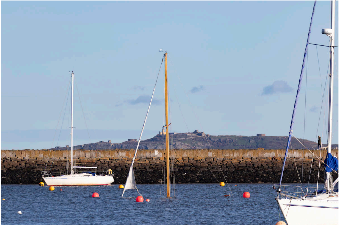
Sunken boats at Granton Harbour due to Storm Babet.