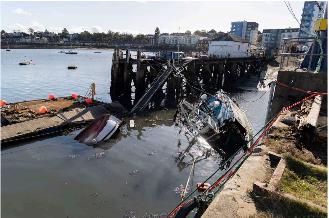
Sunken boats at Granton Harbour due to Storm Babet.